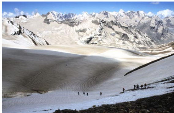
Crossing Pin Parvati pass (Garry Weare).

'A Long Walk in the Himalaya' was a reflection on the changing landscape of the Indian Himalaya. A commentary set against a backdrop of a five month trek, from the source of the Ganges to Kashmir, the narrative extended beyond descriptions of high passes and varied landscapes to include reflections on the impact of climate change, wildlife conservation and the plight of the snow leopard, development and change