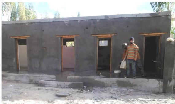
New toilet - bathroom block under construction.

The Managing Committee had also sanctioned financial assistance of Rs. 50,000/- to repair the two vehicles (One ambulance and one utility van for transportation of daily goods such as rations) that were damaged during the floods. The actual amount spent for is Rs. 67,653/- which the MC has now decided to sanction and disburse immediately.