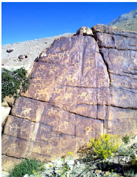
Petroglyphs near Tangtse gompa.

The India International Centre Library hosts the Himalayan Collection, which is a part of the Himalayan Club library comprising of rare manuscripts and books on