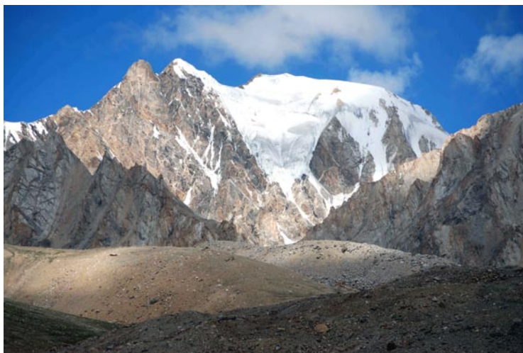
Lugzl Pombo (6414 m).

The views were glorious and no words can express the satisfaction and joy of standing there. It was indeed a unique spot. We were on a divide.... to one side we had the gentle peaks of the Tibetan plateau and to the other, the jagged peaks of the Karakoram. We spent some time taking pictures and enjoying the views around and then quickly started our descent.