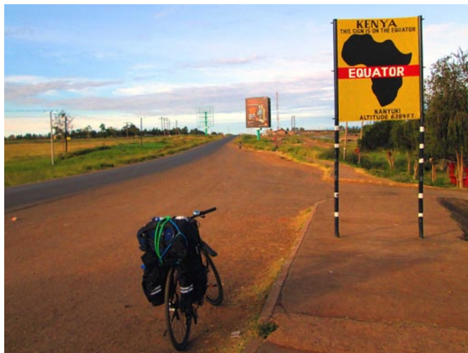
Starting point, Nanyuki, Kenya.

My route took me through the Kenyan Highlands, Great Rift Valley, the Masai Steppe, Foothills of Mt Kenya, Mt Meru and Mt Kilimanjaro, the Usambara Mountains, Coastal regions of Tanga, historical town and port of Dar es Salaam (and Zanzibar), Mikumi National Park, the Udzungwa Mountains, the great Ruaha river, forests of Sao Hill, hills of Mbeya, Lake Malawi, Livingstonia mountains, Tobacco growing regions of Kasungu, the great east road in Zambia, Luangwa river, Victoria falls, the Zambezi plains, Caprivi strip, Okavango river, Okavango flood plain, Bushman's land, Trans Kalahari Highway, the Namib desert and finally to the Atlantic coast in Walvis Bay and Swakopmund.