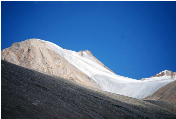
Petze Kangri (6130 m).

The team, sponsored by the Himalayan Club travelled from Leh to Pangong lake with our support staff. We trekked two days from the village of Yurgo with a caravan of horses carrying ration, camping gear, ropes and technical equipment for the team.