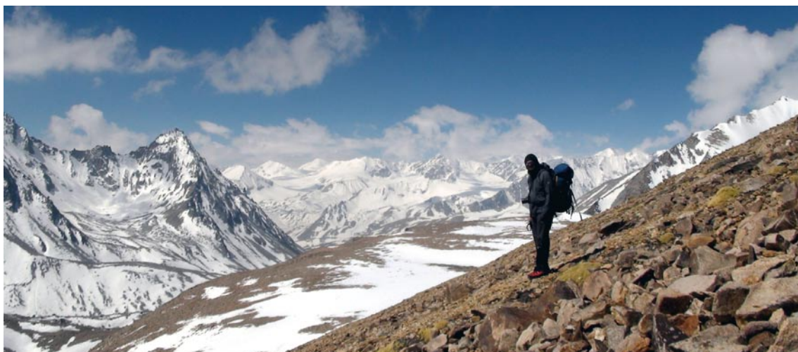
View towards the Saraswati valley.