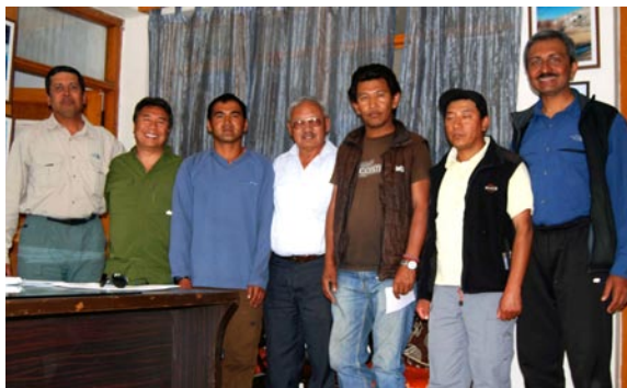
Meeting with village council members.

received by email along with photographs of the repaired vehicles and the new toilet/bathroom block under construction.