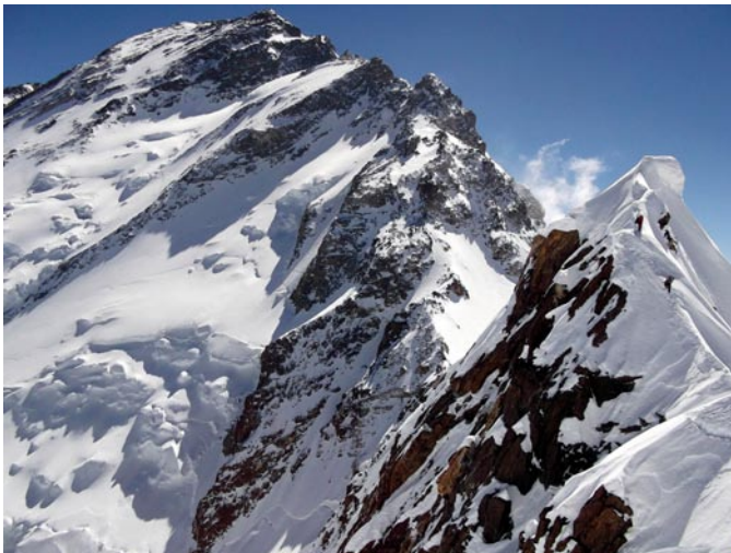
Mazeno Ridge (Sandy Allan).

The complete west-southwest or Mazeno ridge is a monstrous undertaking: over eight summits to the junction with the 1976 Schell route, then via the upper section of this to Nanga Parbat's summit. The Mazeno is the longest arête on any 8000 m peak; a staggering 13 km from the Mazeno pass at 5377 m to where it joins the south-southwest ridge or Schell route, then another two kilometres up (via slopes on the Diamir flank) to the summit. It is a totally committing venture, as escape on either flank seems impossible until reaching the Mazeno col, where the Schell route comes up from the Rupal flank.