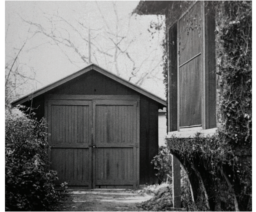
The HP Garage in 1939 (top) and restored in 2005 (bottom).

Tucked away on a quiet, tree-lined residential street near Stanford University, the HP Garage stands today as the enduring symbol of innovation and the entrepreneurial spirit. It was in this humble 12x18-foot building that college friends Bill Hewlett and Dave Packard first pursued the dream of a company of their own. Guided by an unwavering desire to develop innovative and useful products, the two men went on to blaze a trail at the forefront of the electronics revolution.