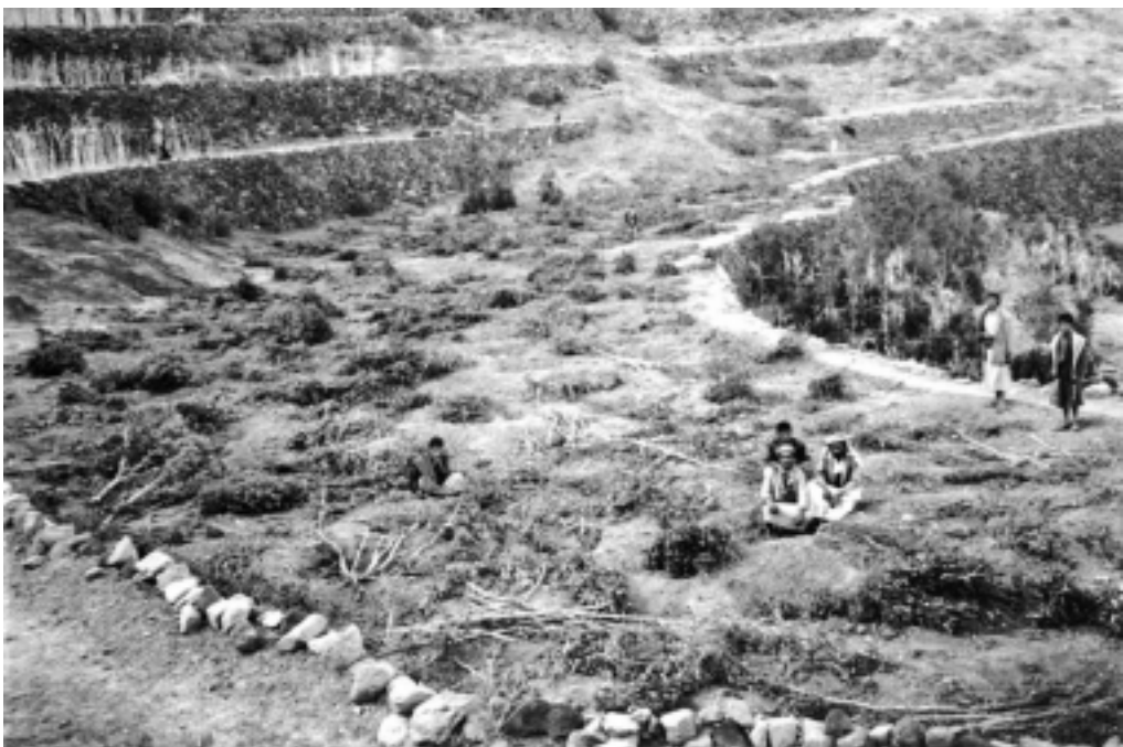
Qat uprooting Campaign of the Bohra Community in the /Harâz mountains

In Yemen, the Bohra community is today quite small and numbers only around 12,000 persons. Some 3,000 of them (589 families) live in the eastern /Harâz scattered over 52 villages. The bigger ones among these settlements are home to up to 60 families (e.g. al-Manqadha, Jerma, al-'Ubarât or Saw/t), whereas in some of the smallest ones only one or two families have resisted the drift to the cities and emigration to India or East Africa (e.g. al-Qishba, al-Thajra or al-Ashyab). Other Bohra communities in Yemen include Sanaa with some 6,000 persons, and smaller congregations in Ibb, Ta'izz, al-Hodeïda and Aden.¹8 By mainstream Shiites and Sunnite Yemenis alike, the Bohra are today viewed with caution and suspicion. Development efforts in the /Harâz financed with community funds from India are jealously followed and many false rumors regarding Bohra dogma are circulating¹9.