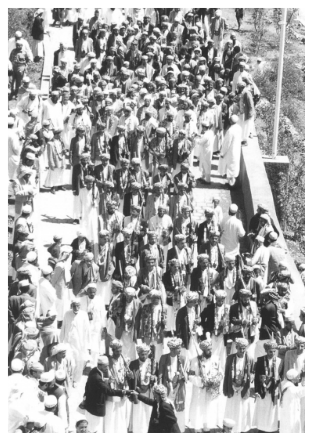
A Bohra mass marriage in al-/Hu/tayb sponsored by the Dâ'î al-Mu/tlaq