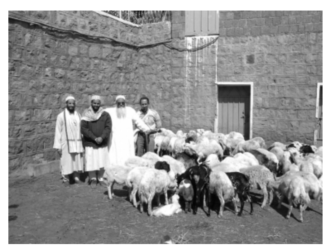
The animal husbandry facility at al-/Hu/tayb