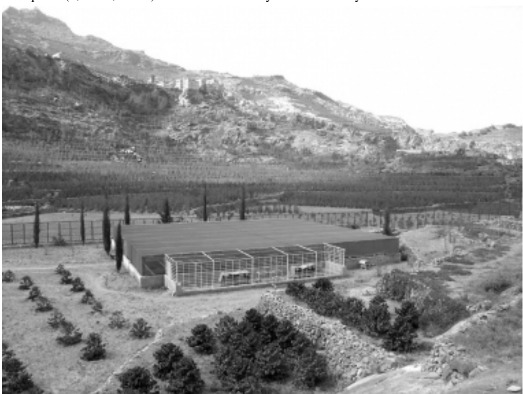
The coffee nursery at Qâ' al-Hajjar (2,150 m a.s.l.).

In a second nursery in al-/Hu/tayb almond trees have been propagated and transplanted successfully. Also six varieties of olives were grown, but cultivation experiments in seven locations of /Harâz, Dhamâr and Ibb failed (in elevations of 1,800-2,400 m). Mango seedlings purchased in Zabîd were planted with success on the southeastern flank of the /Harâz in Wâdî Manqadha (1,300-1,500 m) but it will take 4-7 years before they bear fruit.