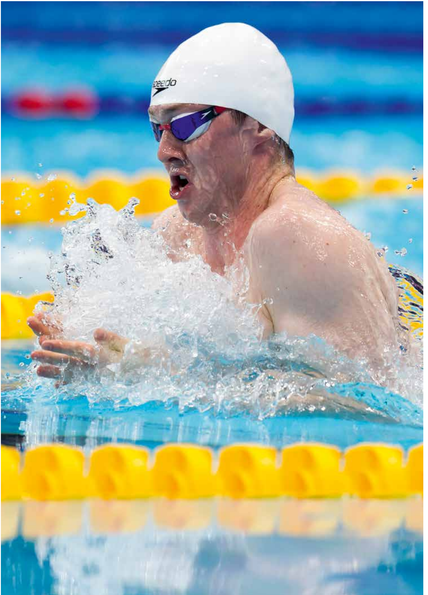
Ross Murdoch, Great Britain, races to the line in the men's 200m breaststroke in 2016. Murdoch took the gold by seven hundredths of a second. It was his first European gold medal