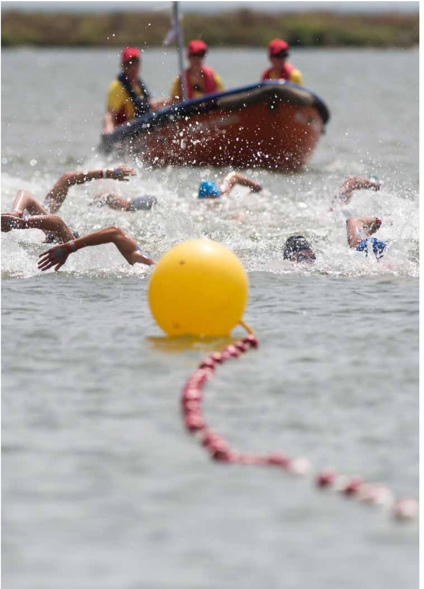
Further action from Horn, Netherlands during the 2016 European Open Water Championships. Italy continues to lead the all-time medals table just ahead of Russia