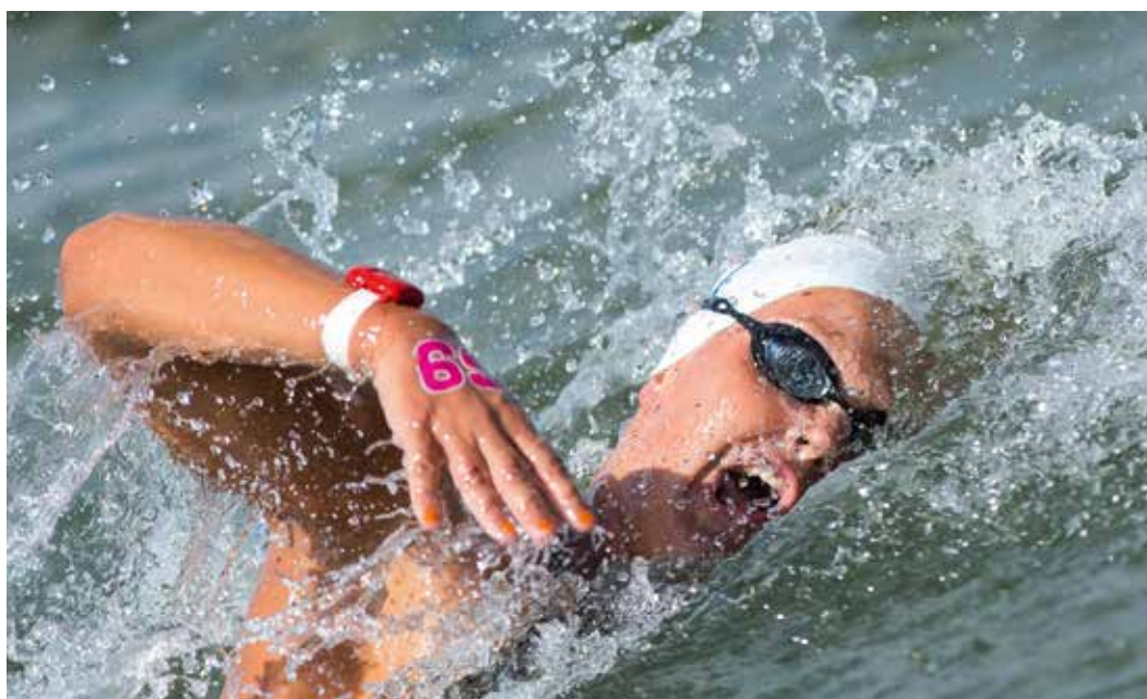
2014 European 10k open water champion, Sharon van Rouwendaal, Netherlands, was edged into 3rd place in 2016. She did, however, win the 2016 Olympic title