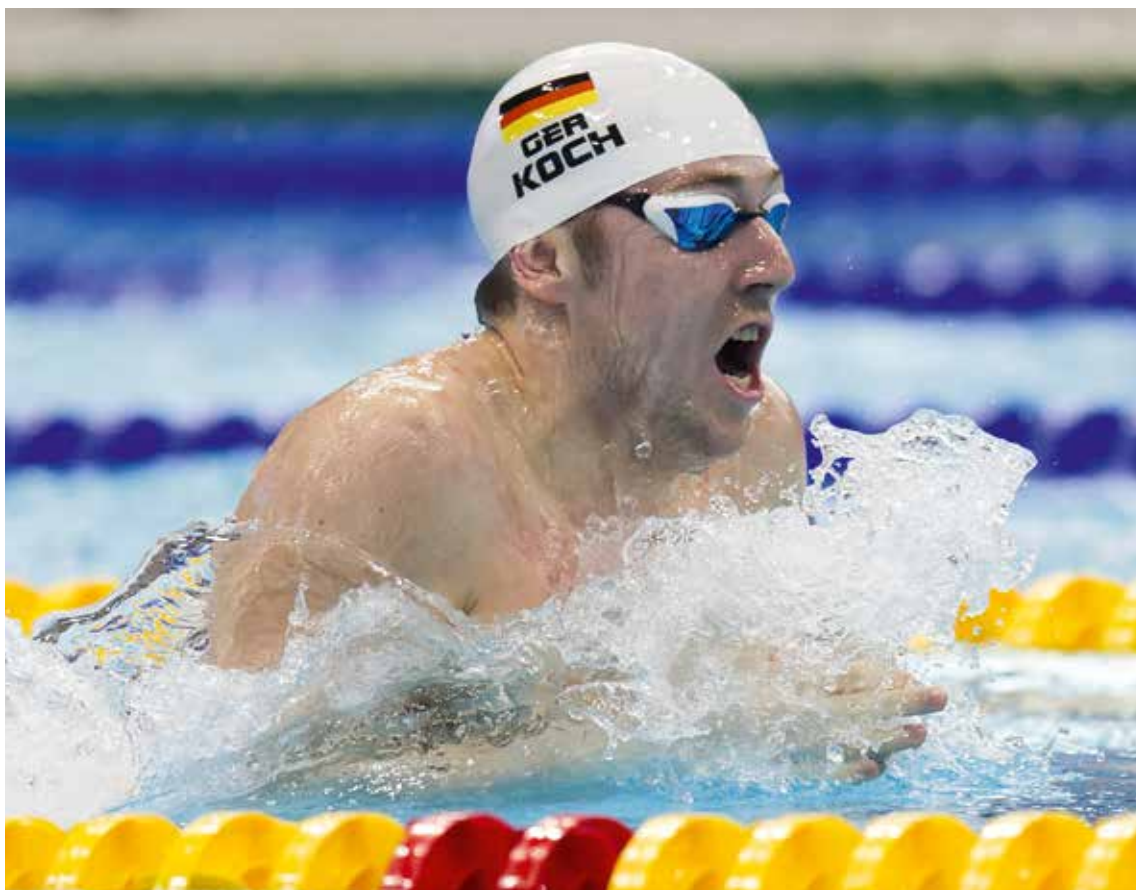
Marco Koch (Germany) just failed to win a second 200m breaststroke title in succession in London. He finished second to Britain's Ross Murdoch