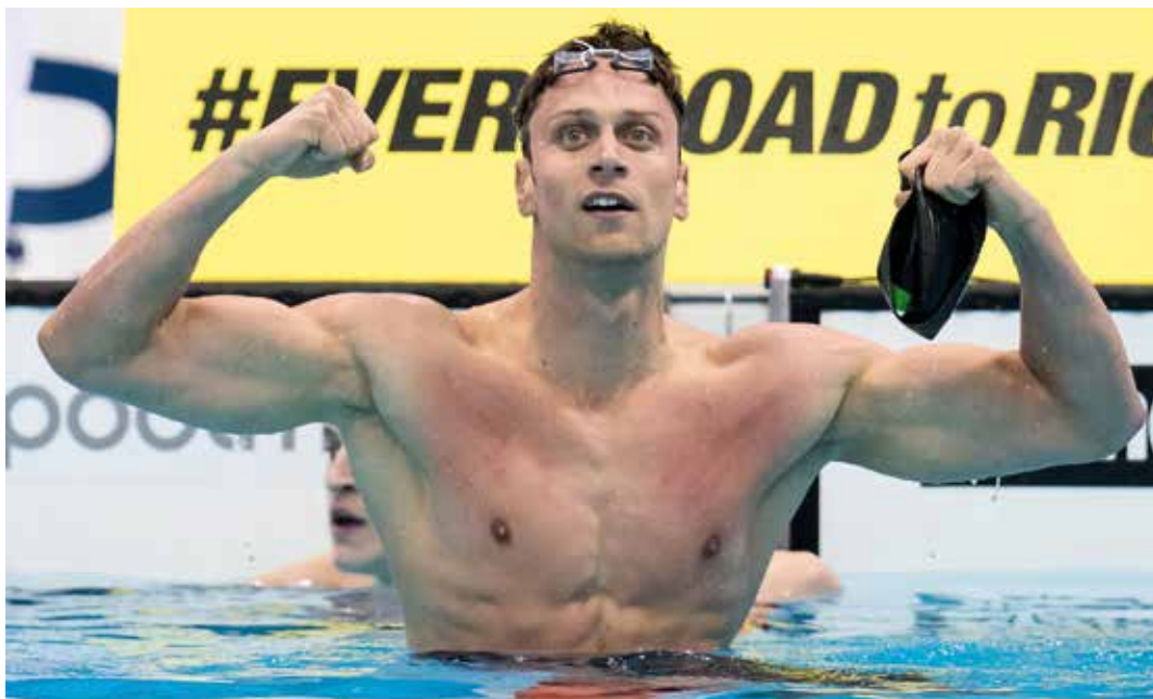
Luca Dotto, Italy, winner of the gold medal in the men's 100m freestyle at the European Championships in London in 2016