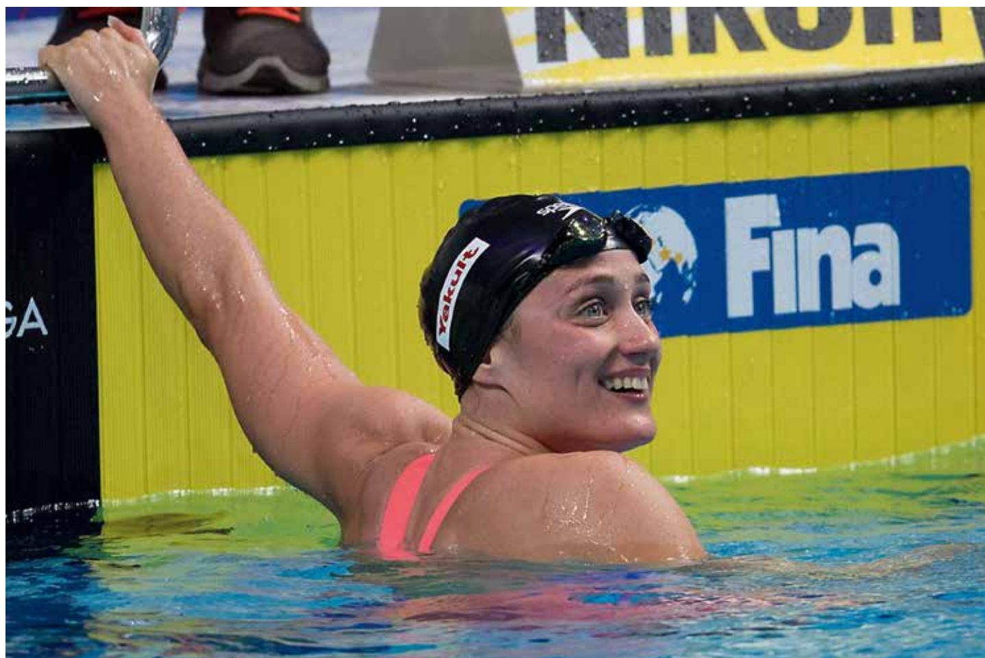
Mireia Belmonte Garcia, Spain, winner of the women's 200m butterfly at the 2014 European Championships. In London in 2016, she won a bronze medal in the 400m freestyle and a silver in the 1500m freestyle