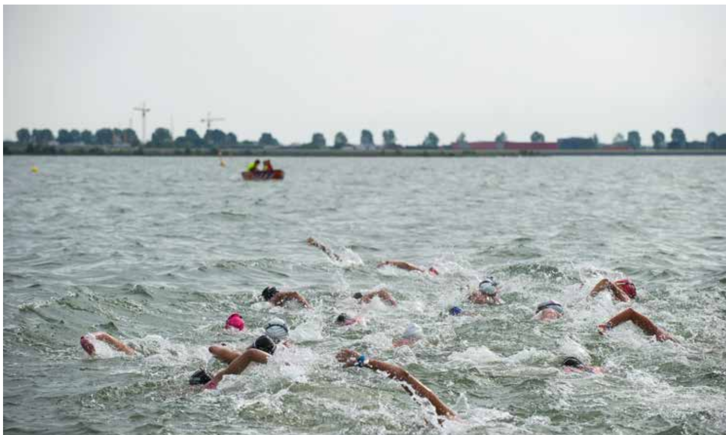
General scene from the women's 10k open water race in the European Championships in 2016 in Horn, Netherlands