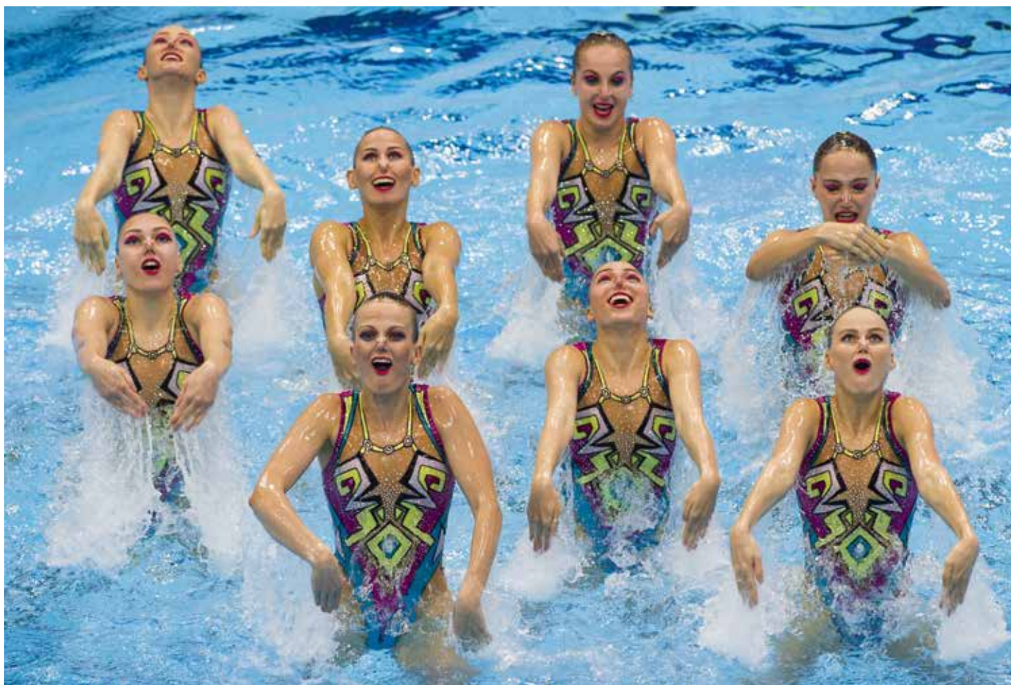
The Russian team taking part in the Women's Team Artistic (Synchronised) Swimming Championship at the London Aquatic Centre in 2016. The team won the team technical discipline