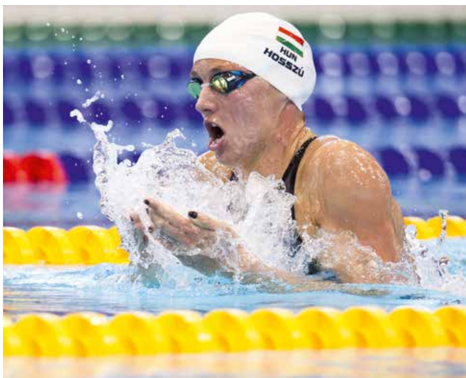
Katinka Hosszu, Hungary, winner of the women's 400m individual medley for the fourth consecutive championships in 2016