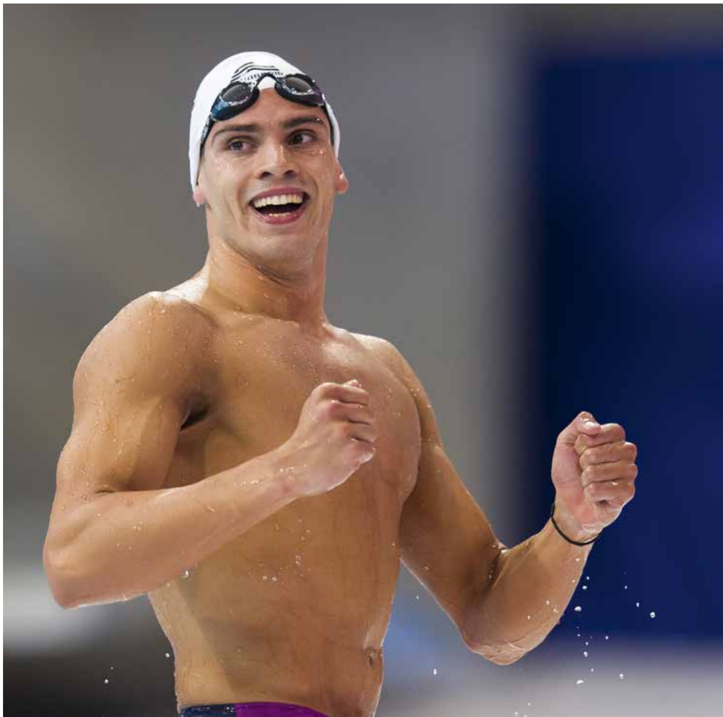
Andreas Vazaios, Greece, won his first European title, the men's 200m individual medley in 1:58.18 at the London European Championships