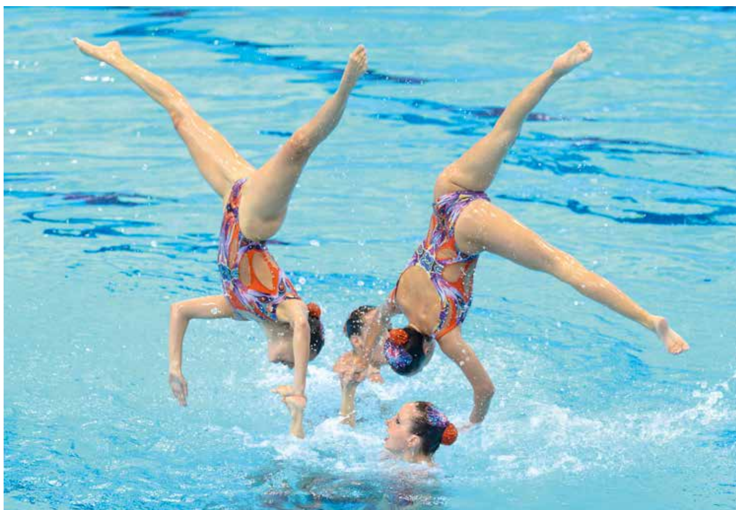
The Spanish team in action in the Artistic (Synchronised) Swimming at the 2016 European Championships. Spain took the bronze medal in the team free event