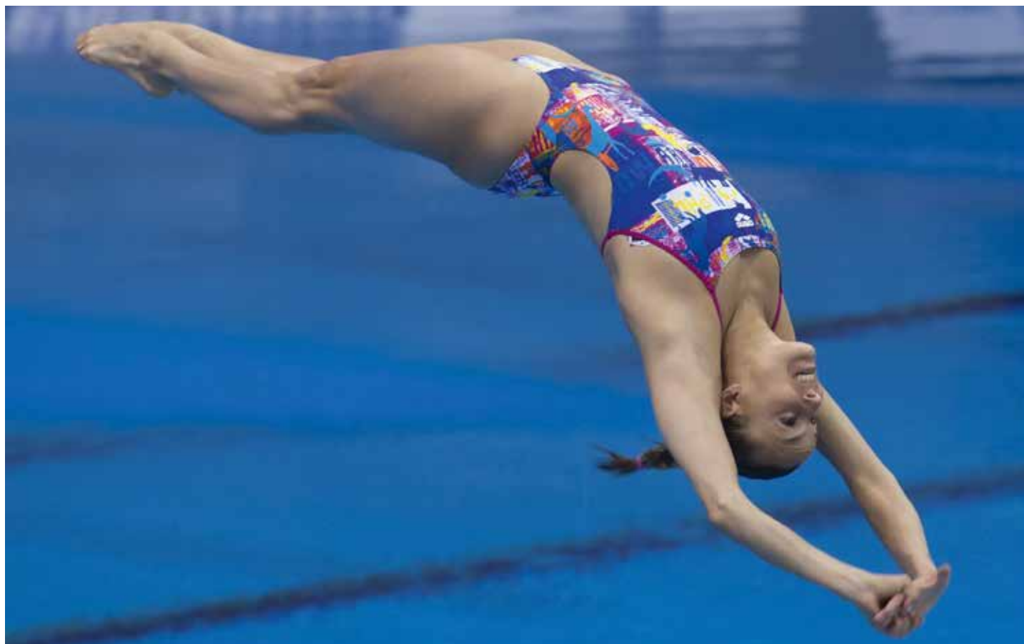
Tania Cagnotto, Italy, 1m and 3m European springboard diving champion in 2016