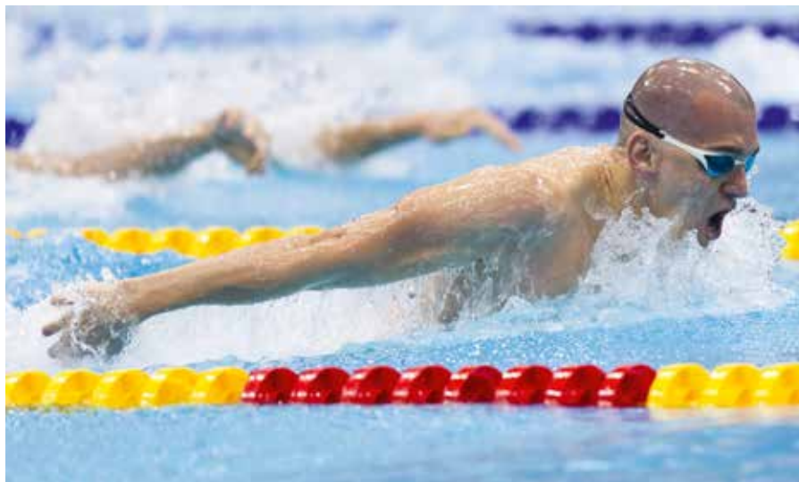
With 14 European gold medals and 4 silvers, Laszlo Cseh, Hungary, is the most successful swimmer in European Championship history