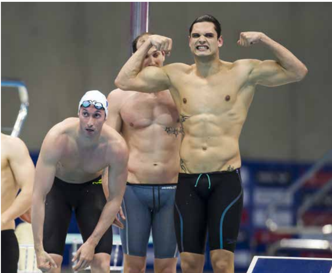
France is on its way to victory in the men's 4 x 100m freestyle relay at the 2016 European Championships in London. This was France's third successive win