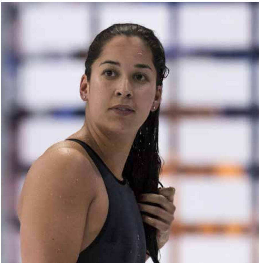
Ranomi Kromowidjojo, Netherlands, who won the women's 50m freestyle in 24.07 at the European Championships in 2016 in London