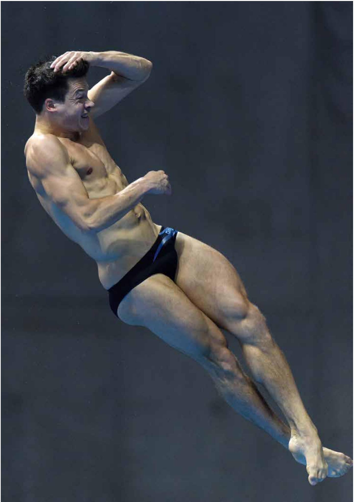
Patrick Hausding, Germany, has won the second highest number of European diving medals all-time