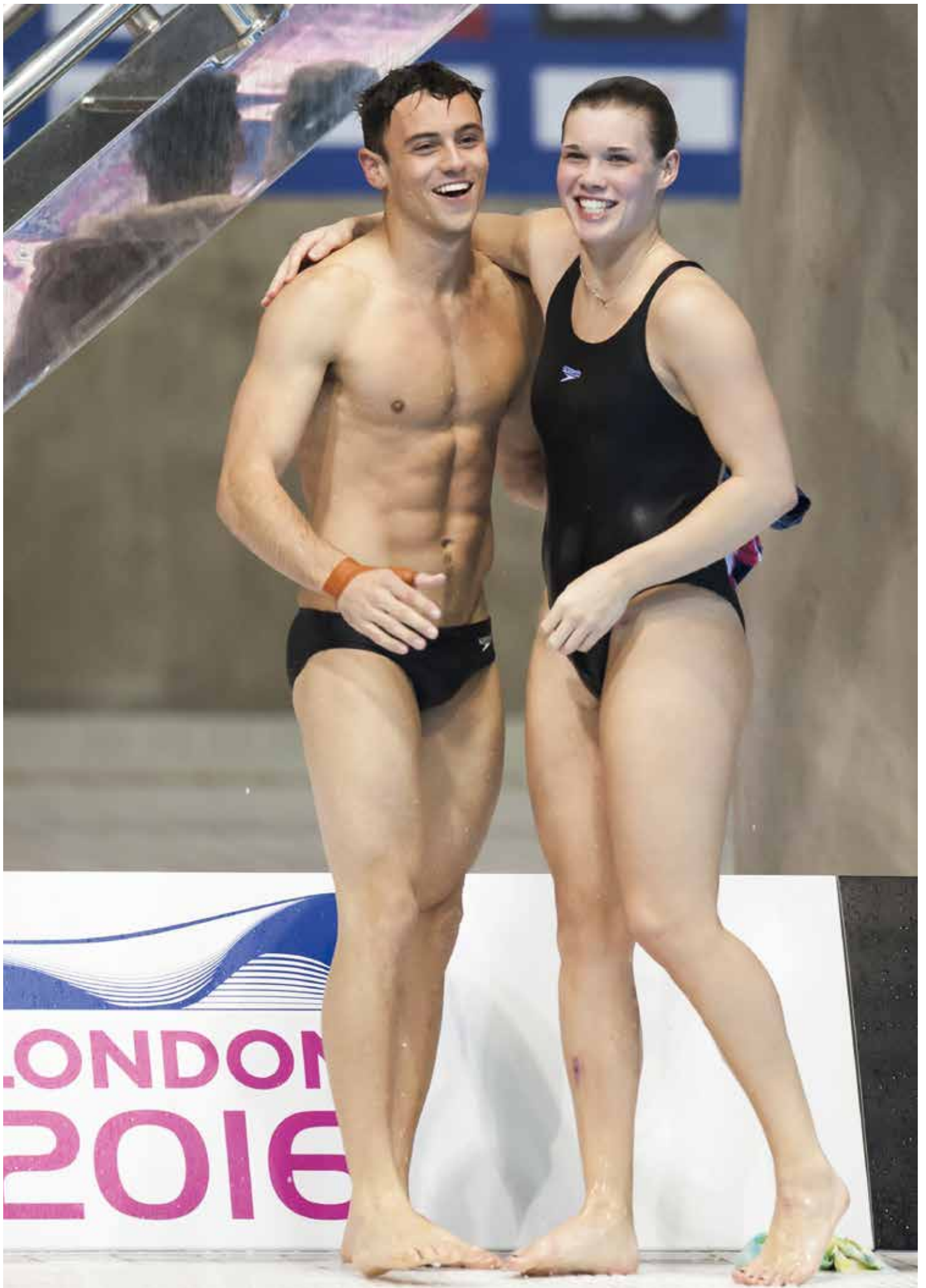
Tom Daley and Grace Reid, gold medalists in the 2016 European 3m springboard synchro mixed diving Championship