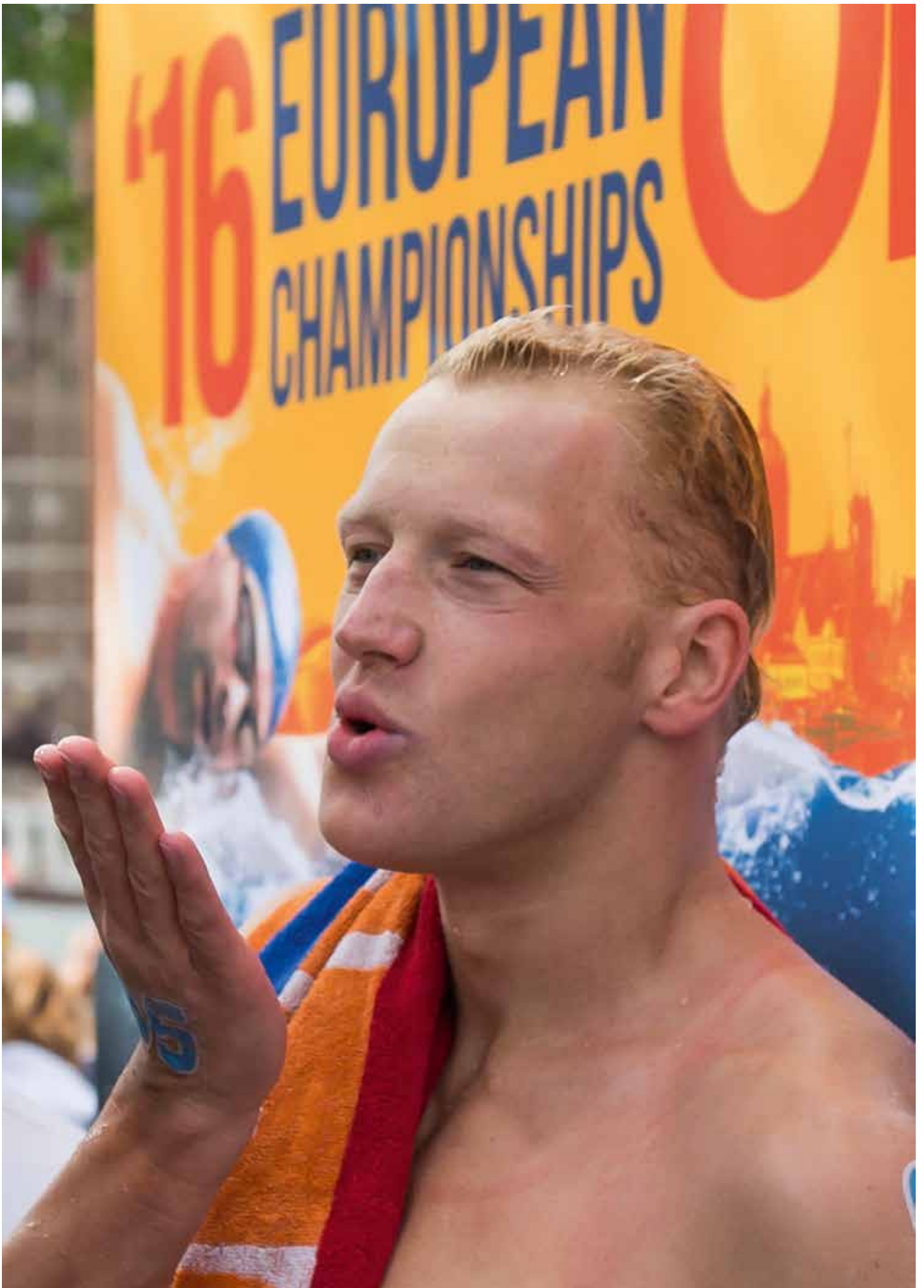
Ferry Weertman, Netherlands, gold medallist in the men's 10k open water in the 2014 and 2016 European Championships