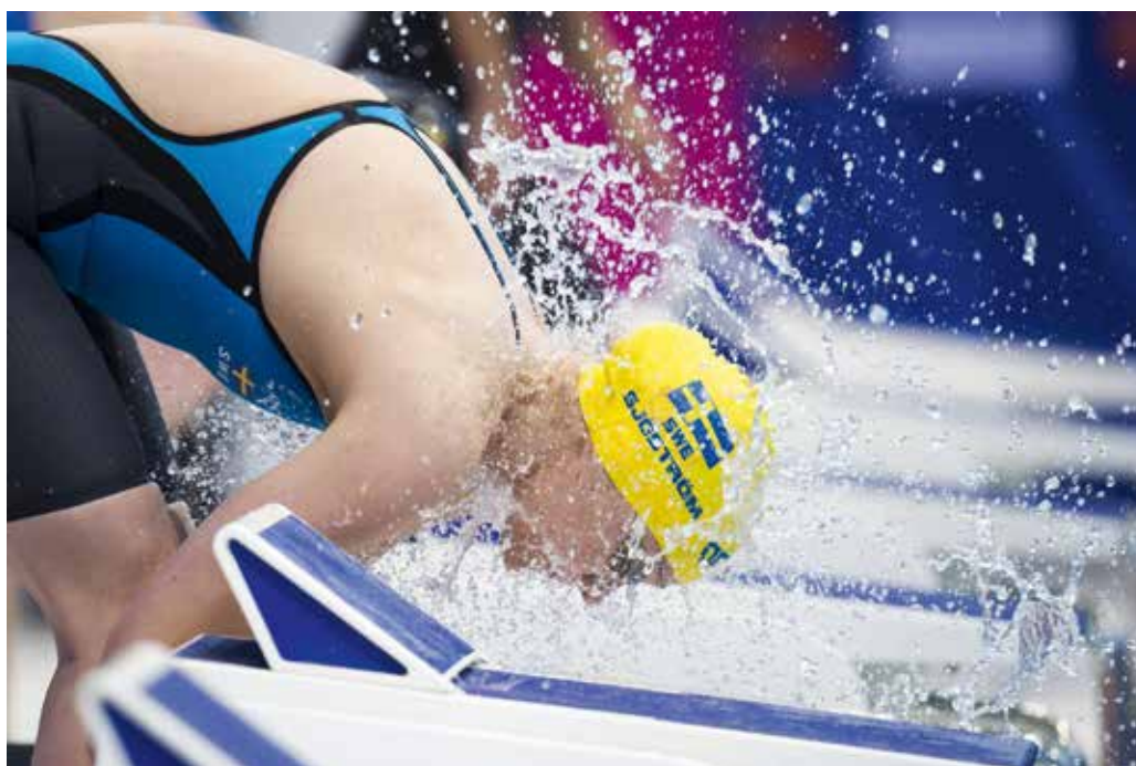
Three gold medals in 2016 went to Sarah Sjöestroem (Sweden), the women's 50 and 100m butterfly and the 100m freestyle