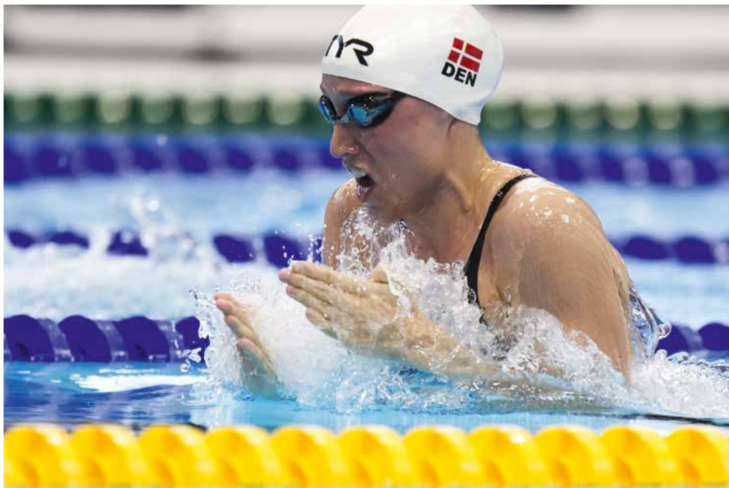
Rikke Moeller Pedersen, Denmark, gold medallist in the 2014 and 2016 European Championships in the women's 200 breaststroke and in 2014 in the 100m breaststroke