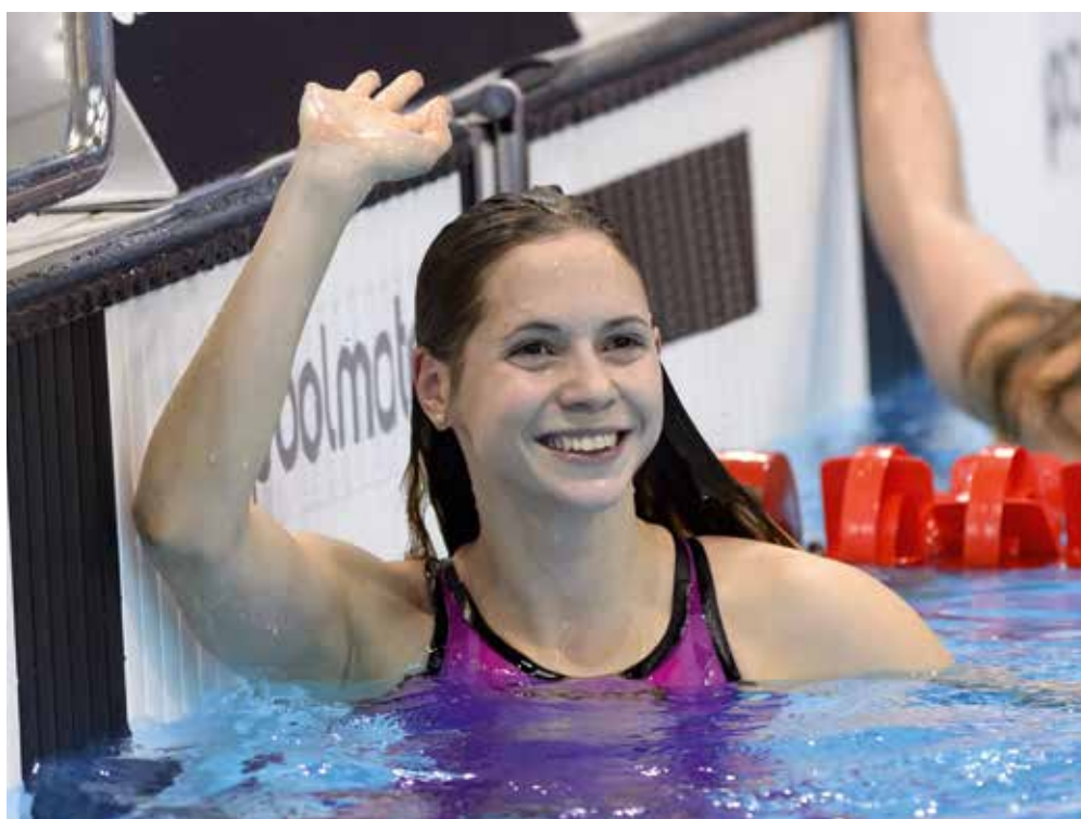
After being amongst the medals in 2012 and 2014, Borlarka Kapas, Hungary, went one better in winning the 400, 800 and 1500m titles in one sweep in London