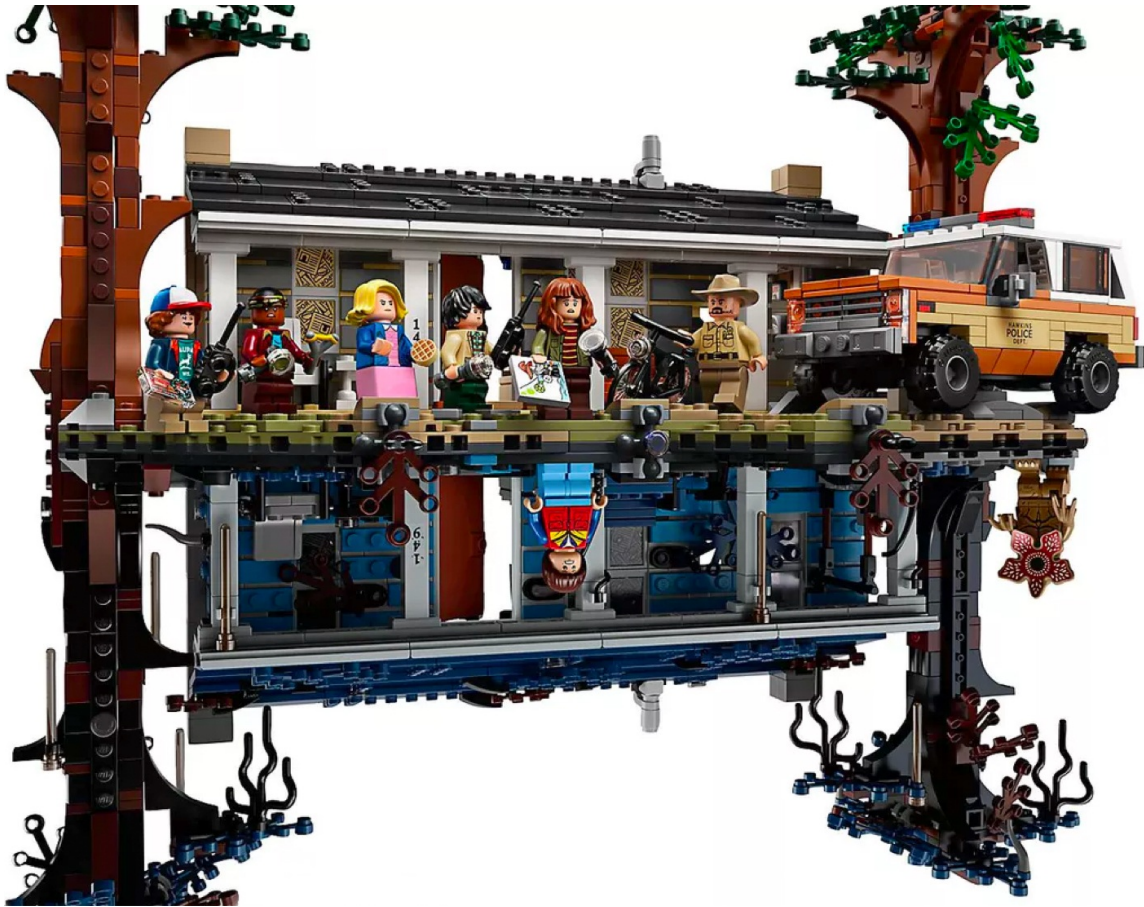
¶ The Unreal: What does your reality look like? (LEGO's "The Upside Down" from the Netflix show "Stranger Things.")

Throughout QAnon is the idea of discovering that our consensus reality is fraudulent, that a darker but truer reality lurks beneath the surface for those brave enough to look for it. QAnons talk about "red pills" and "blue pills," adopting the terms from everyone's favorite mashup of Keanu Reeves and Plato's Cave, the 1999 film The Matrix . In the film, Reeves's character is offered a red pill, which will reveal to him the true and horrifying nature of reality, or a blue pill, which will allow him to remain in happy delusion. For QAnons who've taken the red pill, the world of MSM is unreal, designed to deceive and prevent us from seeing the truth. For those who don't take the pill, those in QAnon are simply delusional, incapable of being reached, and residing in an unreality we have no way of influencing or affecting.