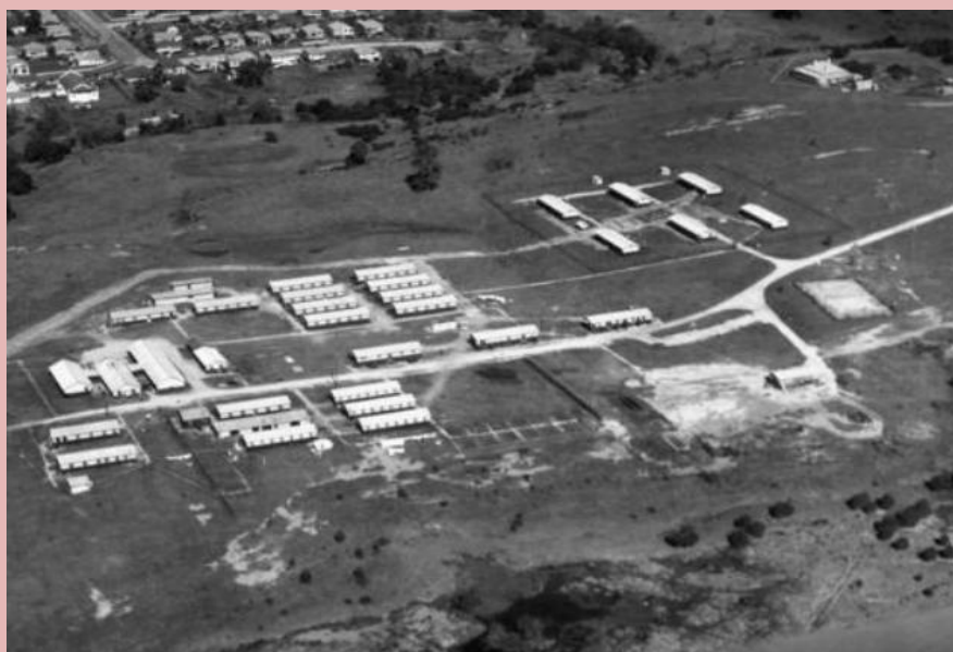
Australian Special Wireless Group, Camp Kalinga (ca. 1943-1945).

Another prominent community space in Kalinga is Melrose Park, which has been used for many purposes, including sports events, since at least the 1914. The park is known to have been a prominent venue for the Brisbane Lacrosse competition at that time. A bowling green and club was established in the north-east corner of Melrose Park in 1945.