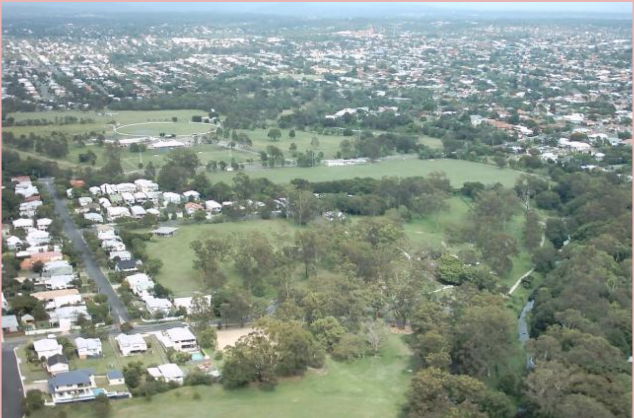
Parts of Kalinga Park (foreground), Shaw Park and Mercer Park (background) looking west from the Clayfield and Toombul end.