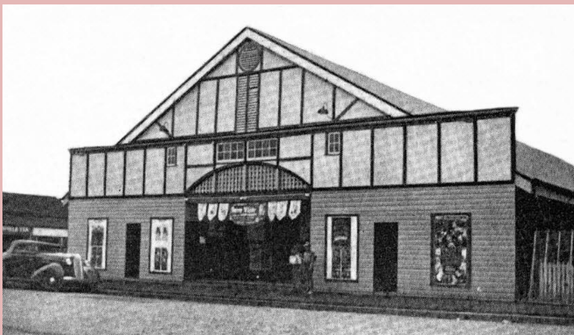
Star Theatre, ca. 1937

An open-air picture theatre likely operated in Kalinga from at least September 1920. The earliest reference found to date is in an electoral advertisement published on 4 October that year. Initially known as the Kalinga Picture Palace (aka Kalinga Pictures) it was renamed the Star Theatre sometime between late-1925 and early-1926, and from 1929 was fully enclosed. Because its patrons mostly comprised locals, films were not always screened every night of the week and hence the venue was often utilised by community groups and nearby schools. The extent to which the venue presented live entertainment is currently unknown due very limited programme advertising in the metropolitan newspapers. The building, which reportedly seated between 400 and 500 people, was destroyed by fire in the early 1960s and replaced by a service station.