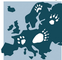
IUCN/SSC Specialist Group