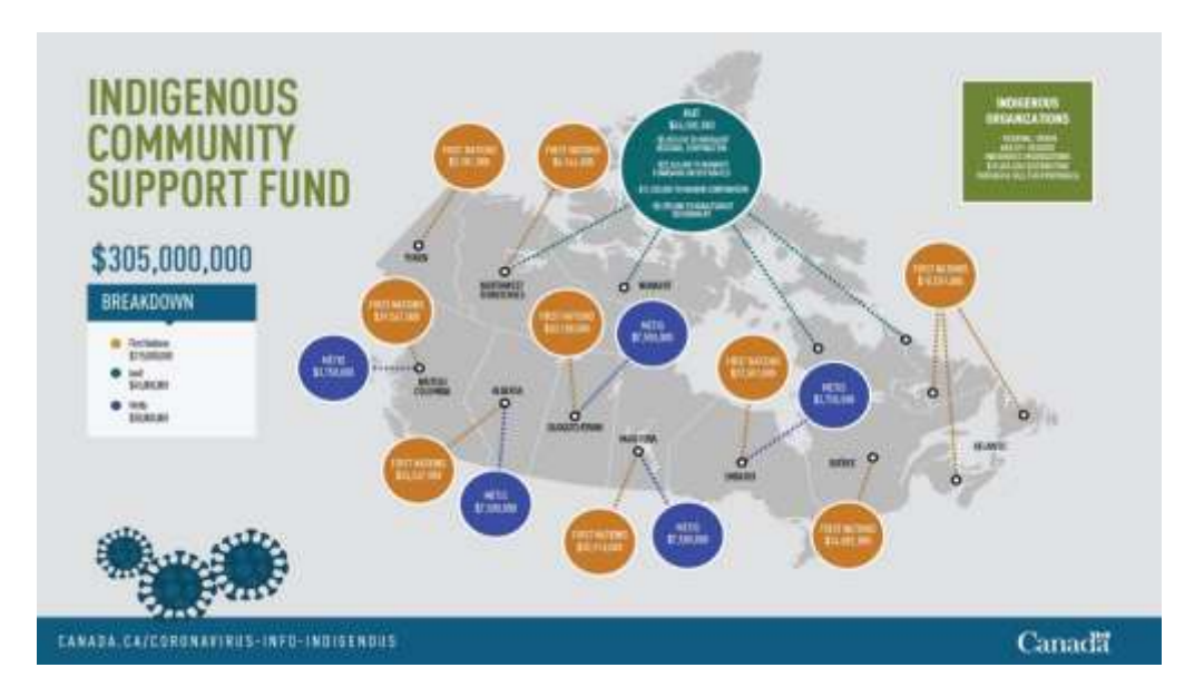
Figure 2: Indigenous Community Support Fund Map

Despite the fact that Indigenous communities were more at risk to the effects of the pandemic, out of the $82 billion support initially announced by the government, only 0.003% of it was earmarked for Indigenous peoples.<sup>39</sup> It is for these reasons and more that it is imperative that First Nations governments and community leaders are included in pandemic response planning as the country shifts into planning for widespread re-opening and the response to the second wave of the virus.