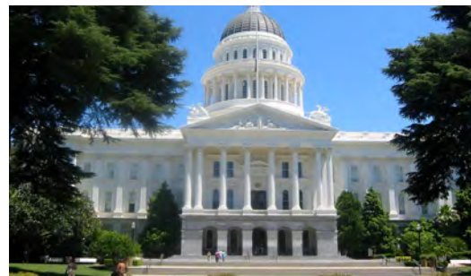
California State Capitol Building, Sacramento, CA