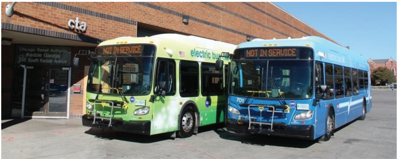
Chicago's first all-electric buses.