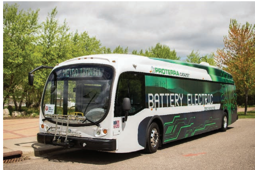
A Minneapolis St. Paul Metro Transit electric bus.