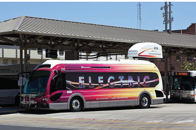
An all-electric Proterra BE35 bus operated by San Joaquin Regional Transit District (RTD), California next to its "Fast Charging" station.

Government funding and other incentives can make electric buses even more affordable. For instance, California's Hybrid and Zero-Emission Truck and Bus Voucher Incentive Project (HVIP) currently offers up to $235,000 for electric school buses sold in the state. 56 A 2016 analysis comparing