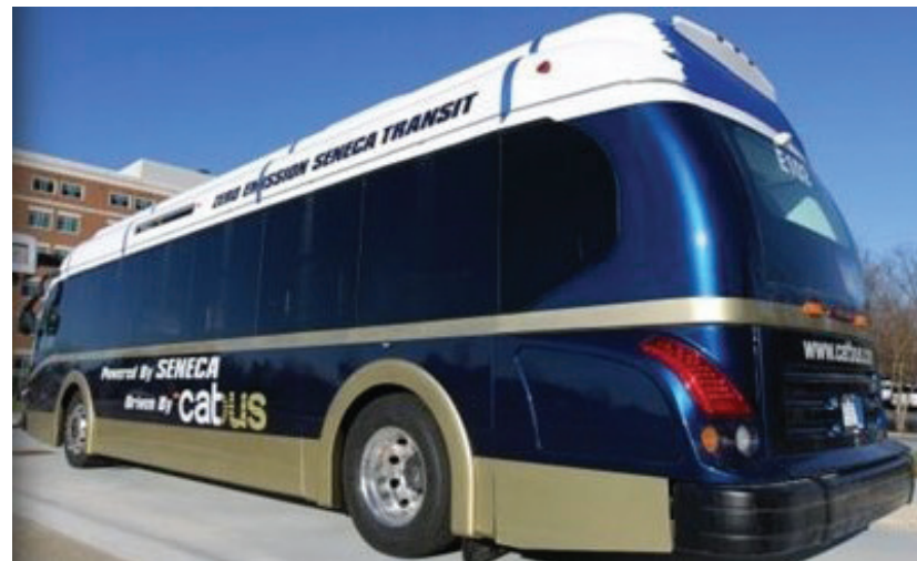
A CAT electric bus.

In 2010, the City of Seneca partnered with CAT, the Center for Transportation and Environment (CTE) and the South Carolina Department of Transportation (SCDOT) to apply for a federal grant from the Low or No Emission Program to develop the first scalable model of an all-electric bus transit system in the U.S. In contrast to other cities, which had to that point only deployed one or two electric buses as “parade buses” in their fleets, Seneca intended from the start to convert the entire operation to all-electric