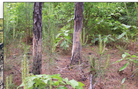
In just a few nights, feral swine can decimate lawns, native habitats, and pasturelands. Common feral swine damage includes wallowing, tree rubbing, and rooting.