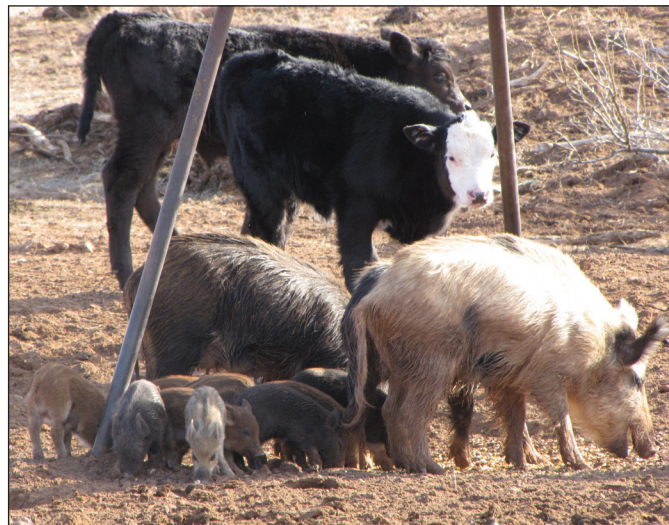
Feral swine often forage alongside livestock and eat grains, mineral blocks, and other items intended for cattle. APHIS animal health experts are concerned that such close contact can result in the transmission of disease from feral swine to livestock and people.