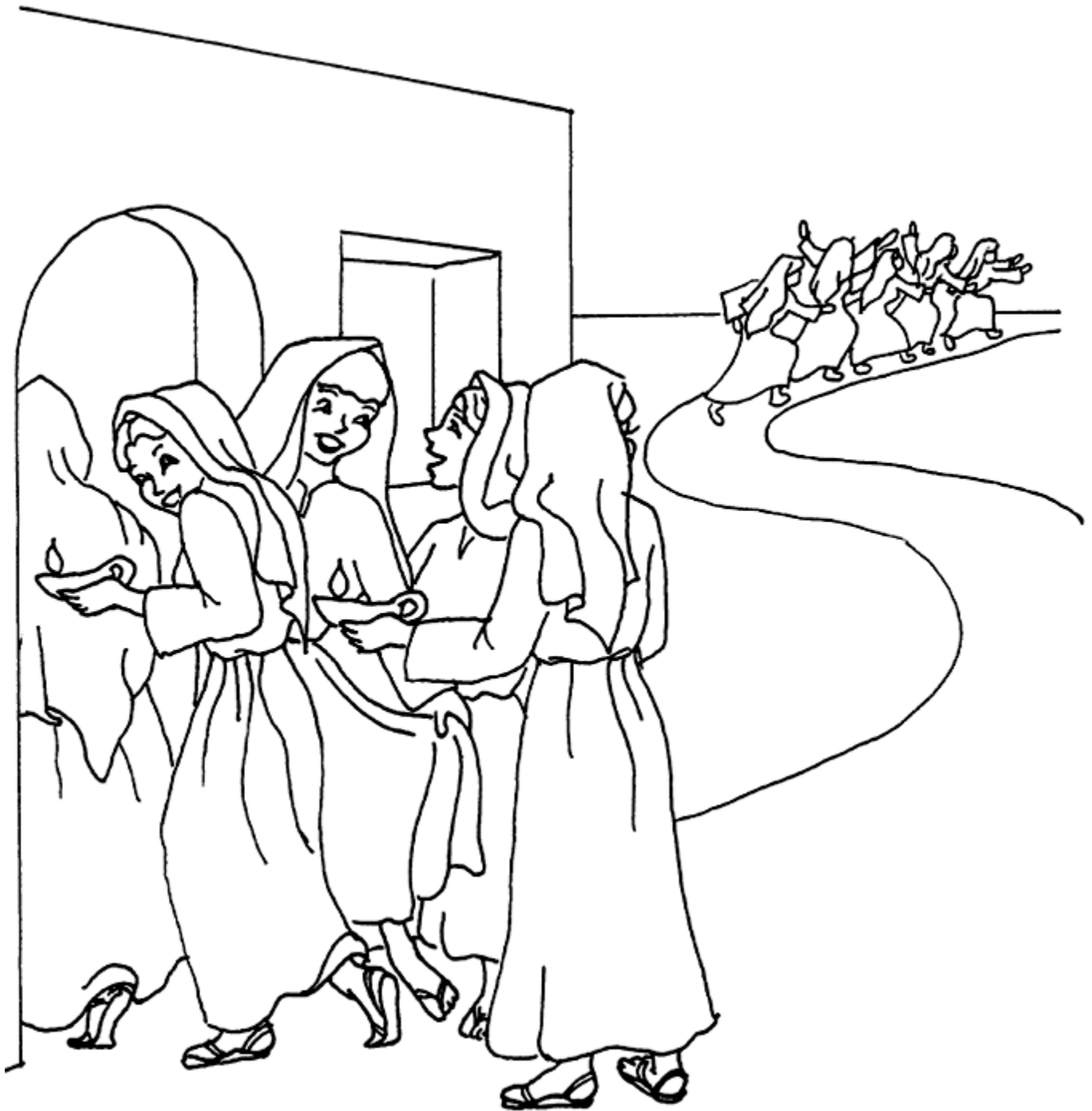
The Parable of the Ten Bridesmaids Matthew 25:1-13