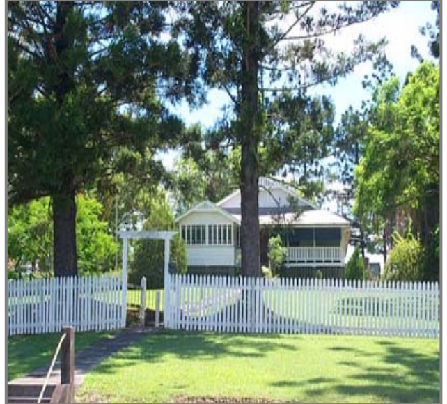
Photo sourced from Mark Baker Town Planning Consultants Pty Ltd in association with Ivan Mc Donald Architects