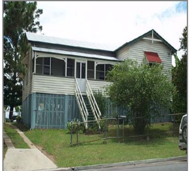
Photo sourced from Mark Baker Town Planning Consultants Pty Ltd in association with Ivan Mc Donald Architects