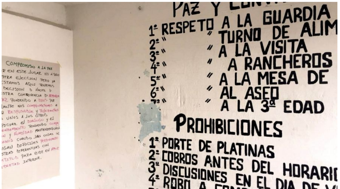
Prison inmates at El Bosque penitentiary in Barranquilla, Colombia, have hung their written commitments to peace and co-existence on the walls, after participating in workshops on conflict resolution following Colombia's 2016 peace treaty. Image by Adriana Cómbita. Colombia, 2018.

If a former fighter, for example, doesn't confess right away, he or she will receive a punishment that includes a jail sentence between five and eight years, plus community service. Only those who refuse to admit to their role in a crime face straight prison time of up to 20 years.