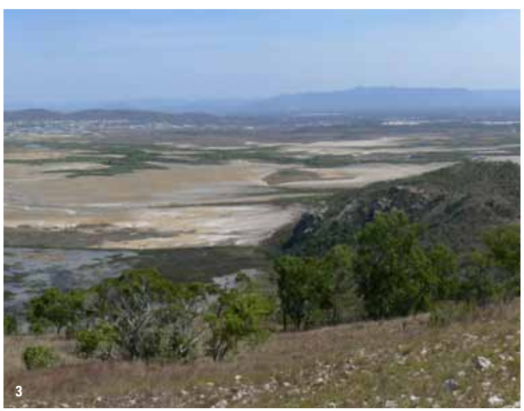
1 The greater Town Common is well connected. 2 Castle Hill and Mt Stuart from Many Peaks Range. 3 Mt Louisa and Bohle River catchments from Many Peaks Range.