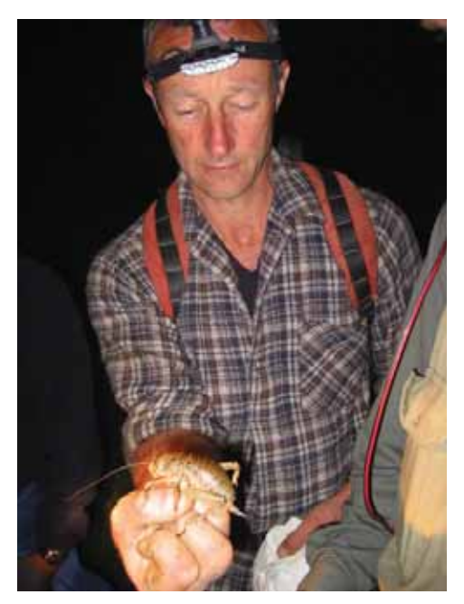
Fig. 6: Cook Strait giant weta

In October 2003, 42 giant weta were moved from Takapourewa to