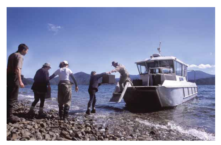
Fig. 3: South Island tits being taken from Blumine Island for release on Maud.

While tits have occasionally been seen on Maud they have not established. In 2004 three males and three females were transferred from Blumine and released directly into the main forest. While one bird was seen six months later and another (unbanded) in early 2007 there is little reason to think this attempt has been successful.