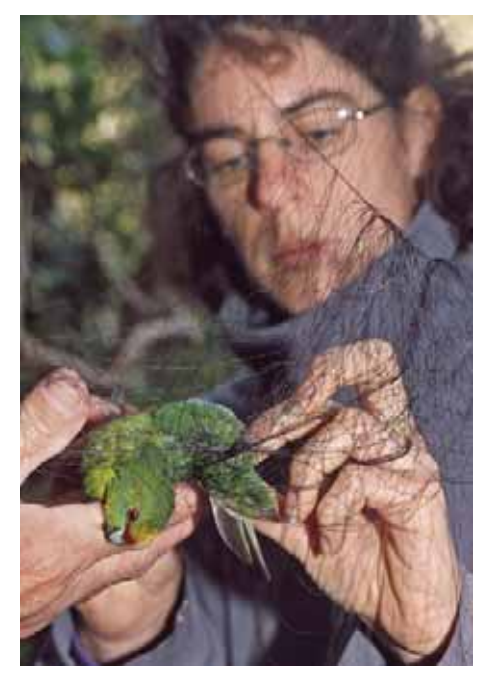
Fig. 2: A parakeet being removed from a mist net for translocation.