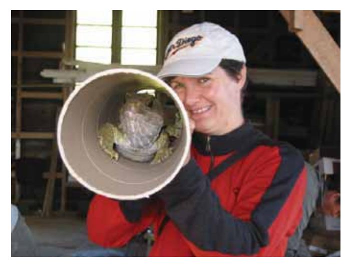
Fig. 5: A tuatara ready for transfer.

In October 1998 eggs were taken from Takapourewa for artificial incubation and research into how incubation temperature affects the sex of hatchlings (Nelson 2001). These were obtained from natural nests and by induction of gravid female tuatara. During the following years the