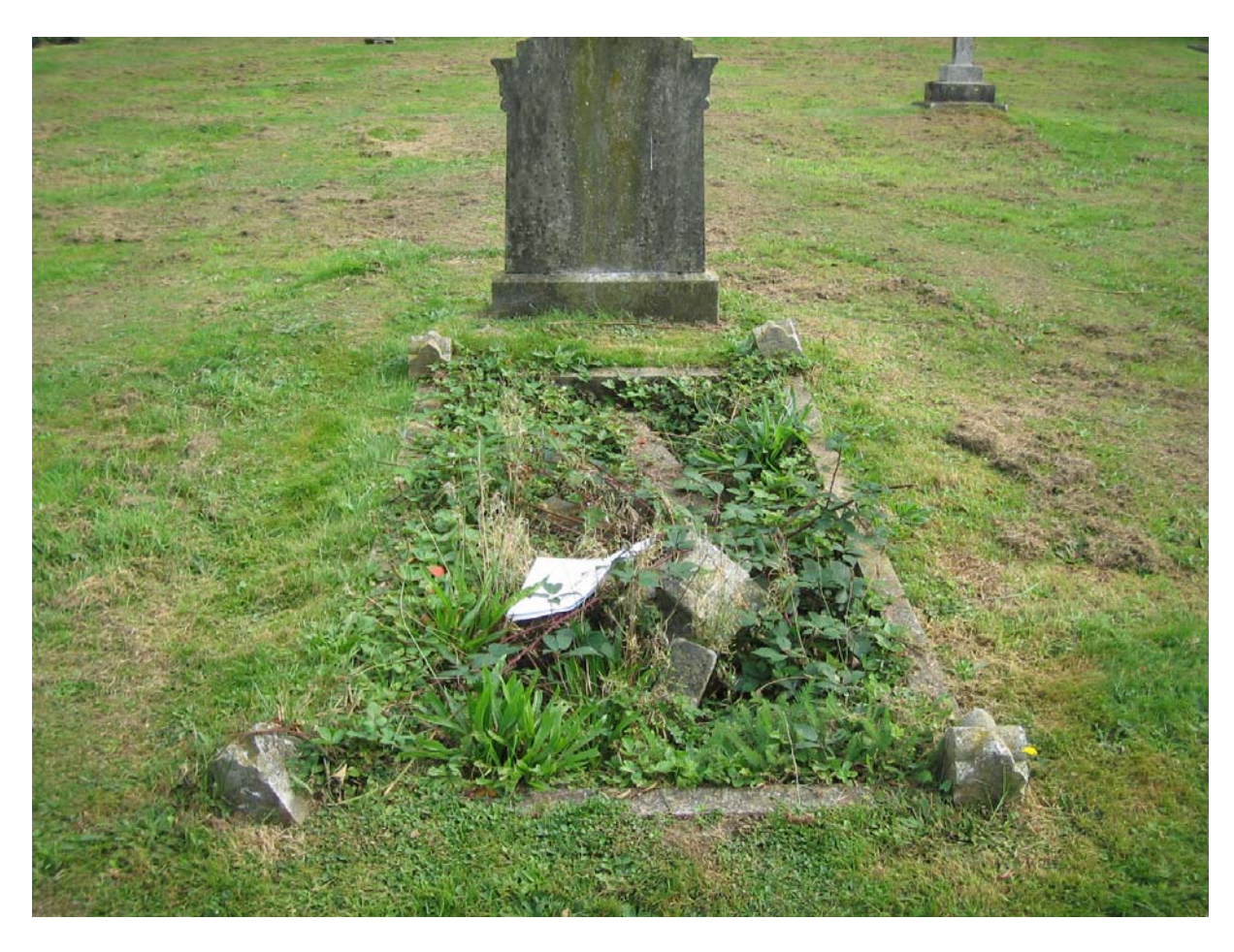
Herbert's Grave is now a disgrace