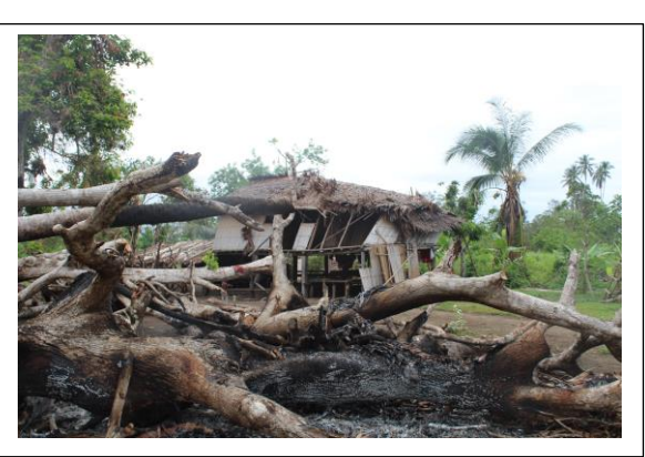
Above: Staff houses at Ufaufa Primary School destroyed by the strong winds