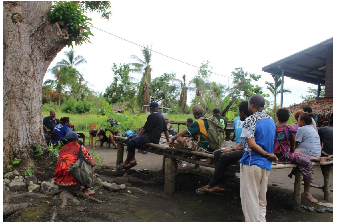
Above : Focus group discussion with the staff of Ufa'ufa Primary School, Aid Post and members of the community