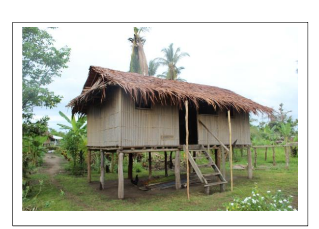
Below : Rebuilding of houses destroyed by the strong winds at Ufaufa Primary School