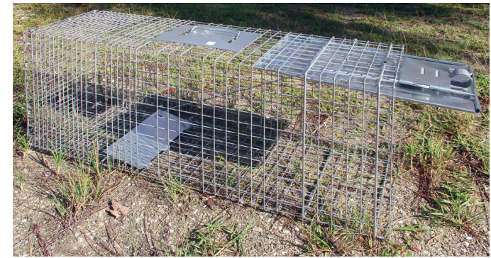
Open trap, FWC