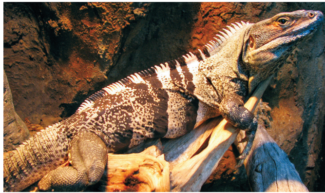
Black spinytail iguana