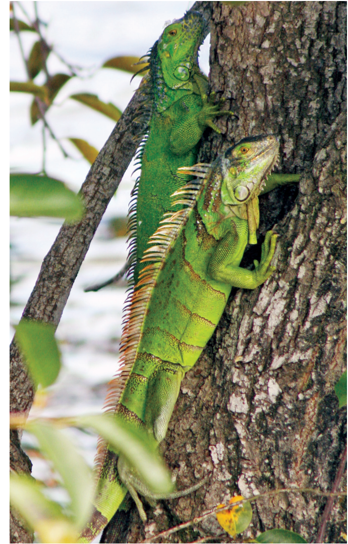
Green Iguanas, FWC

How You Can Help Stop the Spread of These Invasive Lizards