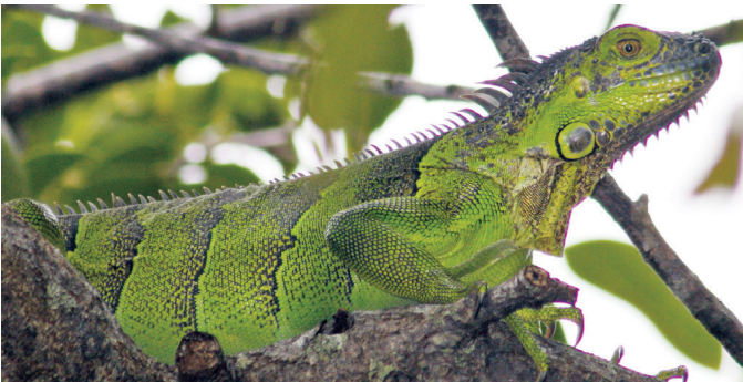
Young female green iguana, FWC

Three members of the iguana family are now established in South Florida and occasionally observed in other parts of Florida: the green iguana, the Mexican spinytail iguana, and the black spinytail iguana.