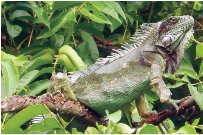
Male green iguana