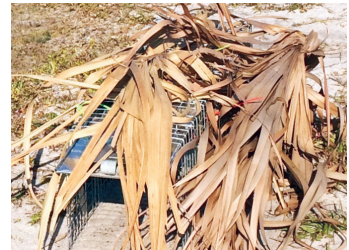
Covered trap, FWC