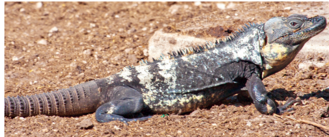
Mexican spinytail iguana

If you have further questions or need more help, call your regional Florida Fish and Wildlife Conservation Commission office: