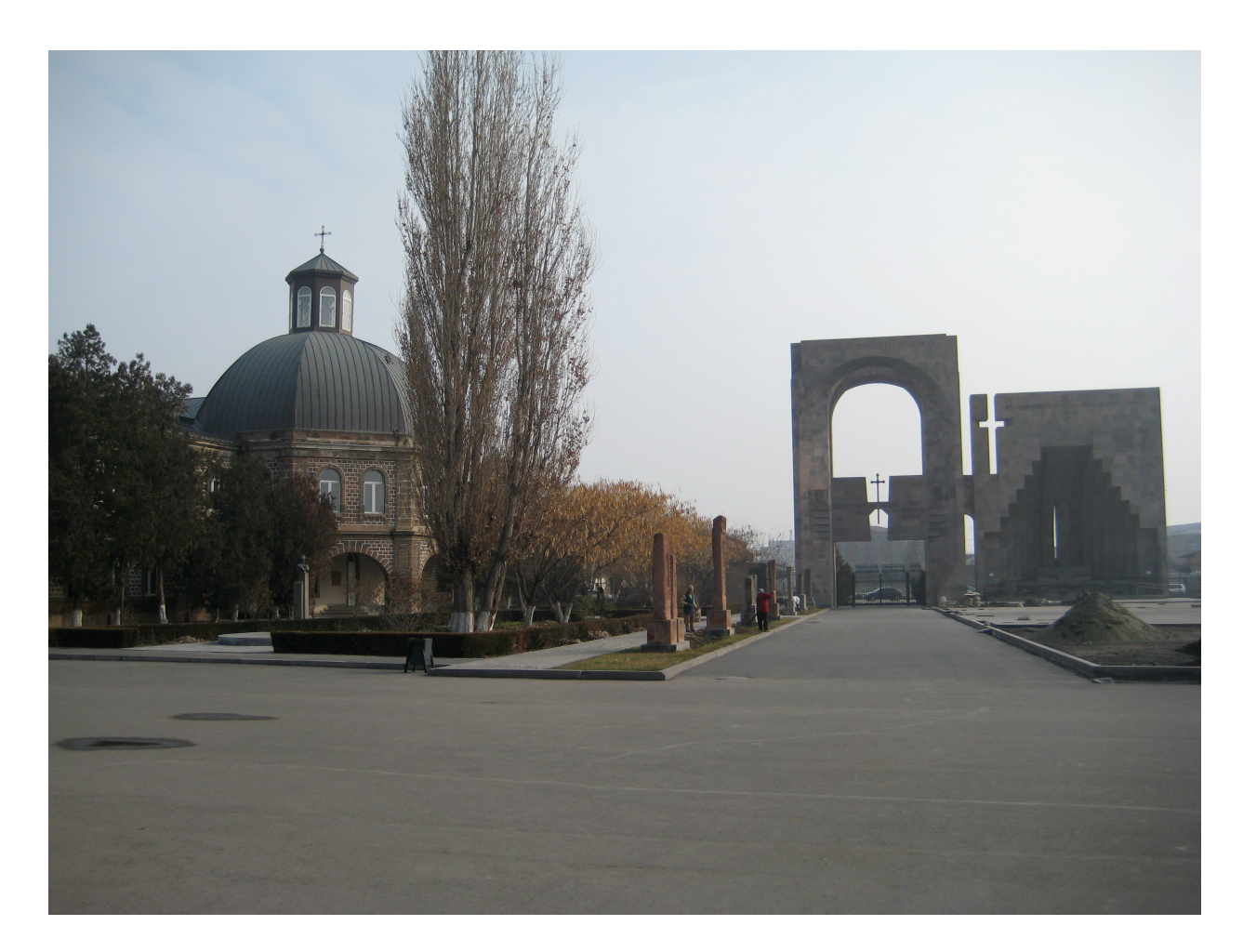
Figure 4. Echmiadzin in 2014.