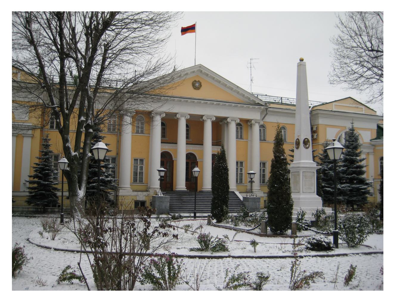
Figure 2. The original building of the Lazarev Institute of Oriental Languages. Today it houses the Armenian Embassy to Russia.