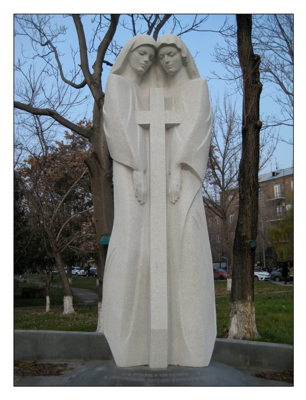
Figure 1. Monument to Russian-Armenian Friendship in Yerevan.