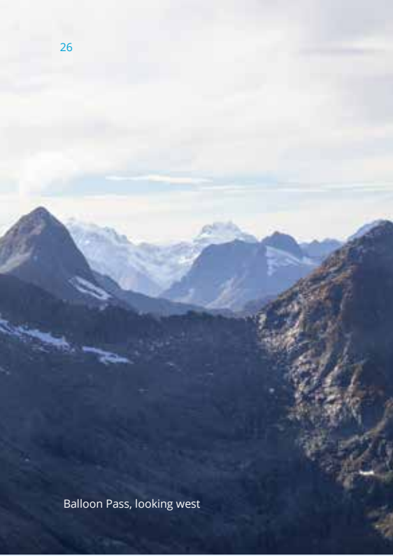
Balloon Pass, looking west