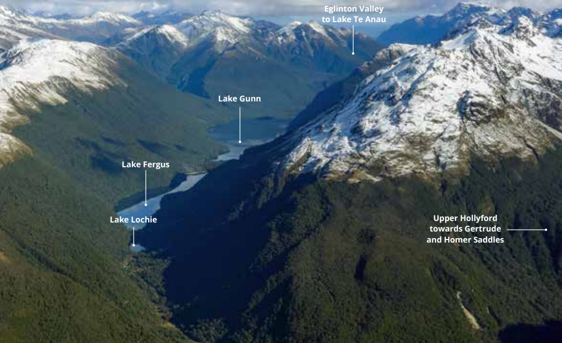
Photo taken at Hollyford, looking south