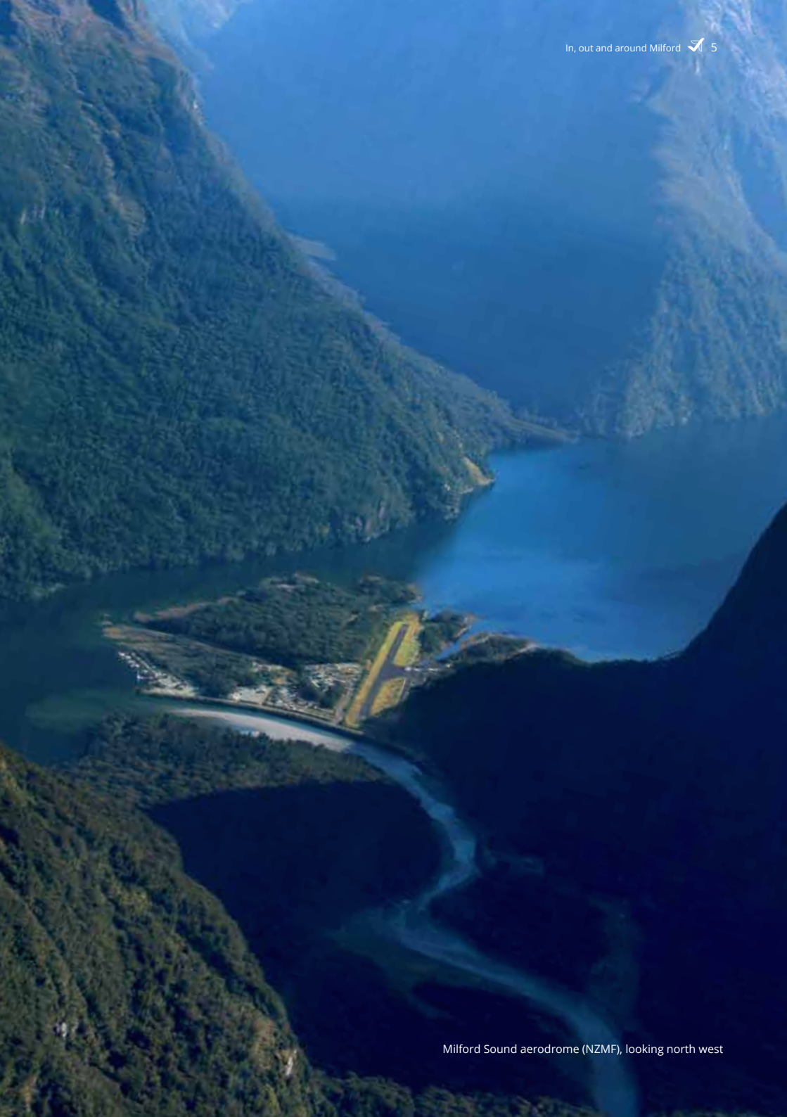
Milford Sound aerodrome (NZMF), looking north west