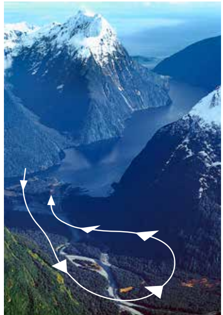
Milford Sound aerodrome, with the approach to Runway 29 depicted

Take-offs are normally made from Runway 29.