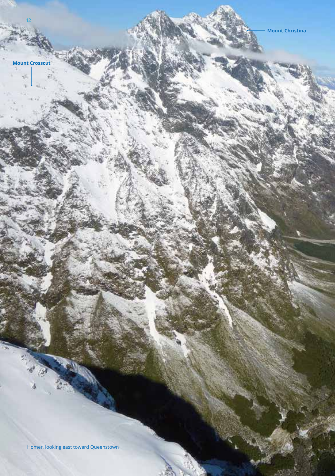
Homer, looking east toward Queenstown