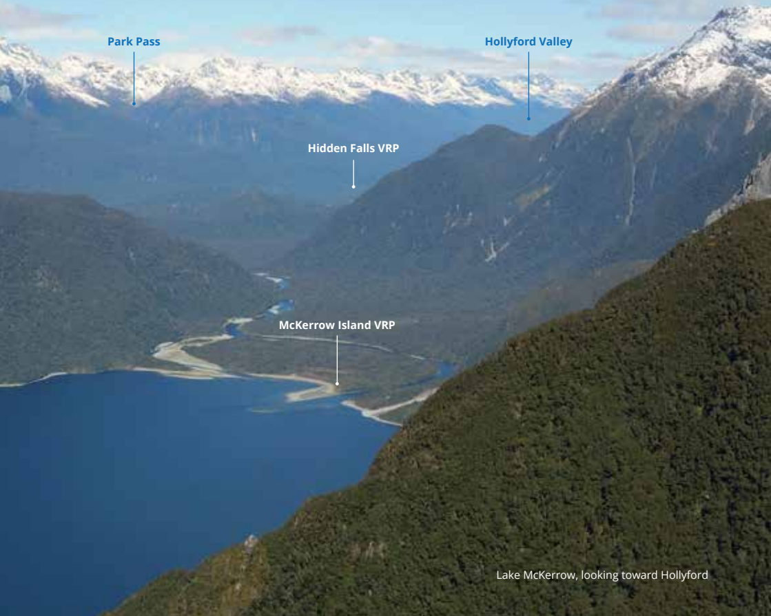
Lake McKerrow, looking toward Hollyford