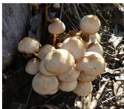
Fig. 1. Macrofungi from Black Mountain: Laetiporus portentosus on a Red Stringybark ( Eucalyptus macrorhyncha ) trunk (left), Mycena sp. in litter (right).