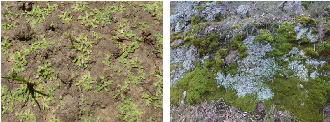
Fig. 3. Liverwort Riccia duplex var. megaspora (left) and mosses (bright green) growing on rock with lichens (right) on Black Mountain.