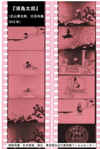
Postcard by the National Film Center, Tokyo, showing frames from Urashima Tarō .

Concerning Shimokawa's films, we have his own article from 1934 in which he states that he at first used chalk on blackboard, with those portions changing from picture to picture being wiped away and drawn anew. This method, however, was uncomfortable and couldn't be perfected, so he changed to paper animation, using three types of printed backgrounds on which he drew the characters freehand, whitening out any lines on the background that would interfere. For this technique he also constructed a kind of worktable, consisting of two boxes on which lay a glass plate illuminated from below by a strong light (Shimokawa[1934]).