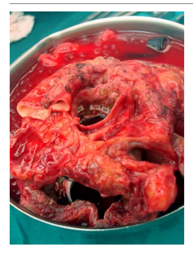
Figure 1. The aortic and mitral prostheses are already implanted.

the previously divided atria, and end-to-end anastomoses of the aorta, the pulmonary artery and the two cavae (Figure 2). Temporary epicardial pacing leads were placed. Total ischaemic time was 245 minutes, and the time on cardiopulmonary bypass was 335 mi-