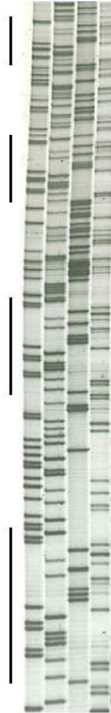
Fig. 1. Autoradiograph of an unpublished Sanger sequencing gel, dated 21/08/1992, where regularly spaced repeats were discovered in H. mediterranei . Repeats are marked with side bars.