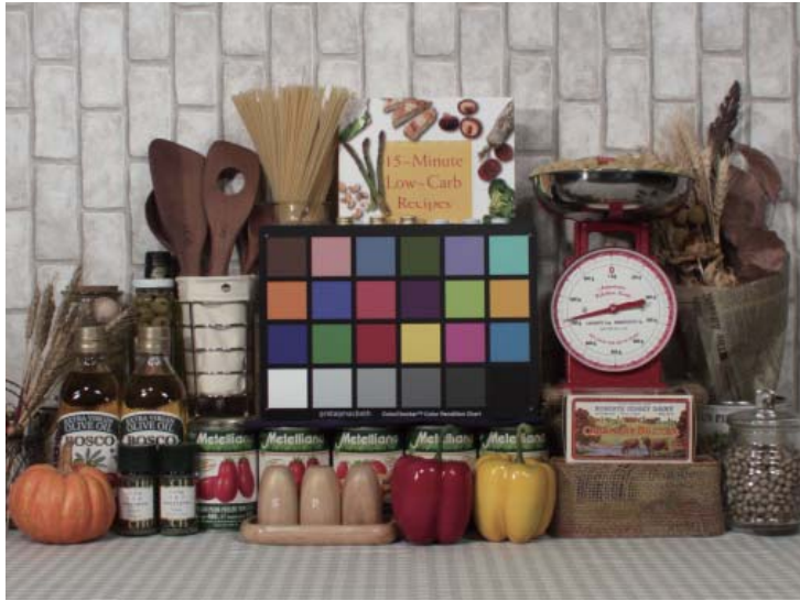
Photograph 1 Sample Image at 9.29M Pixels (ISO 100 equivalent)