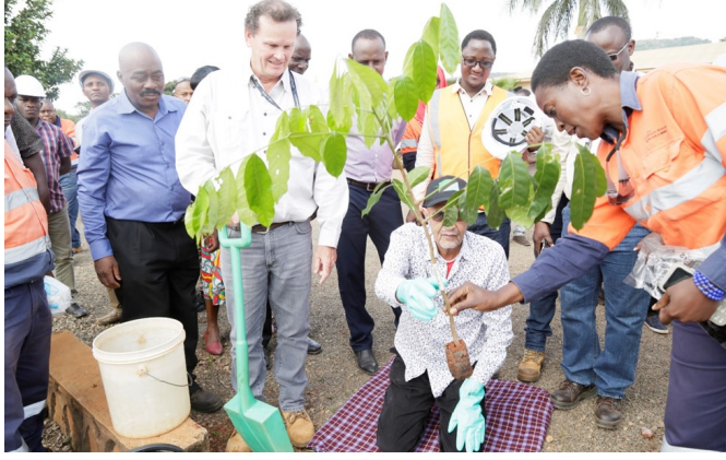
Minister of State in the Vice President's Office Hon Mussa Zungu (centre) plants a tree to promote environmental conservation

O n the 2 nd of March 2020, the newly appointed Minister of State in the Vice President's Office (Union and Environment) Honourable Mussa Zungu visited Geita Gold Mine on a familiarization tour.