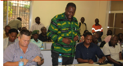
Geita District Commissioner Hon. Josephat Maganga (centre) giving remarks