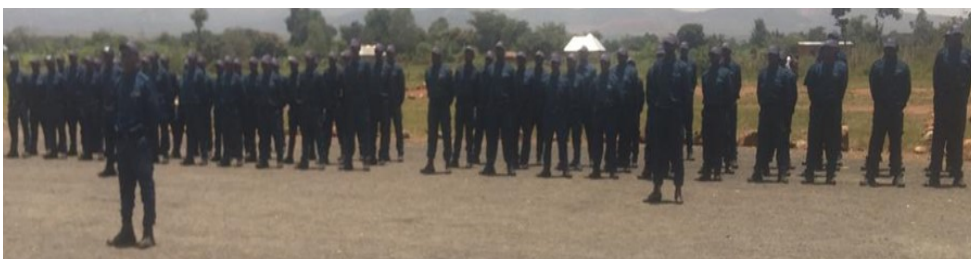
The Commissioner of Community Policing (not in picture) inspecting a parade for community policing members. He was very impressed with their military skills. He encouraged other youths to participate in community policing because they have a duty to protect their assets and security.