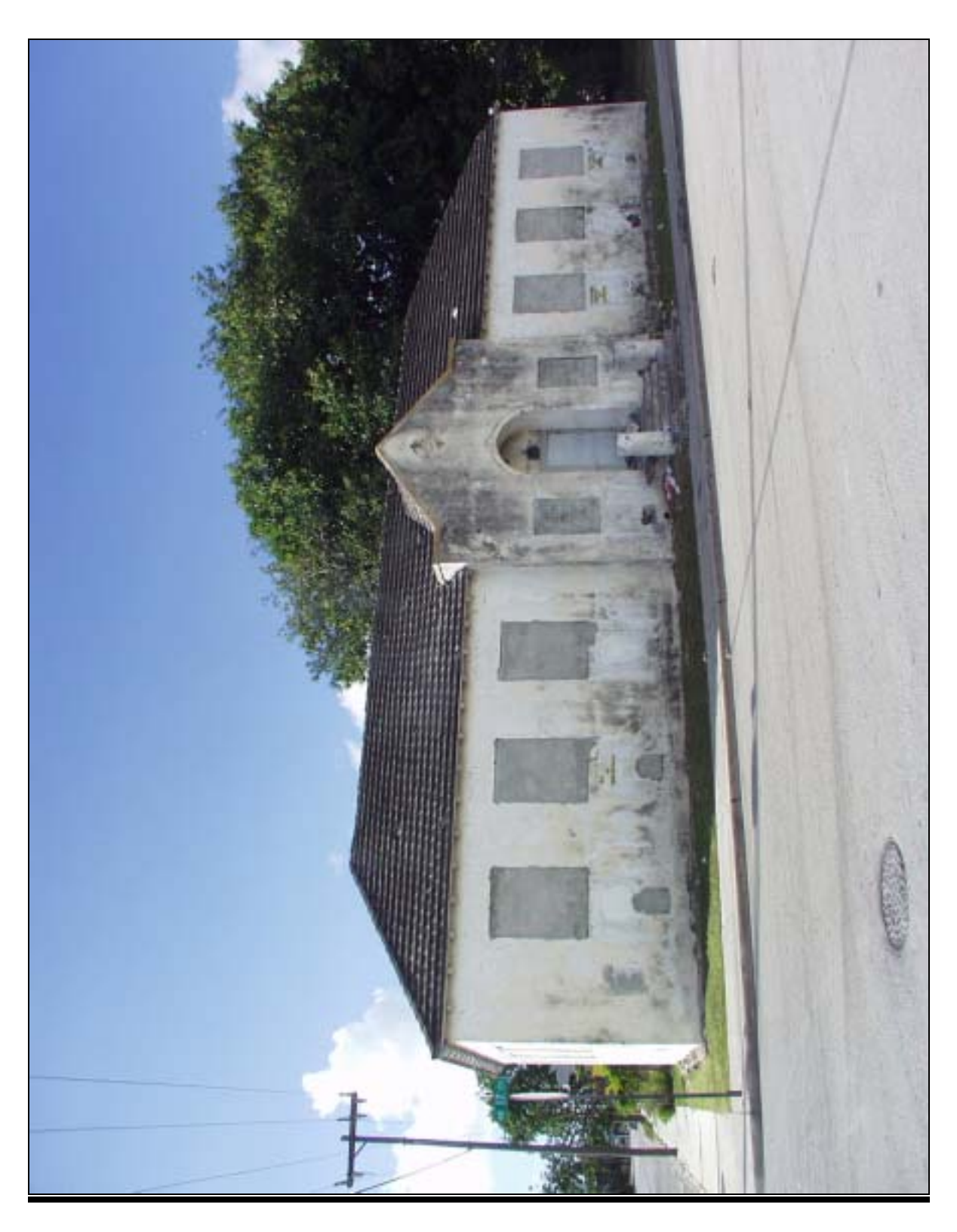
Dorsey Memorial Library 100 NW 17<sup>th</sup> Street North (front) and east façades 2002