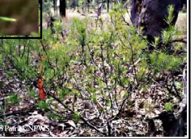
NATIONAL PARKS AND WILDLIFE SERVICE

P. pauciflora has an extremely restricted distribution. All known individuals occur within 2.5km of the original or "type" specimen, which was recorded near North Rothbury in the Cessnock Local Government Area. Within this