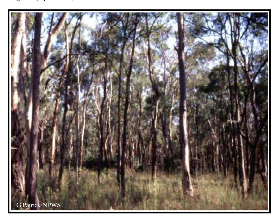
Persoonia pauciflora - habitat

A recovery plan has not been prepared for this species.