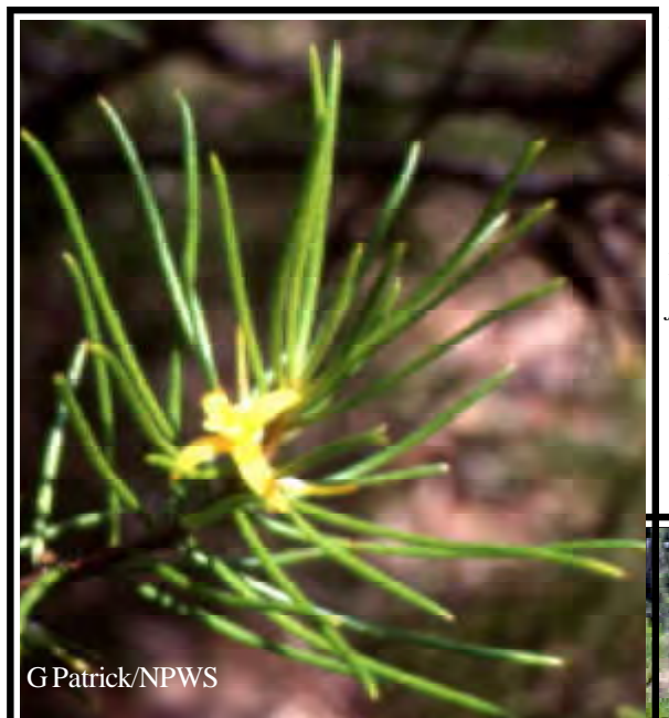
Persoonia pauciflora - flower

P. pauciflora occurs in dry open-forest or woodland habitats, generally with a projected foliage cover ranging between 10 to 40% and tree height range of between 6 to 18 metres. The lower strata usually comprises of a moderate to sparsely distributed shrub layer, with a high percentage of groundcover species, particularly grasses. Vegetation communities are dominated by Spotted Gum (Corymbia maculata), Broad-leaved Ironbark (Eucalyptus fibrosa), and/or Narrow-leaved Ironbark (E. crebra). Sub-dominant species include Grey Gum (E. punctata) and Grey Box (E. mollucana). Common understorey shrubs include Acacia parvipinnula,