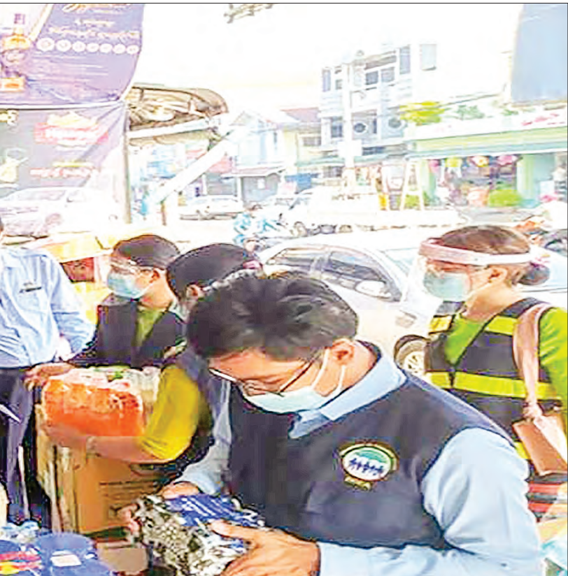
Officials from the Department of Consumer Affairs inspecting unsafe food in a market in Dawei.

carrying out personal and household goods services well understand if they sell quality products at reasonable prices regardless of their selfishness and greed, they would be able to defeat their opponents.