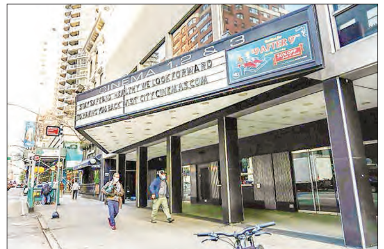
New York cinemas will be able to operate for the first time in almost a year when they reopen with limited capacity in March.

He said it wasn't clear that reopening would be profitable under the current pandemic conditions. Cuomo has been gradually easing restrictions in New York City in recent weeks