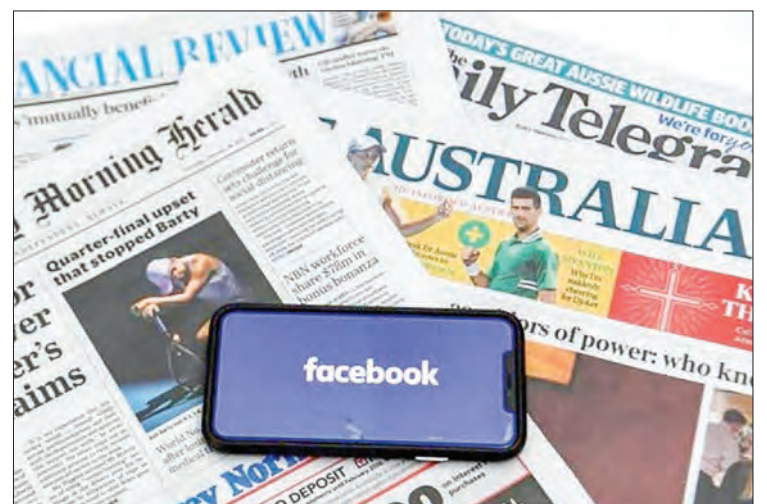
Facebook moved to lift a contentious ban on Australian news Tuesday, after a last-gasp deal on landmark rules requiring tech giants to pay media companies.

The social media firm sparked global outrage last week by blacking out news for its Australian users and inadvertently blocking a series of non-news Facebook pages linked to everything from cancer charities