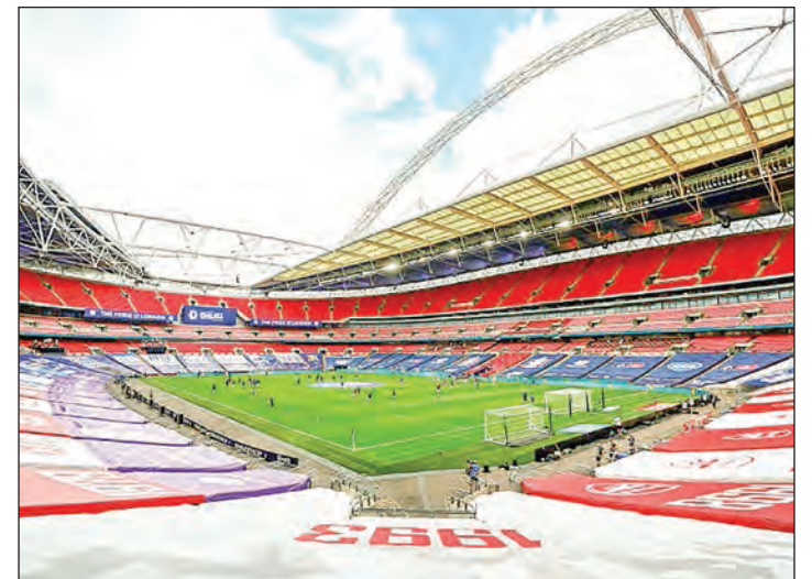
Wembley stadium is due to play host to the Euro 2020 semi-finals and final.

LONDON — Fans could be back in English stadiums for the final weekend of the Premier League season and there are hopes the Euro 2020 final will be played at a full Wembley under plans announced on Monday.