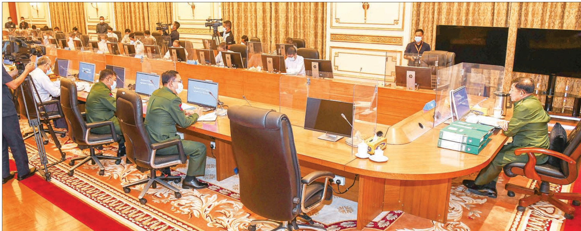
Chairman of the State Administration Council Senior General Min Aung Hlaing presides over the 1/2021 Economic Affairs Committee Meeting yesterday.

CHAIRMAN of the State Administration Council and Commander-in-Chief of Defence Services Senior General Min Aung Hlaing delivered a speech at the 1/2021 meeting of the Economic Affairs Committee yesterday.