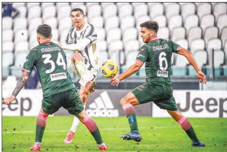
Juventus' Cristiano Ronaldo (C) shoots between Crotona's Luca Marrone (L) and Lisandro Magallan during the match at the Juventus stadium in Turin.

TURIN — Cristiano Ronaldo kept Juventus within sight of the Serie A summit on Monday with a headed brace which helped the champions to a 3-0 win over bottom club Crotona.