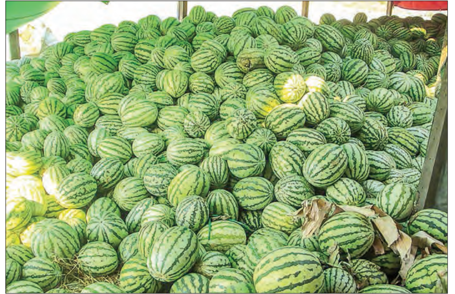
The watermelons are cultivated beside the Mandalay-Gangaw-Kalay highway in Shwebo, Taungkinyan, Myautkhin Yan villages in Gangaw Township.

The watermelons are cultivated beside the Mandalay-Gangaw-Kalay highway in Shwebo, Taungkinyan, Myautkhin Yan villages in Gangaw Township. Watermelons are priced at K700-K1,000 per piece, depending upon the size. However, the watermelon fetched around K1,200 for a small-size one and K2,500 for a big one in Kalay, Tamu, Mawlaik markets in the Myanmar-India border market. —Panthitsa (Kalay)/GNLM