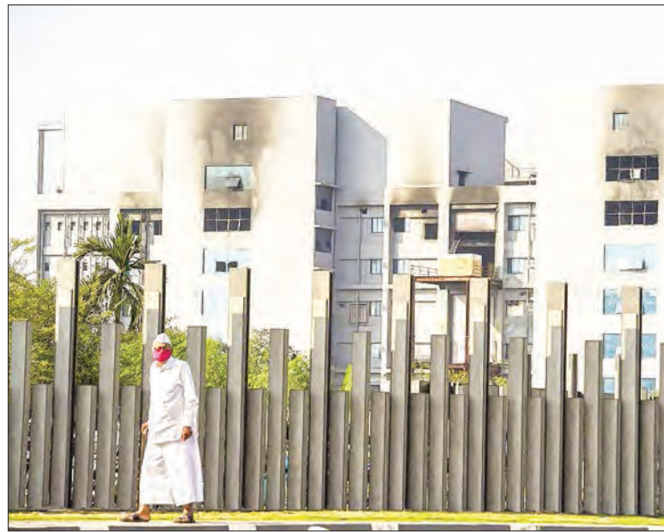
The building where the fire broke out.

Google has already brokered several deals worth millions of dollars with local media companies, including the two largest: Rupert Murdoch's News Corp. and Nine Entertainment. —AFP ■