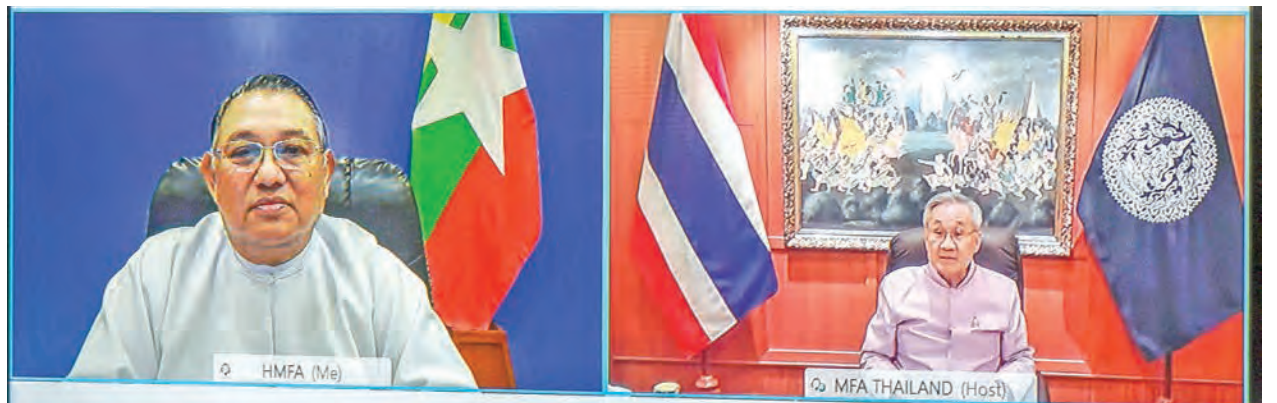
Union Minister U Wunna Maung Lwin holds online talks with Thai Deputy PM and FM Mr Don Pramudwinai on 23 February 2021.

Foreign Affairs, apprised the Thai Deputy Prime Minister and Foreign Minister of the recent developments in Myanmar. The two Ministers cordially exchanged views on matters pertaining to the promotion of the existing bilateral relations and expansion of cooperation, including trade and investment, the prevalence of peace and stability along the border, as well as the provision of necessary assistance