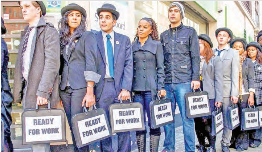
Unemployed youths pose outside a job centre in the UK.

day hinted at further employment support in the coming months as England begins to exit its third lockdown form early March. Details are expected to come in his annual budget next week.