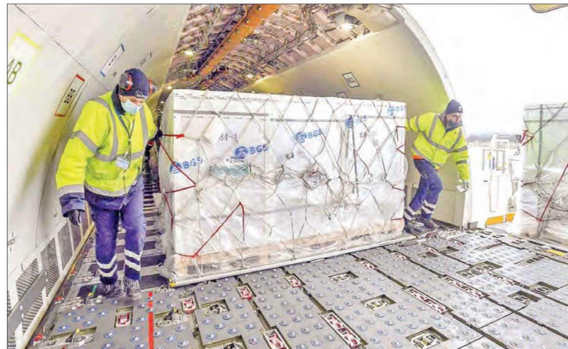
Airport workers unload a shipment of vaccines in Budapest.

"Even if you have the money, if you cannot use the money to buy vaccines, having the money