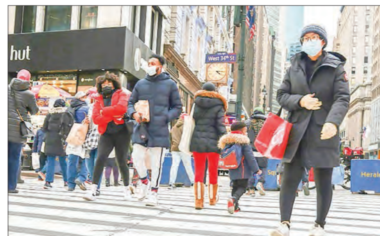
Unfathomable just one year ago, the United States on Monday passed the horrific marker of 500,000 dead from Covid-19.

cuts the message, insisting he himself would not wear one.