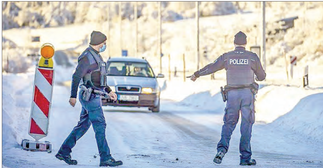
Letters sent on Monday to Belgium, Denmark, Finland, Germany, Hungary and Sweden, highlight a risk of “fragmentation and disruptions to free movement and to supply chains,” commission spokesman Christian Wigand told journalists.

THE European Commission said Tuesday it has formally warned six EU countries that their virus-related border curbs could undermine free movement within