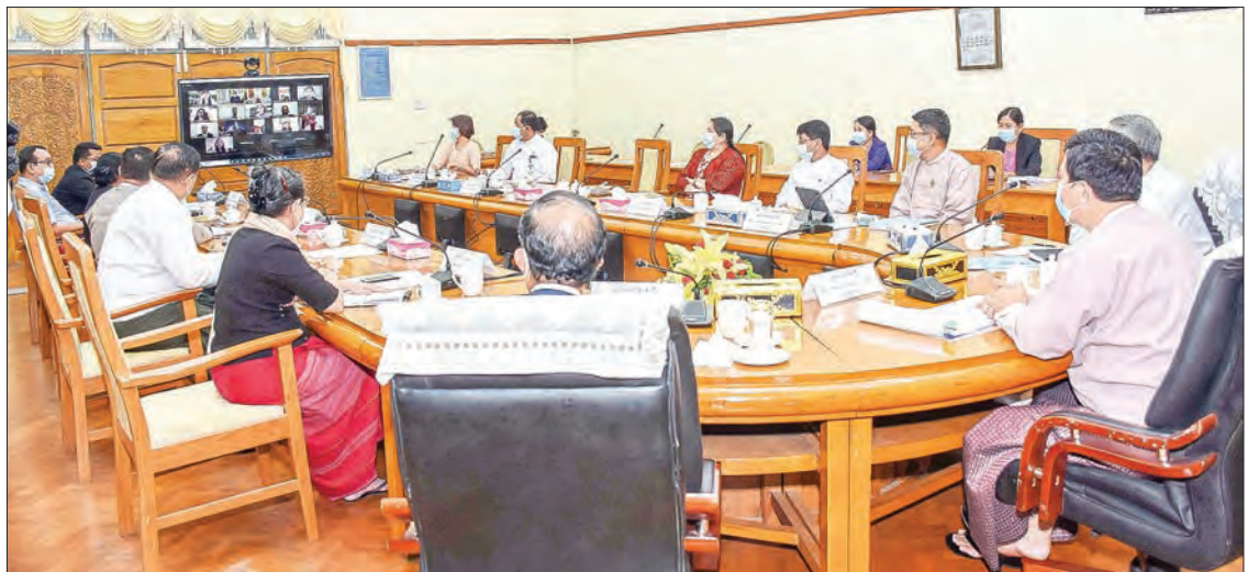
MoC holds the virtual meeting with Myanmar Commercial attachés on trade promotion and new export items yesterday.

The first-day meeting was participated by the Myanmar commercial attachés from the United States, South Africa,