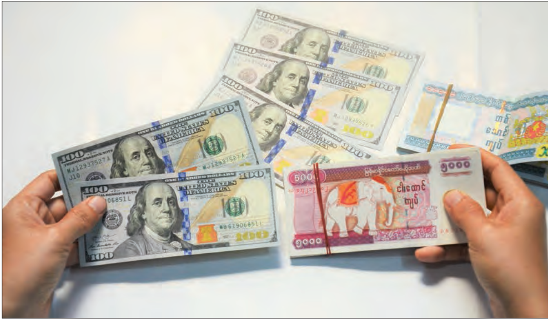
The rate has reached above K1,400 starting from 4 February 2021.

ACCORDING to the Central Bank of Myanmar, the US dollar value against Kyat keeps appreciating in the domestic forex market.