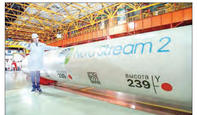
The United States said on Monday it had seen progress from European companies moving out of the Nord Stream 2 pipeline from Russia to Germany, but critics urged stronger action.

“When it comes to our allies and partners, it is fair to say that they would not be taken by surprise by any action we would take,” Price said. “We will continue to monitor activity that could lead to additional penalties including sanctions, but I think it would be wrong to think of sanctions as the only tool in our toolbox here.” —AFP ■