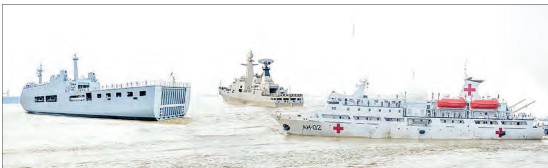
Myanmar nationals, stranded in Malaysia for many years, are repatriated by Navy vessels.

CHAIRMAN of the State Administration Council Senior General Min Aung Hlaing once said the Myanmar nationals stranded in foreign countries for many years should return to the country and arrangements will be made to bring back those nationals as quickly as possible during the meeting of the Union Government held on 2 February.