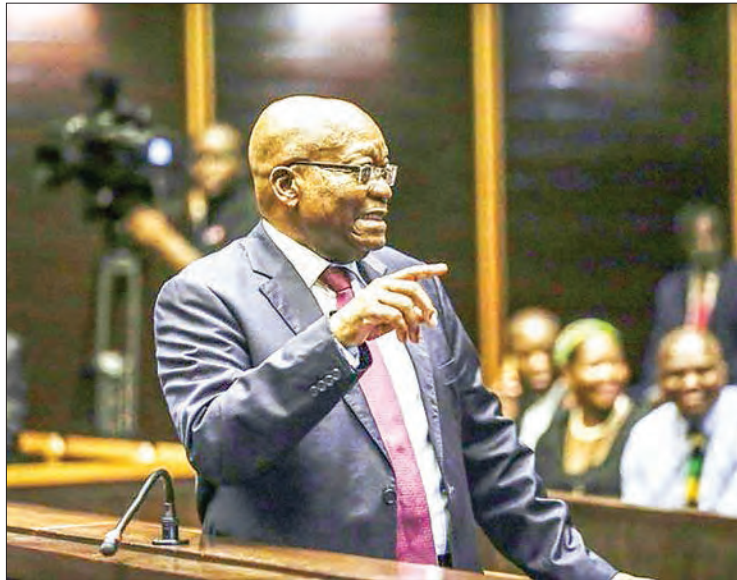
Zuma is accused of taking a rakeoff from a 1999 arms deal with French giant Thales.

SOUTH Africa's scandal-tainted former president Jacob Zuma and French arms dealer Thales, accused of graft in a case going back more than two decades, will go on trial in May, the High Court ruled Tuesday.