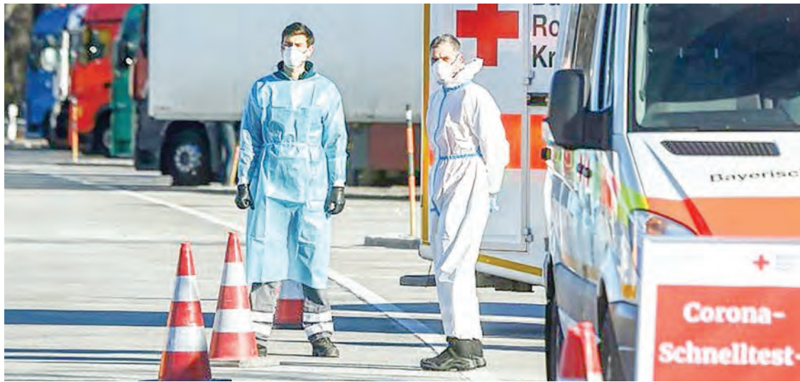
Austria, with a population of just under nine million, tested three million people last week alone.

WHILE Austria has struggled to contain the second wave of the coronavirus pandemic, it is fast emerging as a world leader in testing as a way to reopen schools and businesses.