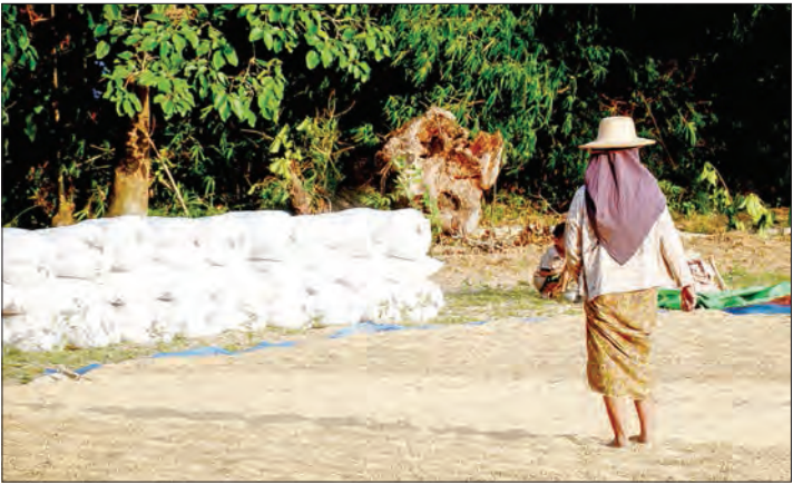
A farmer works on a field as they harvest paddy in Kangyidauk, Ayeyawady Region.

Myanmar generated over $800 million from rice exports in the previous FY2019-2020 ended 30 September, with an estimated volume of over 2.5 million tonnes. —NN/GNLM