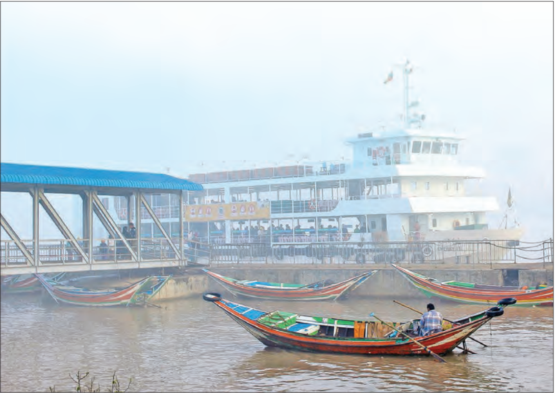
Starting from 9 February 2021, the Dala ferry daily ran 35 rounds between 5:30 am and 7 pm. It plied the routes for 22 rounds between 6 am and 7 pm on weekends. At present, there are about 6,000-7,000 commuters.

FOG forced the Pansodan-Dala ferry operators to reschedule the service for the morning of 1 March 2021. The service resumed when the fog started to clear.