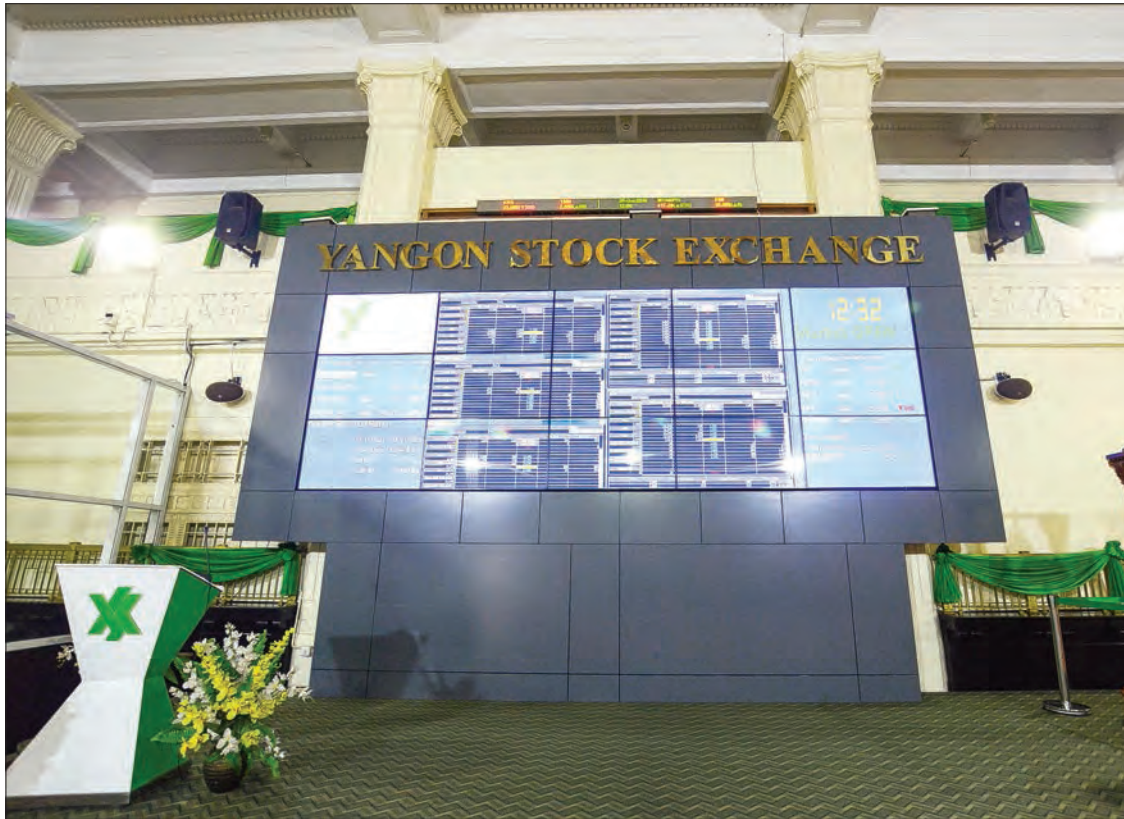
The Stock Exchange in Yangon.

THE listing date, before scheduled, of Amata Holding Public Co., Ltd. (AMATA on Yangon Stock Exchange (YSX)) would be postponed for a certain period. And the rescheduled listing date announced in due time, according to the YSX notification on 26 February 2021.