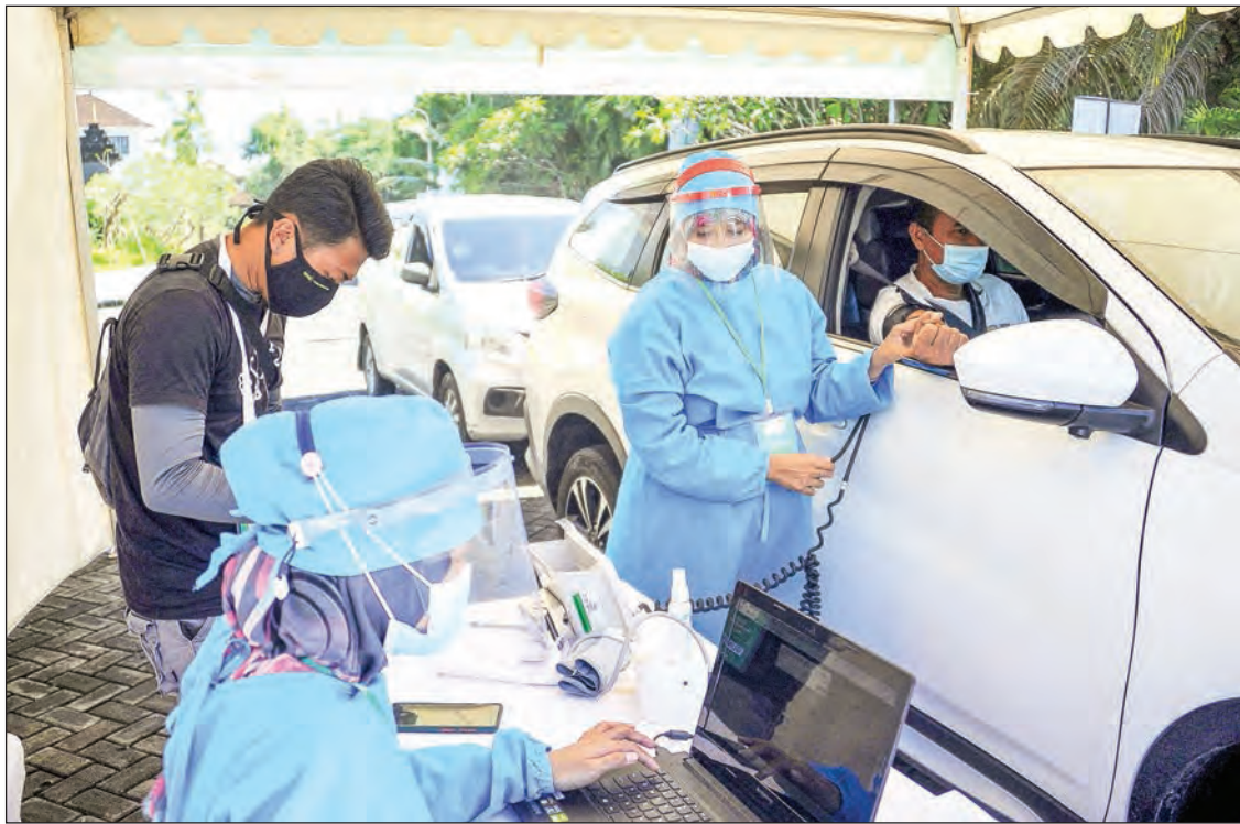
Medical workers prepare to administer the Covid-19 coronavirus vaccine during a drive-through vaccination service in Nusa Dua, Indonesia's resort island of Bali, on March 1, 2021.

INDONESIAN resort island Bali has launched a drive-thru vaccination campaign targeting thousands of hospitality