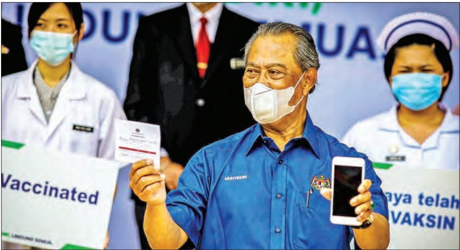
Prime Minister of Malaysia, Muhyiddin Yassin shows his immunization passport after undergoing the coronavirus vaccine process in Putrajaya, Malaysia on Feb.

Muhyiddin took the top job under a new alliance that includes the United Malays National