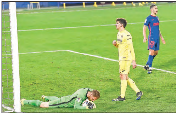
Atletico Madrid's Slovenian goalkeeper Jan Oblak grabs the ball in front of Villarreal's Spanish forward Gerard Moreno during the Spanish league football match between Villarreal CF and Club Atletico de Madrid at La Ceramica stadium in Vila-real on February 28, 2021.

"We suffered, and even after the second goal they had good chances. But we come