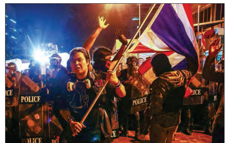
A pro-democracy protester holds the Thai national flag during a demonstration headed toward the residence of Thailand's Prime Minister Prayut Chan-O-Cha in Bangkok on 28 February, 2021.