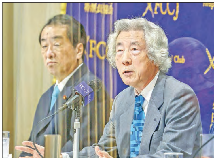
Former Japanese prime ministers Junichiro Koizumi (R) and Naoto Kan attend a press conference at the Foreign Correspondents' Club of Japan in Tokyo on March 1, 2021, urging the country to stop using nuclear power.

Regarding tritium-laced water at Fukushima Daiichi quickly filling up tanks, Koizumi said in the press conference at the Foreign Correspondents' Club of Japan that plans to release the water into the sea were fiercely opposed by local fishermen and that further research into other options was needed. — Kyodo News ■