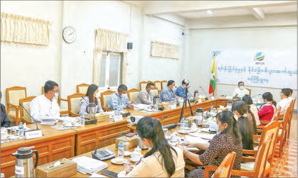
Deputy Minister U Than Aung Kyaw chairs the coordination meeting on signing MoUs of QIPs aided by India in Nay Pyi Taw yesterday.

Energy, Departmental E-Library Project and Water Supply Using Solar Power in Drought affected Villages of Central Dry Zone. The senior officials from respective ministries also discussed on signing MoUs for their specific projects. The meeting was attended by the senior officials from Ministry of Border Affairs, Ministry of Planning, Finance and Industry, Ministry of Natural Resource and Environmental Conservation, Ministry of Education, Union Attorney-General Office and Foreign Economic Relations Department.—MNA