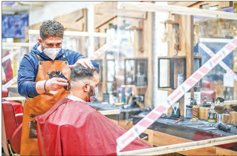
A hairdresser cuts the hair of a client sitting in a space separated by transparent panes at the hair salon 'Harmony' in Dortmund, western Germany on March 1, 2021, on the day of its reopening after being closed for more than two months due to the coronavirus COVID-19 pandemic.

Others worked even longer hours on Monday, with one salon in Dortmund opening on the stroke of midnight and serving customers through the small