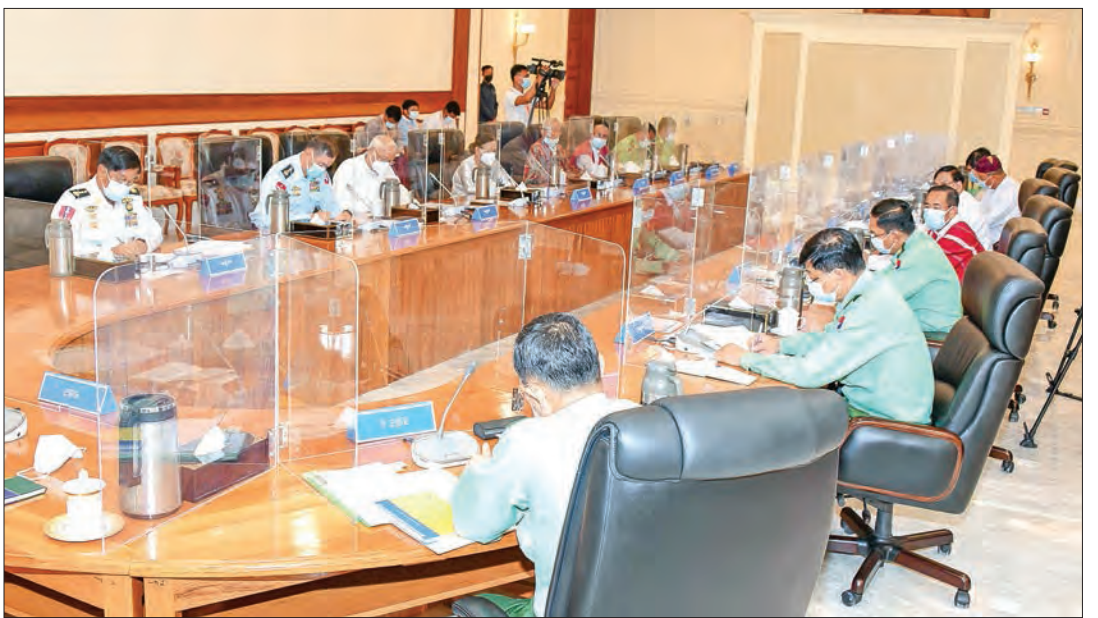
State Administration Council Chairman Commander-in-Chief of Defence Services Senior General Min Aung Hlaing presides over the fourth meeting 4/2021 of the Council in Nay Pyi Taw yesterday.

CHAIRMAN of the State Administration Council Commander-in-Chief of Defence Services Senior General Min Aung Hlaing delivered an address at the meeting 4/2021 of the State Administration Council at his office in Nay Pyi Taw yesterday afternoon.