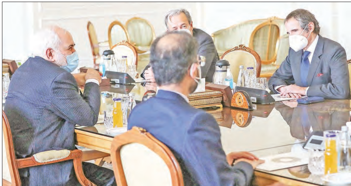
Iran's Foreign Minister Mohammad Javad Zarif (L) meets with the director-general of the International Atomic Energy Agency (IAEA), Rafael Grossi, (R) in Tehran on 21 February 2021.

THE head of the UN's nuclear watchdog appealed Monday for its inspection work in Iran not to become a “bargaining chip” as world powers mull negotiations to revive the 2015 Iran nuclear deal.