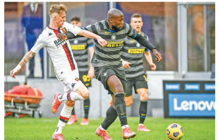
Inter Milan's Belgian forward Romelu Lukaku (C) holds back Genoa's Italian midfielder Nicolo Rovella during the Italian Serie A football match Inter Milan v Genoa on February 28, 2021 at the San Siro stadium in Milan.

"These matches are opportunities for us to give signals to others, but the championship is long."—AFP ■