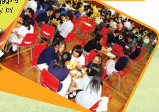
Students chat with their teachers about their favourite books at the Y-Reading Opening Ceremony