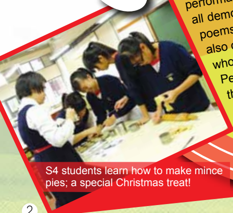
S4 students learn how to make mince pies; a special Christmas treat!