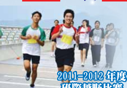
2011-2012 年度 班際越野比賽 各級男子冠軍