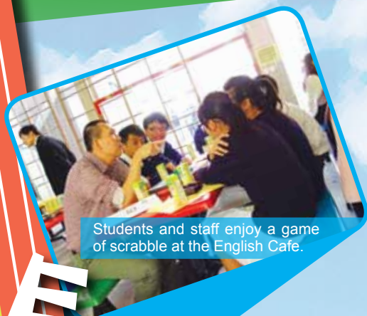
Students and staff enjoy a game of scrabble at the English Café.