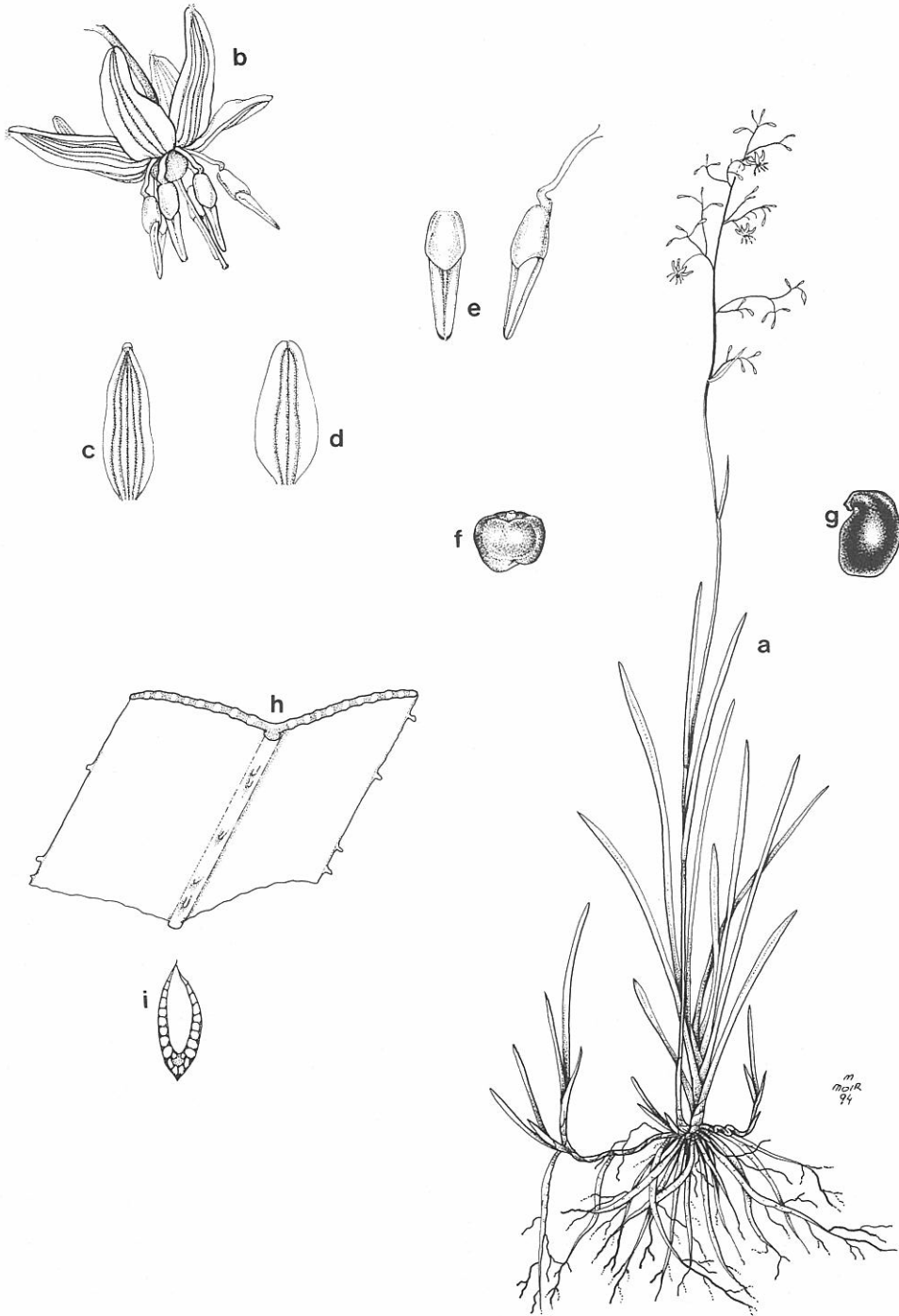
Fig. 2. Dianella amoena . a — habit \times 0.2 . b — flower \times 2 . c — outer tepal \times 2 . d — inner tepal \times 2 . e — anther adaxial — abaxial \times 4 . f — fruit \times 1 . g — seed \times 4 . h — section through mid leaf lamina \times 4 . i — cross section mid leaf sheath \times 4 .