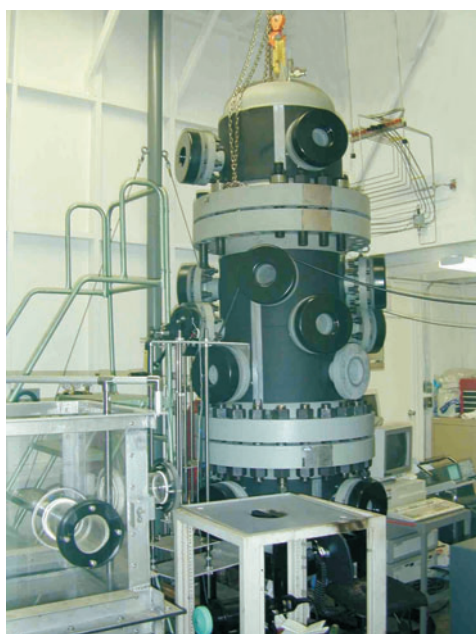
Laboratory high pressure test rig

This is not possible at present; specifically designed research programmes are needed to provide this information. Better understanding is also needed of the various natural processes, which determine the carbon cycle in the ocean.