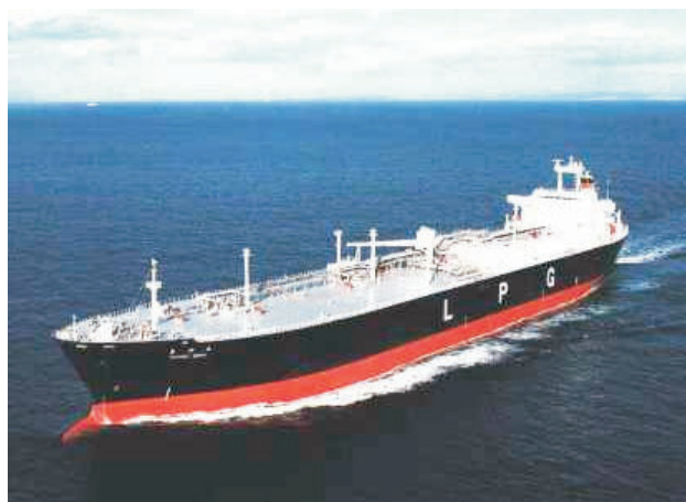
An LPG tanker - CO 2 could be transported in a similar way

Questions regarding the legal basis for such action need to be addressed. For example, the discharge of CO 2 from ships has not been specifically considered for inclusion under the London Convention (which regulates discharges into the ocean), so at present it would not be permitted. In addition, the jurisdiction of governments wishing to use this option would have to be considered. Public understanding and opinion about the use of the oceans for this purpose will also be important.