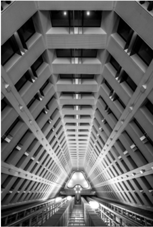
Yoo yeon, Vision , 2020, Photography, 100 x 200 cm