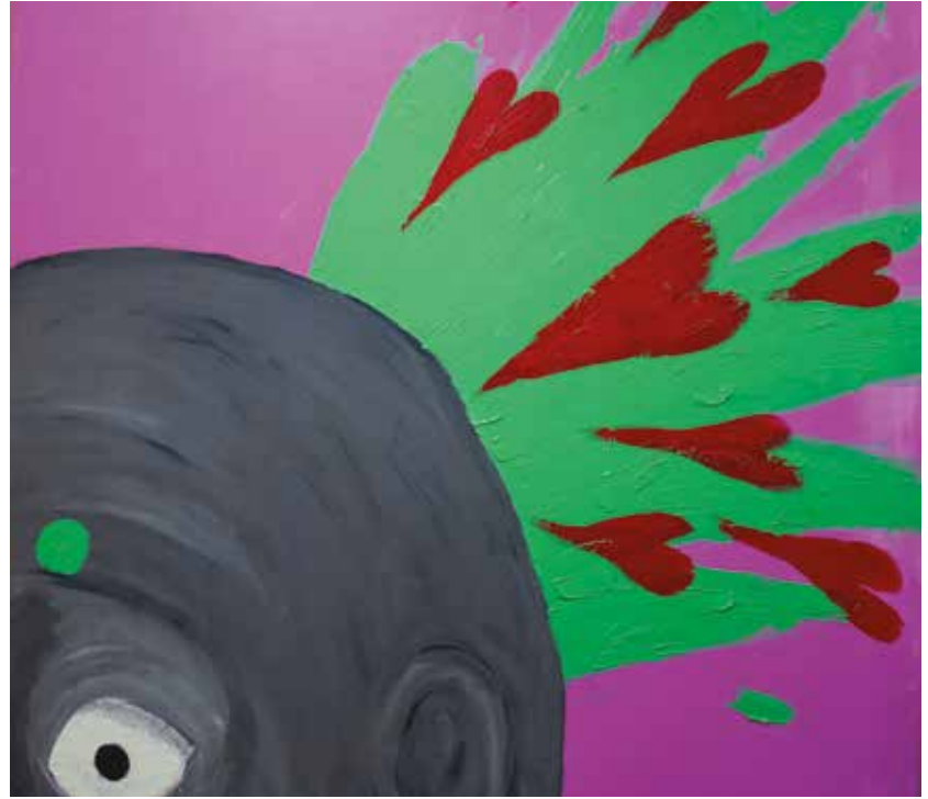
Ohnim, 4th First Love , 2020, Acrylic on canvas, 150 x 150 cm