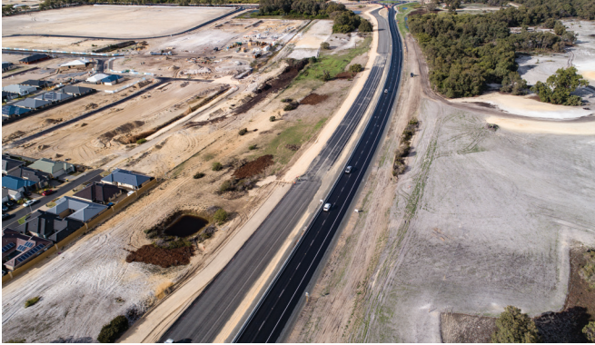
New Lord Street looking south towards Whiteman Park Entrance

The map over page shows the ultimate road layout with future road names.