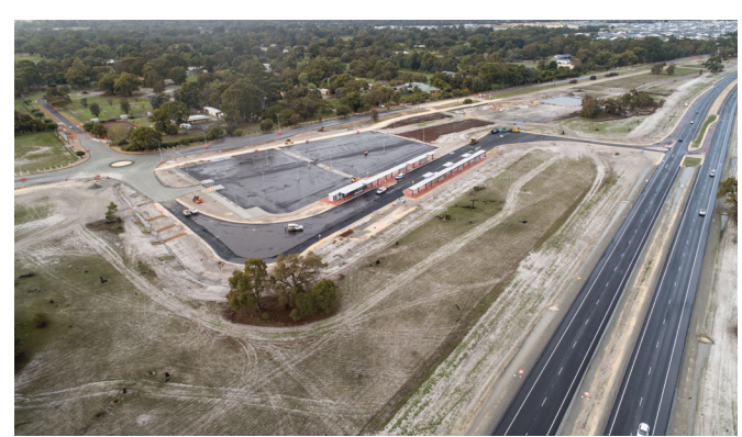
Henley Brook and Henley Street roundabout progress works