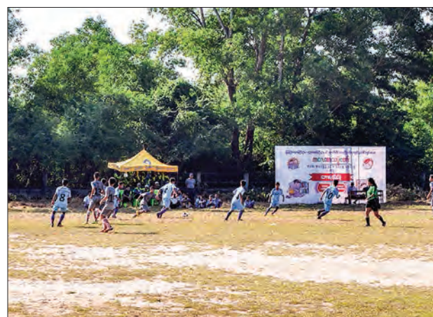
Football matches are played in the playground.