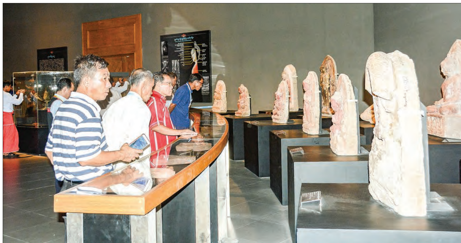
People visit the National Museum in Nay Pyi Taw on 16 July 2018.

The books could be categorized as (1) encyclopedia; (2) condensed; (3) dictionary; (4) handbook; (5) guide book; (6) autobiography; (7) map; (8) gazet-