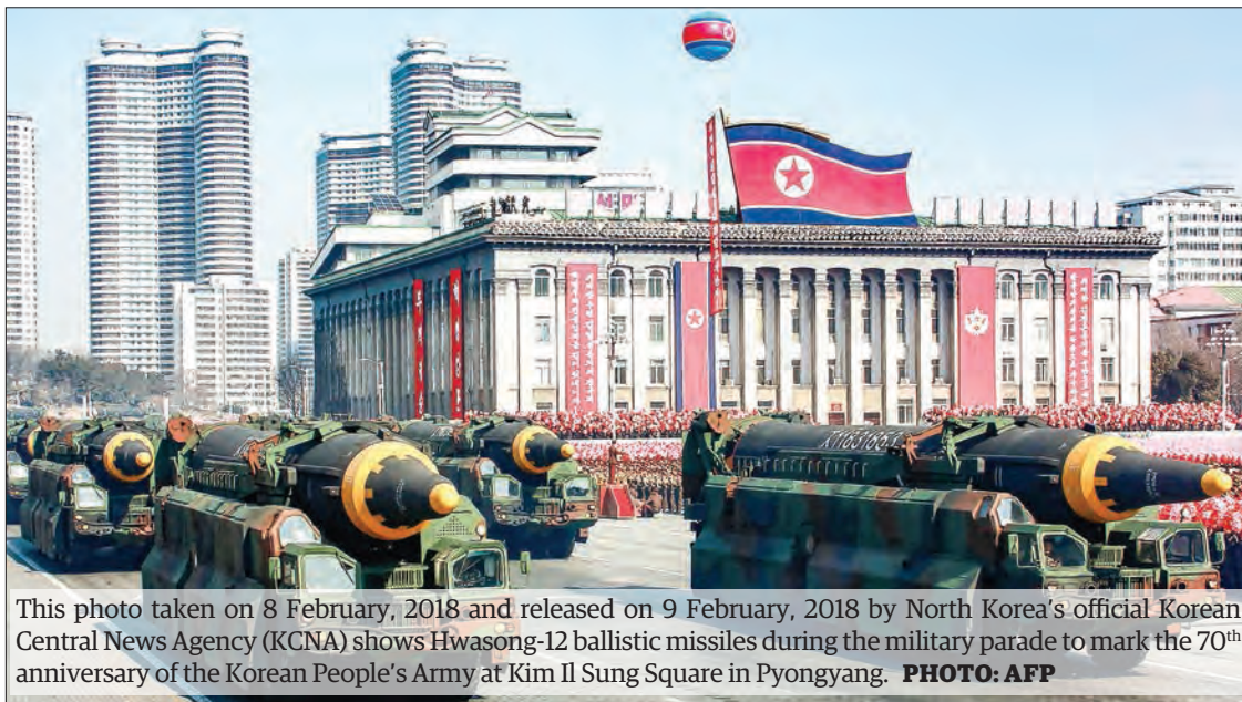
This photo taken on 8 February, 2018 and released on 9 February, 2018 by North Korea's official Korean Central News Agency (KCNA) shows Hwasong-12 ballistic missiles during the military parade to mark the 70 th anniversary of the Korean People's Army at Kim Il Sung Square in Pyongyang.