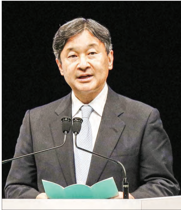
Japanese Crown Prince Naruhito.

TOKYO—Japanese lawmakers and business leaders plan to hold an event next fall to celebrate the ascension of the new emperor, political sources said on Saturday.