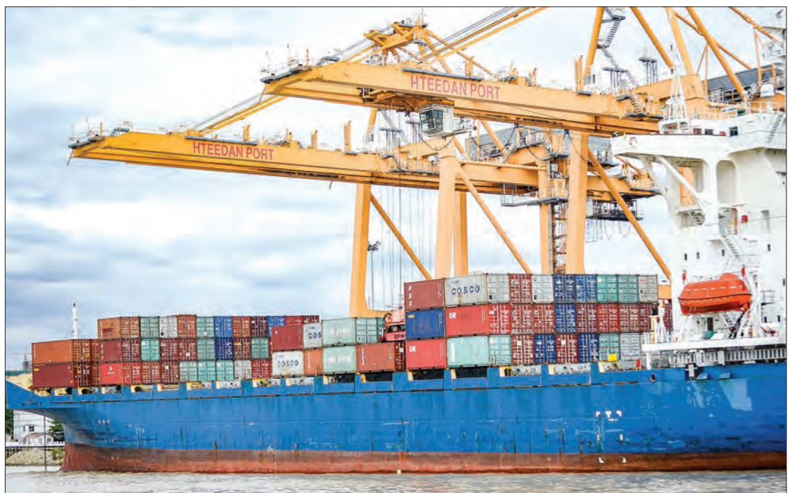
A container ship docking at Botahtaung Jetty in Yangon.

Also, the 3 rd round of meetings on the Promotion and Protection of Investment Agreement