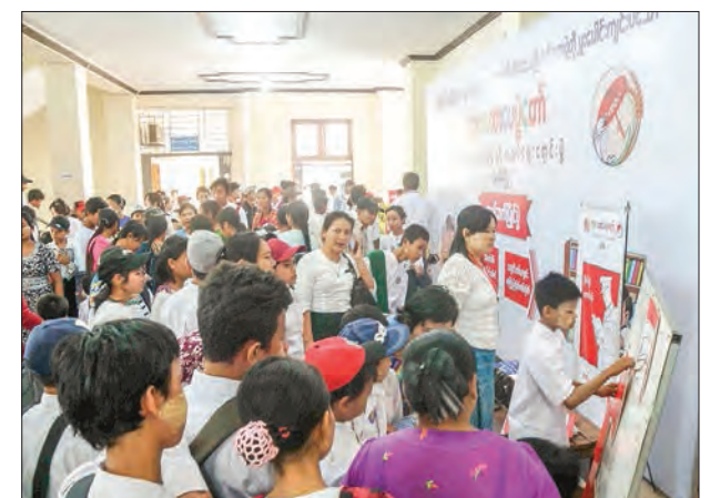
Children participate at quiz and games program.

STUDENTS, teachers and the general public visited Pathein University in Pathein, Ayeyawady Region, as the second day of the Children's Literature Festival, Literature Ex-