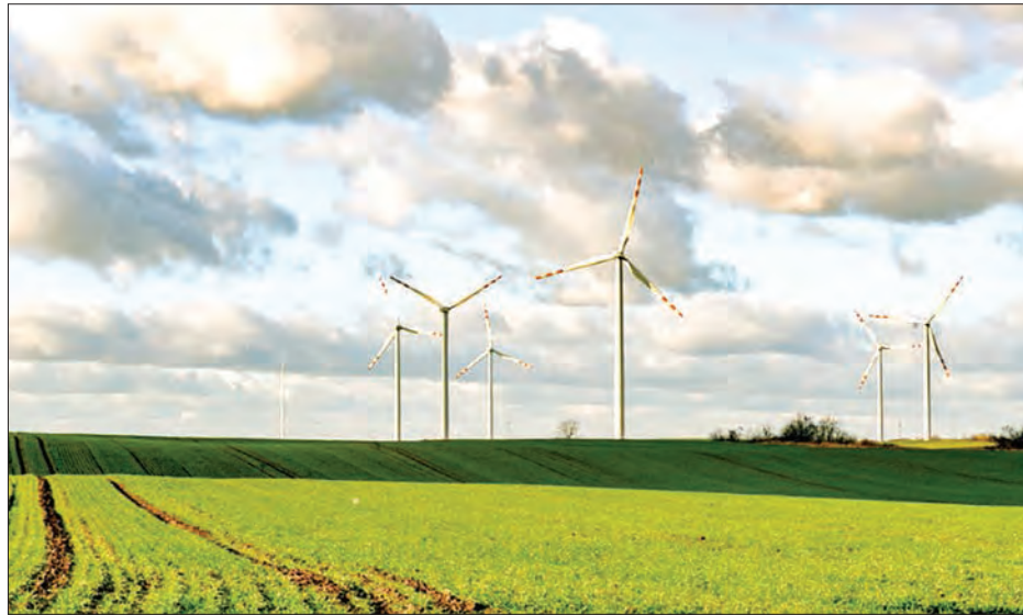
More wind turbines are needed if Poland is to meet its green energy commitments.

Poland currently has around 6.4 gigawatts of installed wind power, compared to neighbouring Ger-