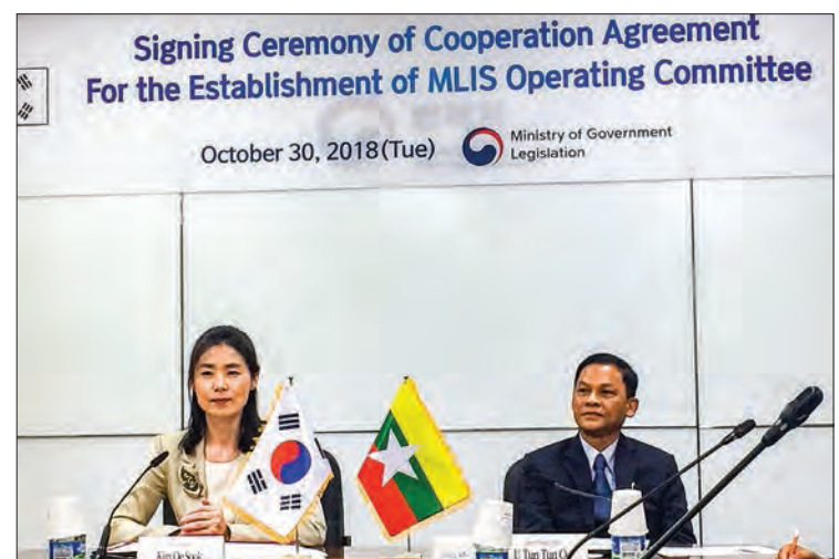
Union Attorney-General U Tun Tun Oo attends the Signing Ceremony of Cooperation Agreement for the establishment of MLIS Operating Committee in Seoul.

It acts as the analyst and adviser for the bills drawn by the ministries, which present the bills to the Hluttaw under the approval of Union government. The Union Attorney-General Office takes part in analysing the bill at the Hluttaw on request. Public interest in the legislative work is rising, and public advice is taken for the good of the legislative process. If necessary, workshops