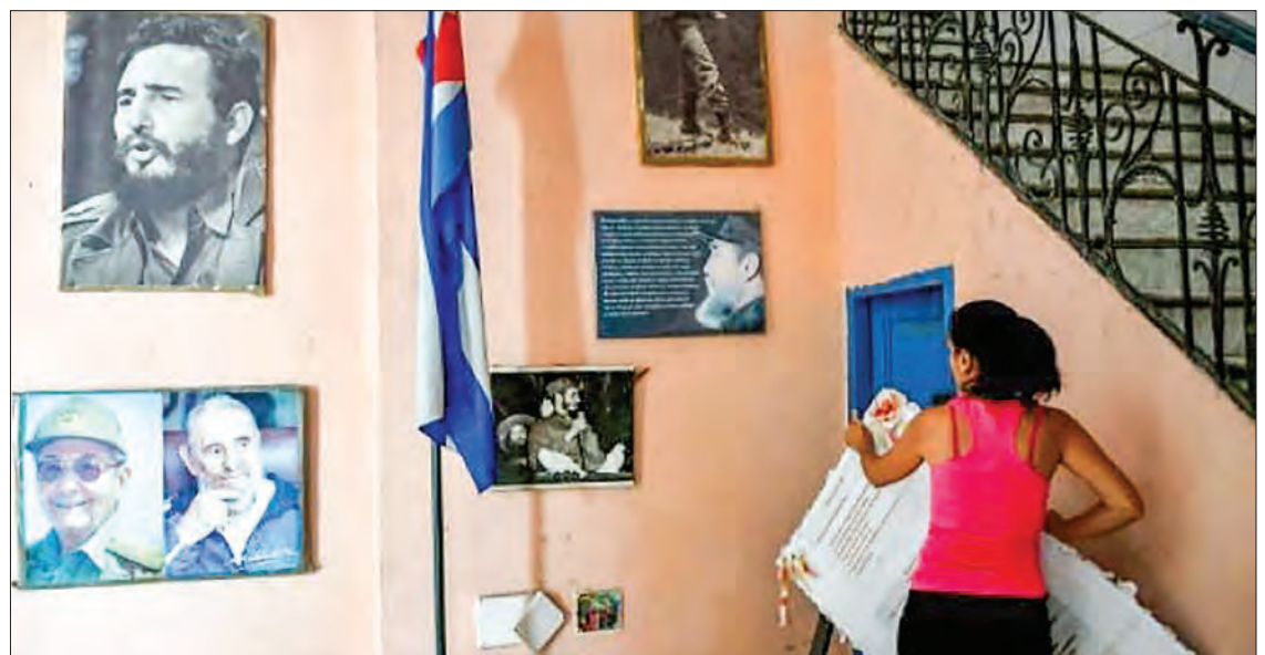
A new center devoted to the study of late Cuban leader Fidel Castro, whose pictures are seen here on the wall of a Havana school, will open by the end of 2019.

The institute will be based in Havana's central El Vedado neighbourhood and should open by the end of next year, coinciding with the 500 th anniversary of the city's founding. — AFP ■