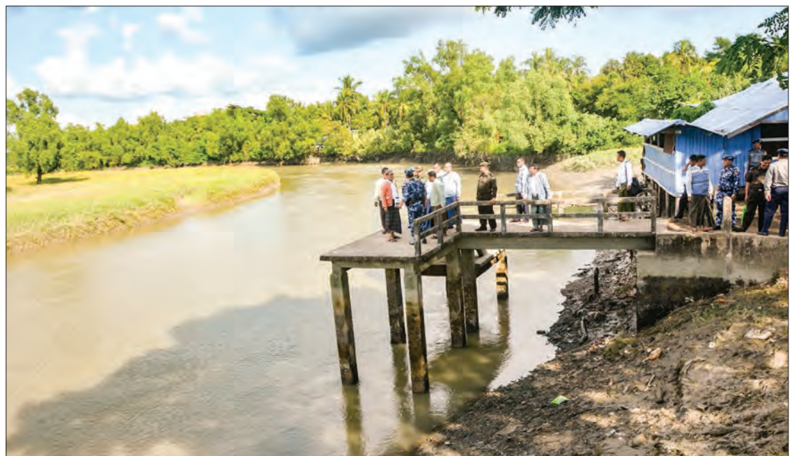
Rakhine State Chief Minister U Nyi Pu and officials inspect homes, water supply, reception counter and staff quarters at the Ngakhuya reception centre.

The Chief Minister and party inspected the homes, water supply, reception counter and staff quarters at the Ngakhuya reception centre. They also observed homes, health clinic, power lines and roads at Hla Po Khaung reception centre.— Kyaw Thu Win and Aung Kyaw Oo (Translated by TMT) ■