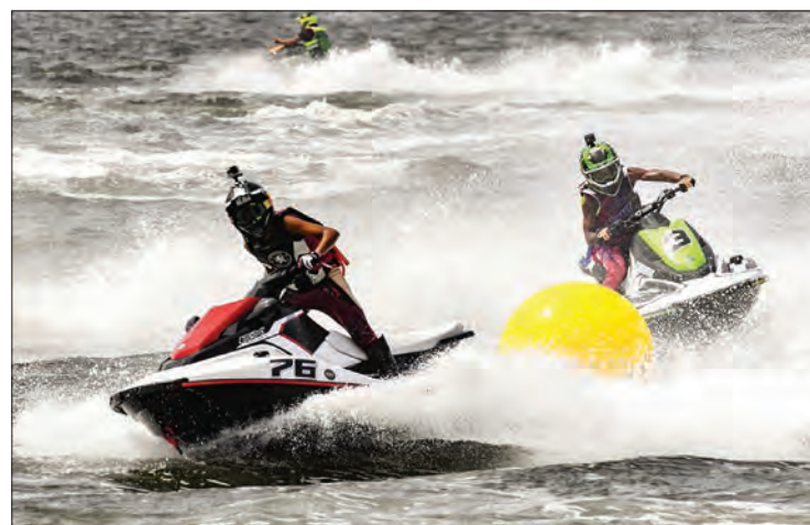
Supplied photo shows the jet ski competition at the Asian Games in Jakarta on 24 August, 2018.

In March, the Japan Marine Industry Association organized for the first time a seminar featuring boat fishing lectures for women and a study session on ways to enjoy rides on small inflatable boat during an annual international boat show.—Kyodo News ■