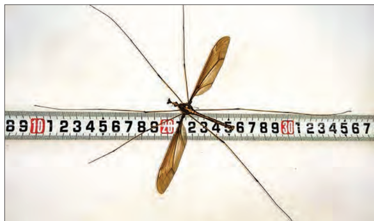
Photo taken on 12 October, 2018 shows the specimen of a giant mosquito at the Insect Museum of West China in Chengdu, capital of southwest China's Sichuan Province.

The researchers also performed individualized network analyses on the 10 people in the data set, and found that while brain functions are arranged in roughly the same pattern in everyone's cerebellum, there is enough individual variation to distinguish brain scans performed on any two participants. —Xinhua ■