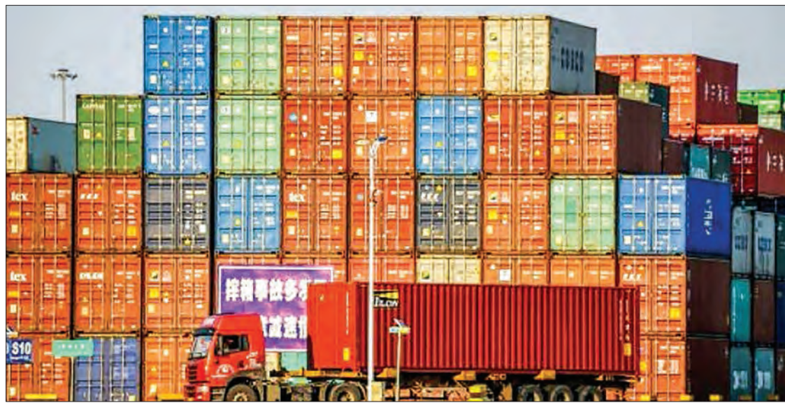
Manufacturing gauges in several export-reliant Asian countries, as well as China, weakened in October.

Taiwan saw its steepest falls in production and new business in just over three years, purchasing activity by companies fell for the first time since May 2016, and firms anticipate lower factory output in the next 12 months, Nikkei/IHS Markit said. "Taiwan is feeling the effects of this trade war because China is the factory for many companies in Taiwan. When the estuary is blocked, you