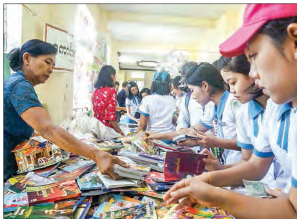
Youths choosing books at the book-stall.