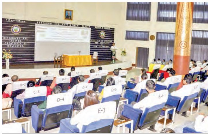
The Signing ceremony for the manufacturing of electric buses being convened.

Accordingly, the ministry will manufacture electric buses and charging stations, in cooperation with Green Power Myanmar Co Ltd, by adapting the technology of Csepel Holding Limited of Hungary. He also