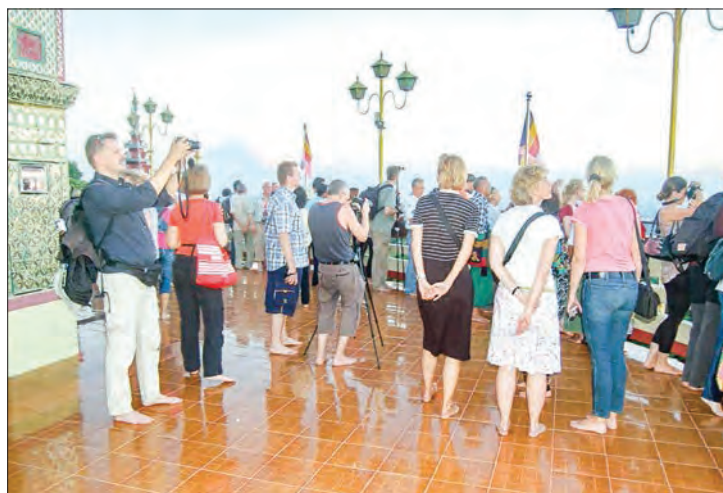
Tourists seeing scenic views of Mandalay from the top of Mandalay Hill.

Later, he urged the MIA authorities and officials of Myanmar National Airlines to make all-out efforts to facilitate visas on arrival and the sharing of information through an electronic system, and discussed further plans. Then, the Union Minister left for Mogok. He visited the potential tourist destinations of Mogok area, including the over-a-century-old British cemetery