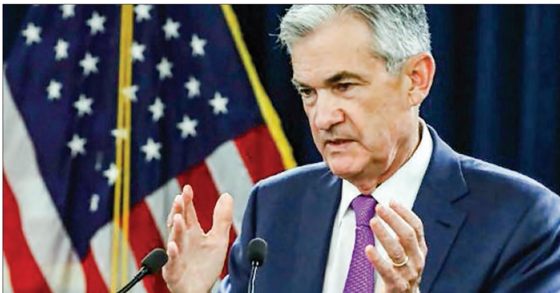
Federal Reserve Board Chairman Jerome Powell will try to tap on the economy's brakes so that growth continues without inflation.

Fed officials have made it clear the economy can continue to perform well for some time with the current course of rate increases.