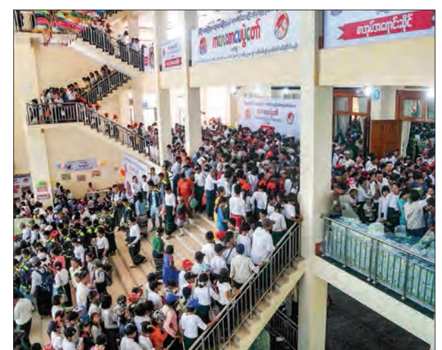
The festival hall packed with people.