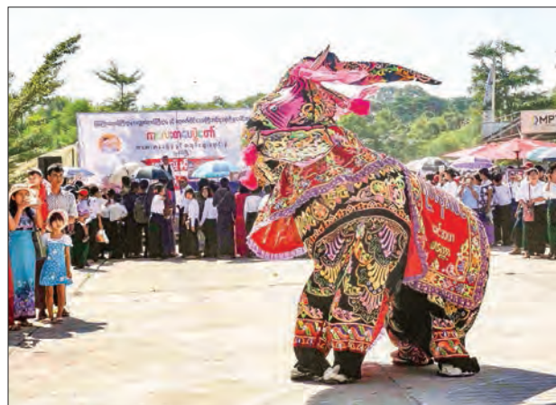
Kyaukse elephant dance attracts the people.