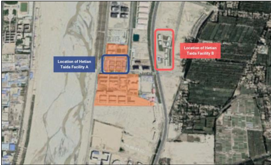
Figure 8. The locations of Hetian Taida’s two main production facilities, labeled as Facility A and Facility B. The area shaded in orange is the HVETC internment camp. Facility B is located less than 500 yards from Facility A and less than 350 yards from the border of the HVETC camp.

As described earlier in this report, journalists, human rights groups, and independent researchers report that some factories associated with Xinjiang internment camps are located within the camps and that others are located nearby . 67 Reports also indicate that, in addition to forcing current detainees to work inside the internment camps, the Chinese government practices another form of forced labor: the government forces some of the detainees it has released – “graduates” in government parlance – to work at designated factories outside of the camps. The WRC’s concern with respect to Hetian Taida’s second factory location is the possibility that this form of forced labor is or was utilized at the facility.