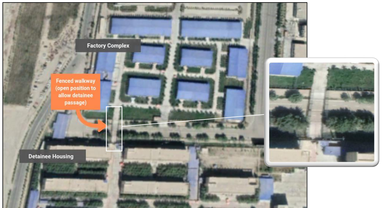
Figure 7b. Secure walkway between detainee housing and production buildings, with gates in open position (September 2018).

The existence of a secure, fenced walkway between detainee dormitories and the factory complex housing Hetian Taida constitutes definitive evidence that camp detainees were working