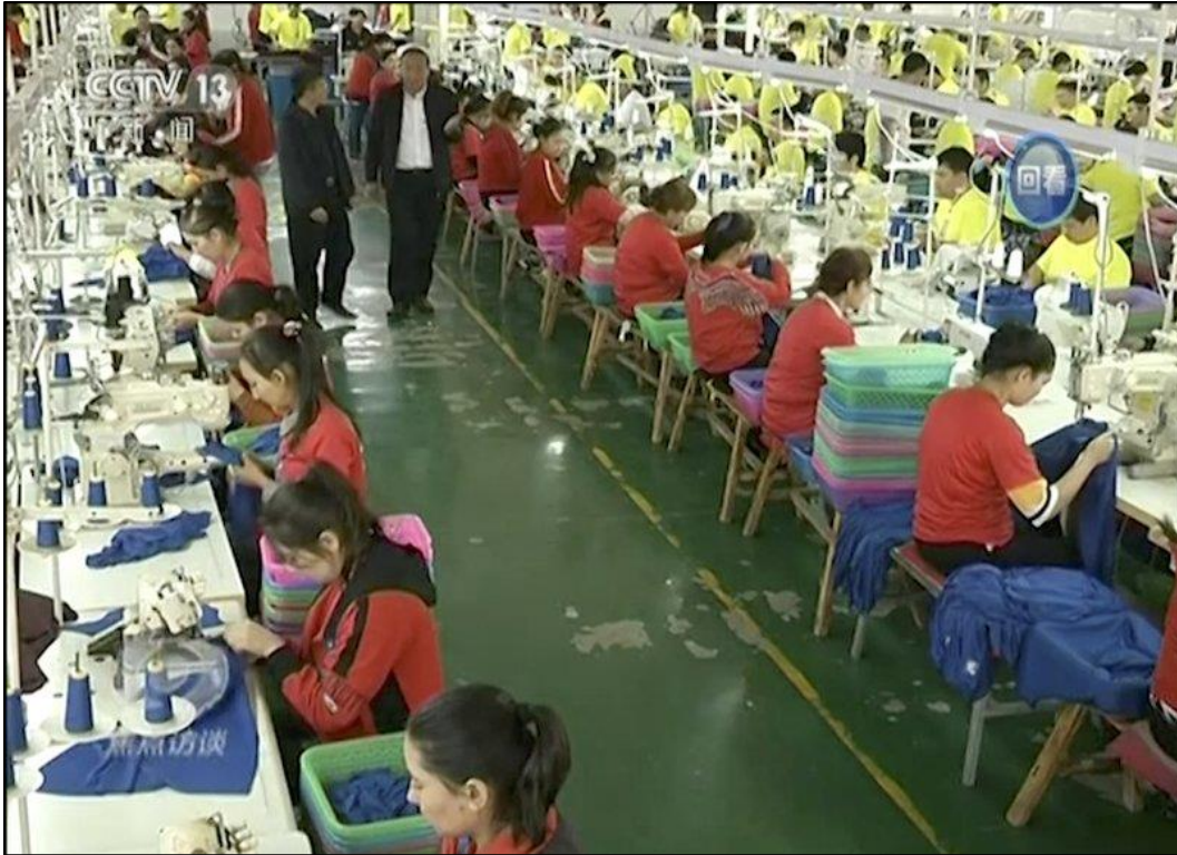
Figure 5. Still from video broadcast on Central China Television, aired on October 16, 2018, showing detainees sewing garments inside the HVETC internment camp.

Far from convincing anyone that the enterprise is benign, the government’s propaganda video exhibiting production workers in the HVETC was interpreted around the world as definitive proof of the existence of a forced labor regime in Xinjiang. 50