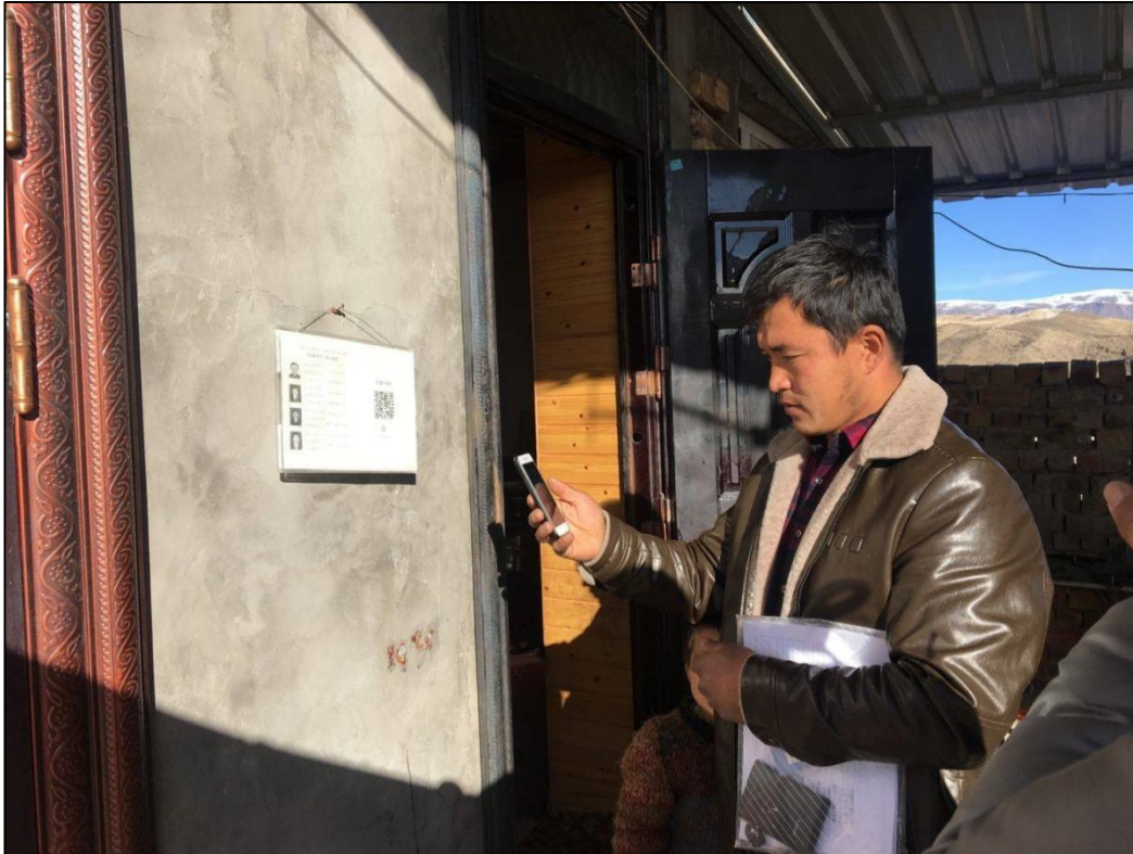
Figure 1. Government official scanning the QR code on the wall of a home in Xinjiang, giving him instant access to the residents' personal information.

Efforts to compel Uyghurs to abandon their religion and their language, and to break their resistance to Chinese rule, are framed and defended by the Chinese regime as saving Uyghurs from religious extremism, on the one hand, and from economic backwardness, on the other. These are presented as the drivers of Uyghur “terrorism,” a supposedly widespread phenomenon that exists mostly as an invention of government propaganda. The regime claims it is bringing the Uyghurs into the modern world through schooling, skills training, and economic development programs. Unfortunately, the government’s approach to schooling involves heavy doses of forced “re-education,” including political indoctrination with the ideology of the Chinese Communist Party and pressure to abandon Uyghur language and religious and cultural tradition. And the regime’s job training and economic development strategy in Xinjiang increasingly serves as a means of repression and political control. As The New York Times observed, citing official government planning documents, the regime seeks to transform the Uyghur population “into a disciplined, Chinese-speaking industrial work force, loyal to the Communist Party and factory bosses.” 17