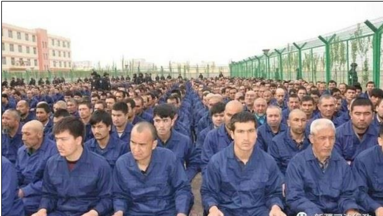
Figure 2. Photo posted to the WeChat account of the Xinjiang Judicial Administration shows Uyghur detainees listening to a “de-radicalization” speech at a “re-education” camp in Hotan prefecture's Lop county, April 2017.