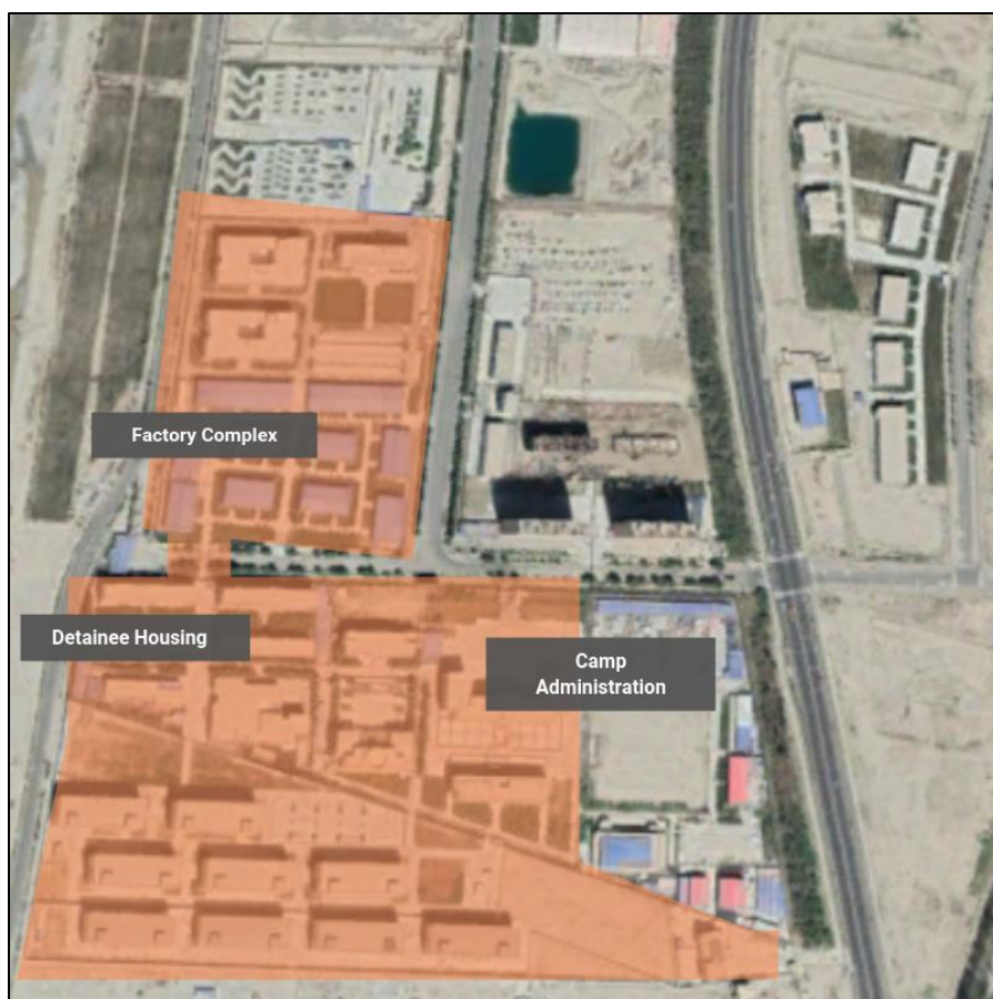
Figure 6. Confines of the HVETC internment camp. 61

The question of when the factory complex was integrated into the camp is thus pertinent to the WRC’s investigation. Badger argues that this occurred sometime from May 2018 onward. Aerial image analysis and a Chinese government news report, however, show that the incorporation of the factory complex occurred earlier and that it operated as part of the camp during the period when Badger acknowledges sourcing there.