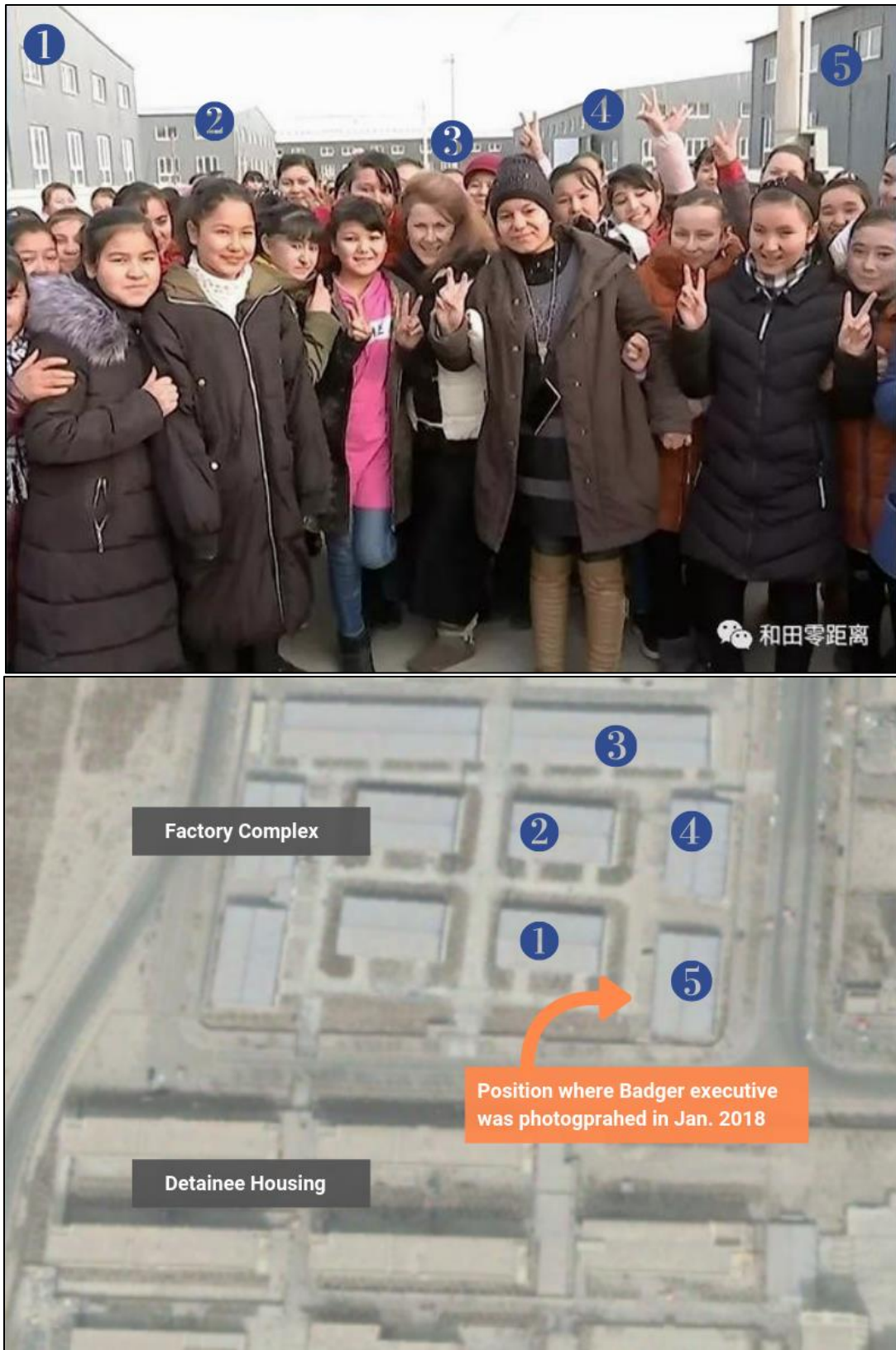
Figure 4. Comparison of aerial and ground-level images, proving Badger executive was present in the factory complex later revealed to be part of the HVETC camp.