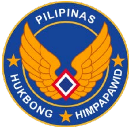
Philippine Air Force Supply and Delivery of M4 Rifles