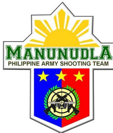
Philippine Army Shooting Team Supply and Delivery of Rifles