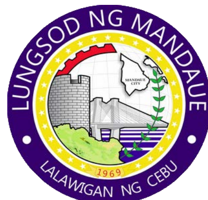
City of Mandaue, Cebu Supply and Delivery of Rifles for Local PNP