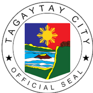
City of Tagaytay Supply and Delivery of Assault Rifles