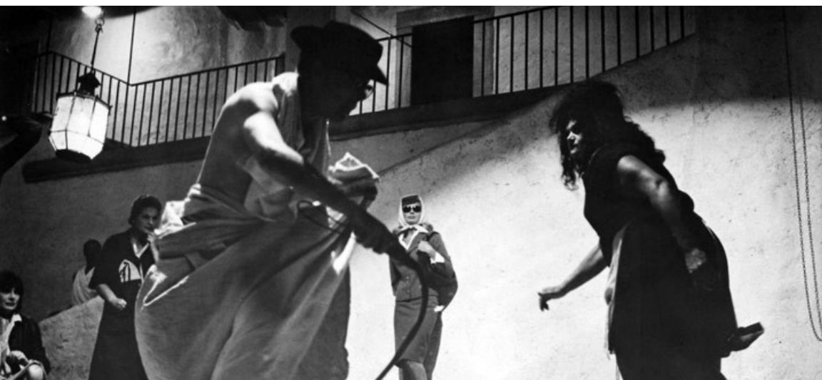
Fig. 3. Federico Fellini's 8½ (1963), which appears in both the US Legion of Decency's list of condemned films as well as the Vatican Film List comprising titles endorsed to the Catholic faithful.

was an arthouse hit, as was an even earlier entry, Faster, Pussycat! Kill! Kill! (1965), described as Russ Meyer's tribute to bosomania. Films with outright pornographic sequences can at present be submitted to compete in the A-list film festivals of Europe, and even win major awards for the effort.