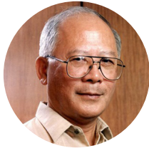
Bienvenido Lumbera University of the Philippines