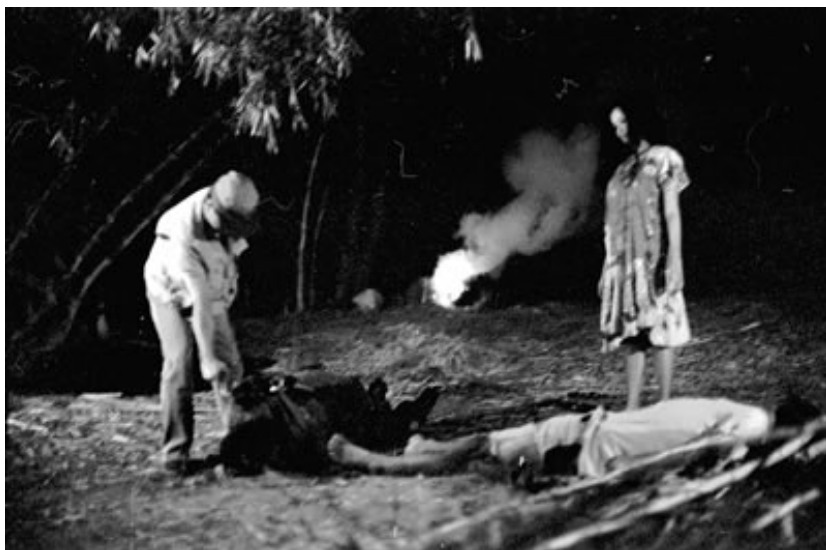
Fig. 6. An exacerbation of the victim's trauma by making her witness the murder of her adoptive family. ( Ebolusyon ng Isang Pamilyang Pilipino , Sine Olivia, Paul Tañedo Inc., Ebolusyon Productions, 2004)