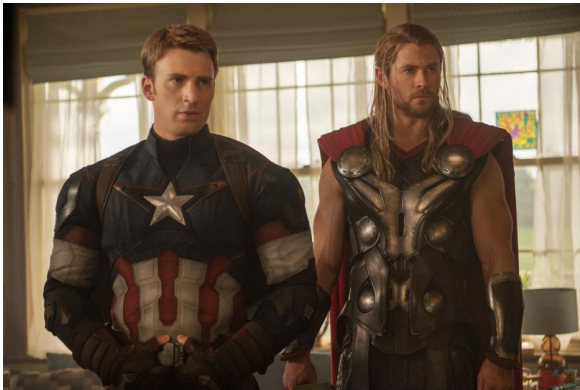
Fig. 2. Still picture ng Avengers: Age of Ultron ni Joss Whedon. (Marvel Studios at Walt Disney Pictures, 2015)

Hindi yan excerpt huh. Yan na yung buong review. Kinarir ko na yan nang lagay na 'yan. Wag nga kayo . Work in progress pa ako nun ok?