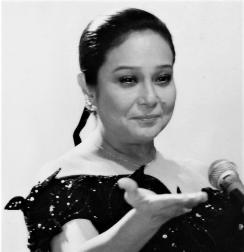
Fig. 1. Multimedia Philippine star Nora Aunor (born 1953).

readers. The feedback I received for my reviews, however, proved that our audiences (essentially overlapping with readers during the time when movie-going was still a widespread regular activity) were capable of grasping complex ideas in polysyllabic language, as long as it helped elucidate for them insights and lessons on our national pastime.