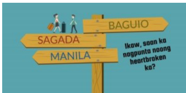
Fig. 3. That Thing Called Tadhana publicity material. (Cinema One Originals, Epicmedia, Monoxide Works, and One Dash Zero Cinetools, 2014)

these future-leading folks, not when these young ones feel like they have to be or mimic their mainstream mentors in order to be taken to the fold. In a way, if this is the objective—to become one with the fold—then this film has already succeeded. But seeing that the future may also want to have a different take on things, then maybe we still have to see what they will come up with next, in order for us to get excited more about how they could revive the future of this art we so love. But yes, this is indeed a great start.