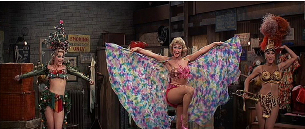
Fig. 5. Still pic ng “You Gotta Have a Gimmick” number sa Gypsy ni Mervyn LeRoy. (Mervyn LeRoy Productions, 1962)

Una, sabi nga ng mga pokpok na stripper sa Gypsy [dinirhe ni Mervyn LeRoy, Mervyn LeRoy Productions, 1962], “you gotta have a gimmick” (Pigura 5), at yun yung gimmick ko. When I started the blog, all I wanted was to express myself and be read. Yung desire to be of service sa industry came later, and by that time medyo established na yung character at brand nung blog. May brand-brand pa talagang nalalaman ’noh?