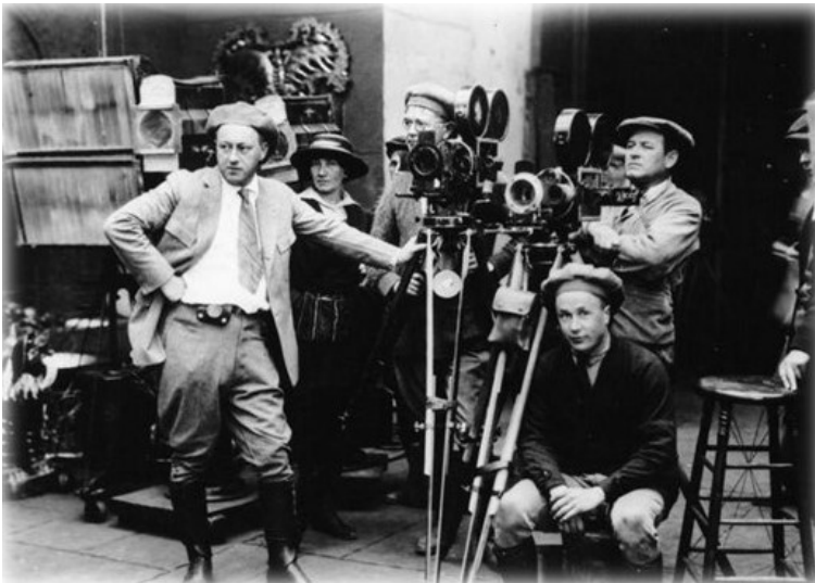
Fig. 1. Printing as an extension of literary production, vs. film production as the essential component of filmmaking. (Above: below: Cecil B. DeMille on an early movie project,)