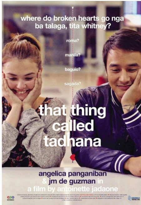
Fig. 1. That Thing Called Tadhana layout/poster. (Cinema One Originals, Epicmedia, Monoxide Works, and One Dash Zero Cinetools, 2014)

mainstream, the alternative, or the indie. And if they so choose to be part of the film future, then they better prepare for it in the present by looking into the past. For we are only doomed to repeat the mistakes of history when we don't really learn from it. Tama po ba, Sir Teodoro Agoncillo? 1 But I digress.