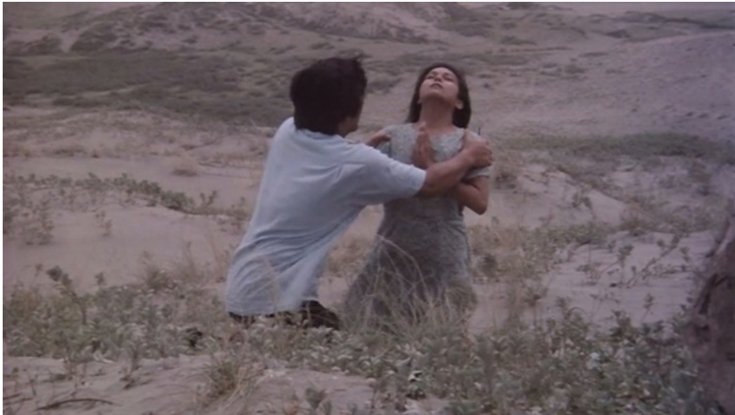
Fig. 3. Still pic ng Himala ni Ishmael Bernal. (Experimental Cinema of the Philippines, 1982)

Parang mumurahing kolboy, nagpasalinsaling-bibig ang chismis ng faith healing and before you know it dinagsa na ng iba't-ibang uri ng maysakit ang balur ni Elsa kasunod ang mga paparazzi.