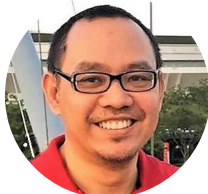
Ruanni Tupas National Institute of Education, Singapore