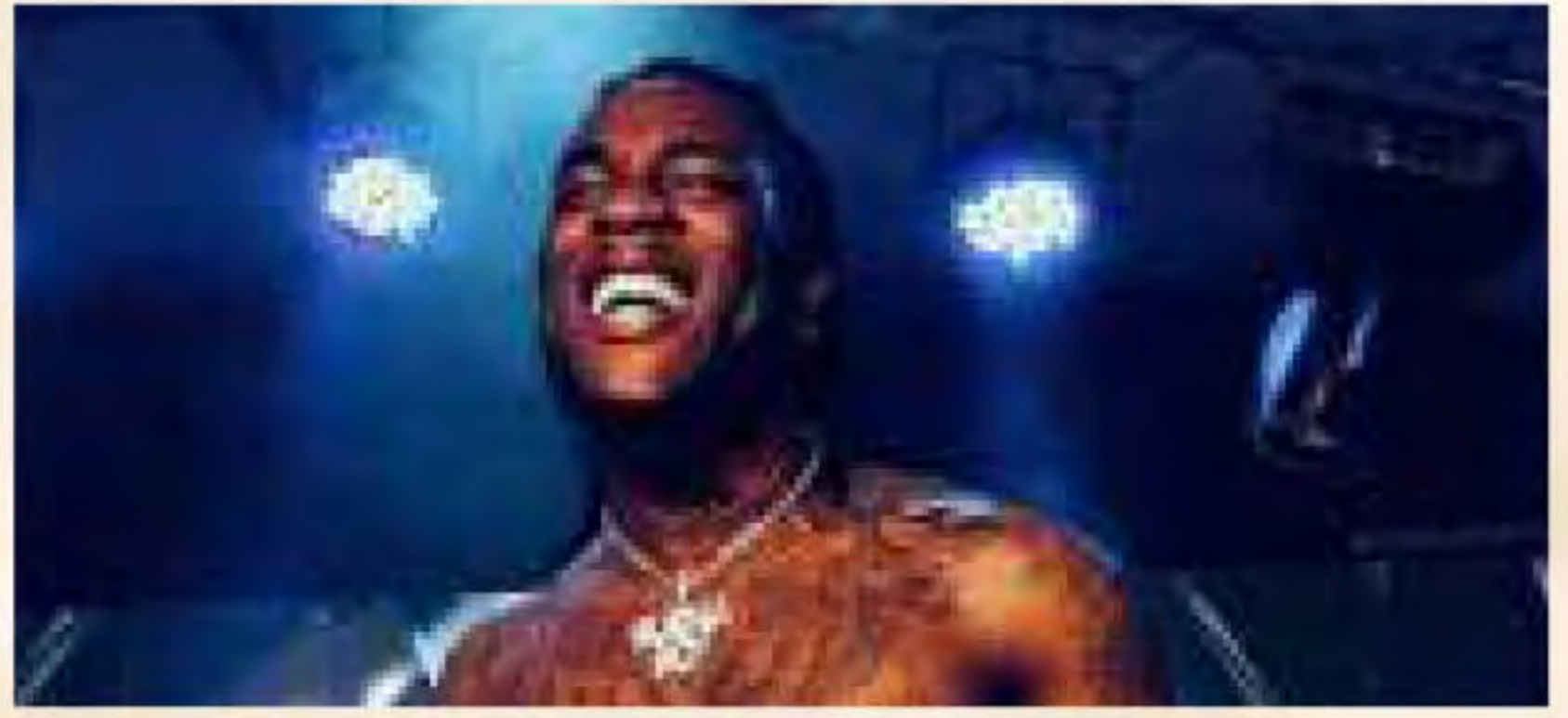
The BurnaBoy Show