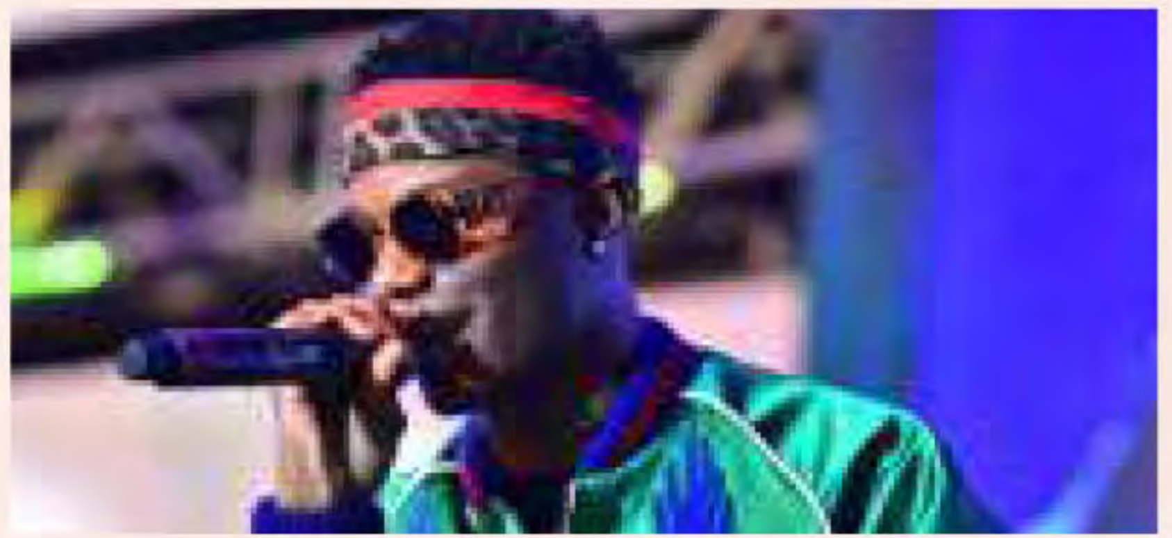
Wizkid: The Concert