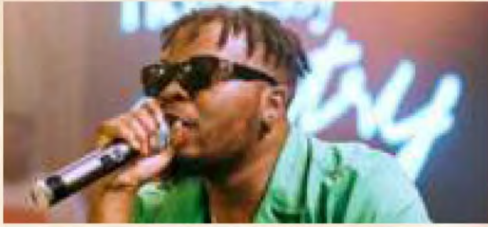
Olamide in Concert

Date: November | Venue: Eko Atlantic City; Eko Convention Centre; Landmark Beach Front; Balmoral Convention Centre