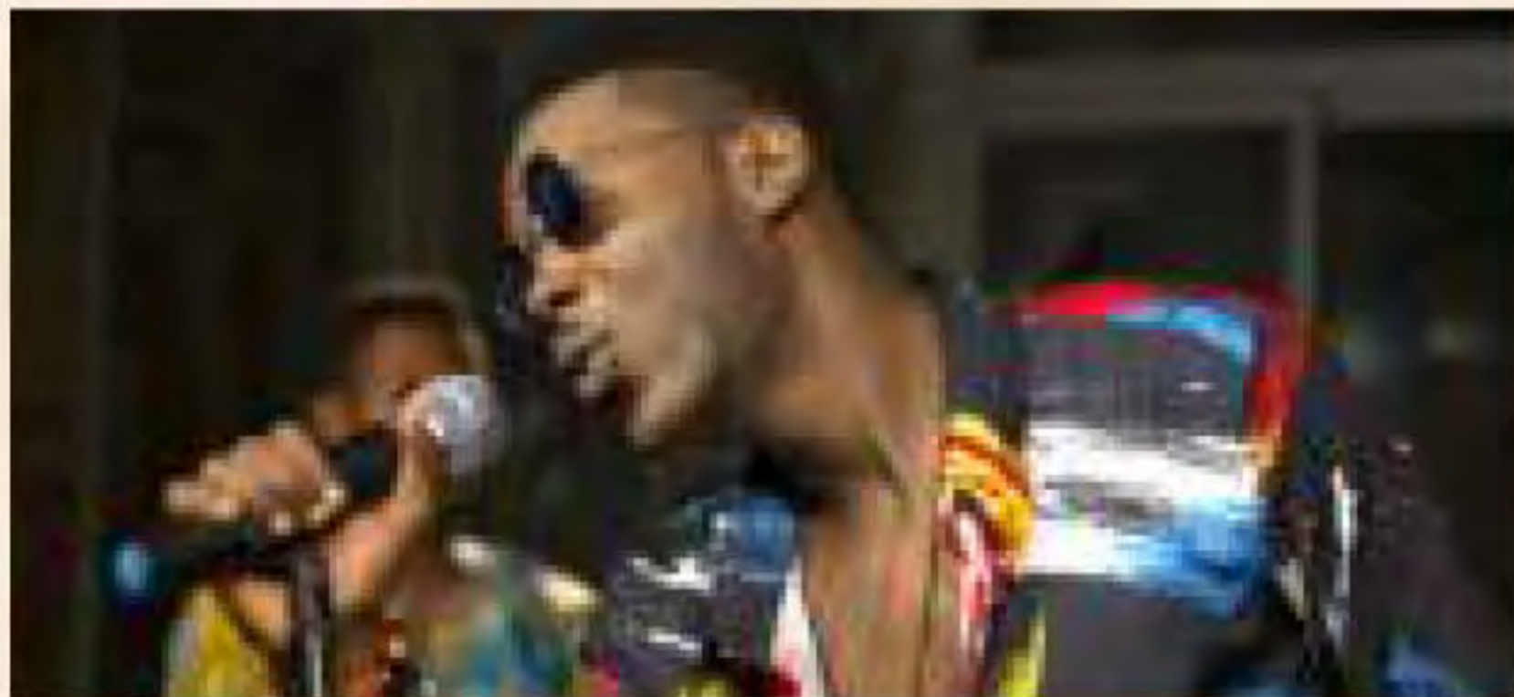
Adekunle Gold Live