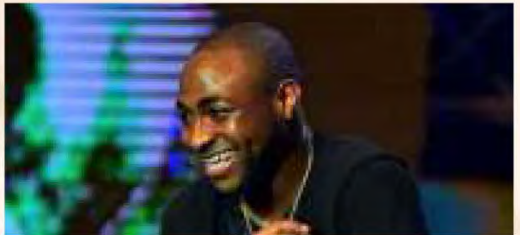
Davido: 30 Billion Gang Concert