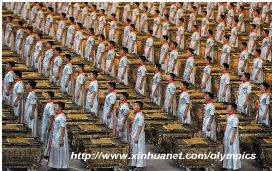
Figure 7. The first image shows the "fou" in the Beijing Olympics opening ceremony; the second image shows the ding from Zhang Yimou's movie Hero