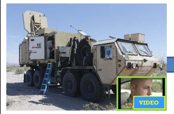
Active Denial System (ADS) Tube-based mm-Wave Demonstrator (Two Systems Exist)