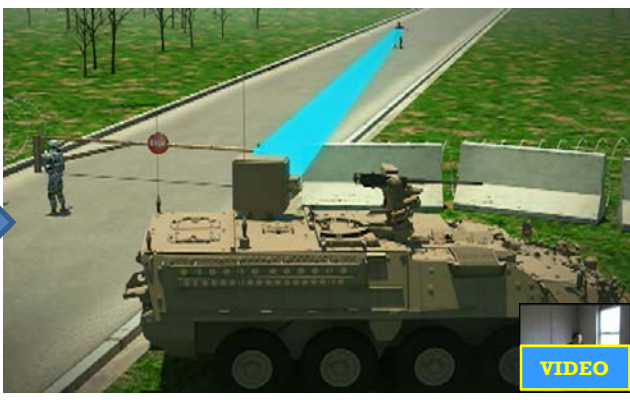
USA – Solid State - Active Denial Technology (ADT) Focused Assessment (Projected 1st QTR 2021)