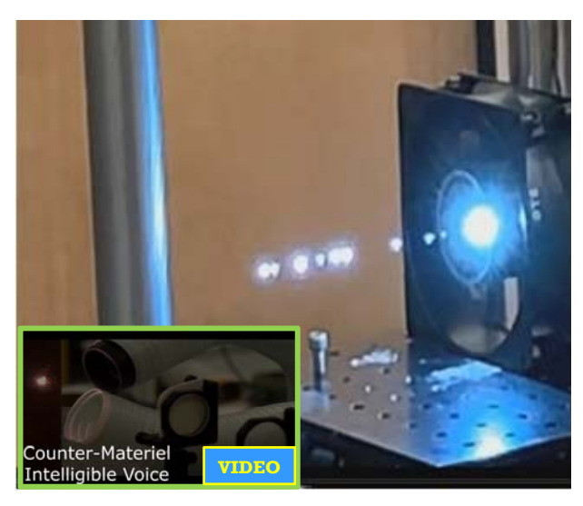
Laser Induced Plasma Effects