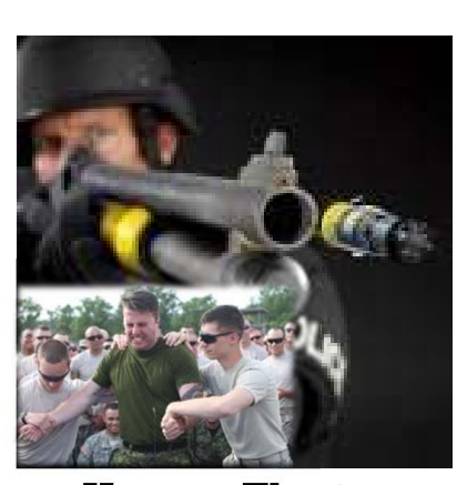
Human Electro-Muscular Incapacitation Munitions