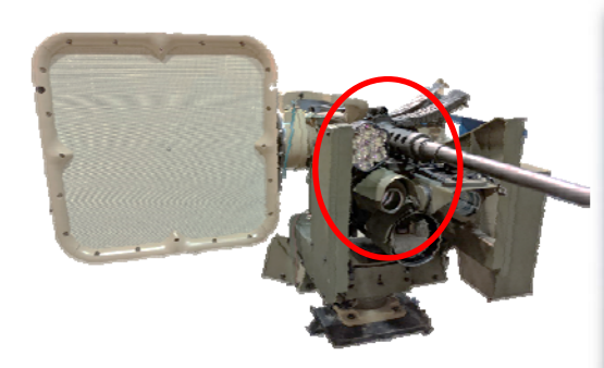
Escalation of Force CROWS Concept for IFC Kit (Projected Demo - FY23)