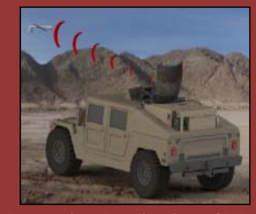
Innovative Application of NL Technologies Collaboration w/ MCWL (Dazzling Lasers; HPM / ADT)