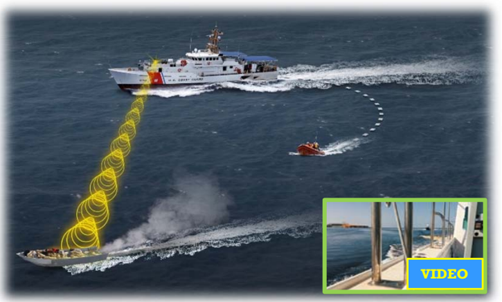
USCG Directed Energy Vessel Stopper Afloat Military Utility Assessment Unlimited (Projected FY24)