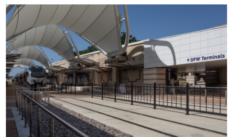
DFW Airport Terminal B Station