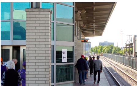
Fort Worth T&P Station 221 W. Lancaster Ave., Fort Worth, TX 76102