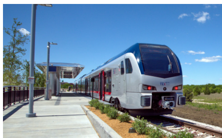
DFW Airport North Station 1867 Dallas Rd., Grapevine, TX 75261