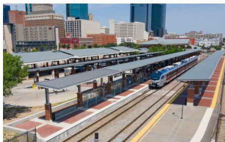
Fort Worth Central Station 1001 Jones St., Fort Worth, TX 76102