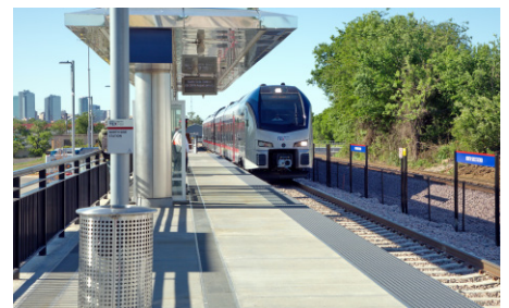
North Side Station 2829 Decatur Ave., Fort Worth, TX 76106