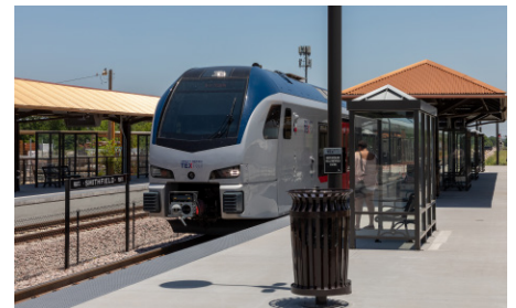
North Richland Hills/Smithfield Station 6420 Smithfield Rd., N. Richland Hills, TX 76182