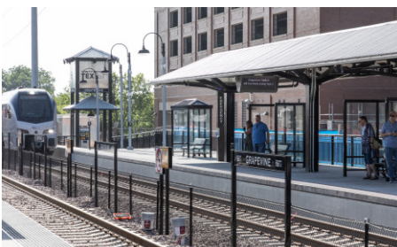
Grapevine/Main Street Station 801 S. Main St., Grapevine, TX 76051