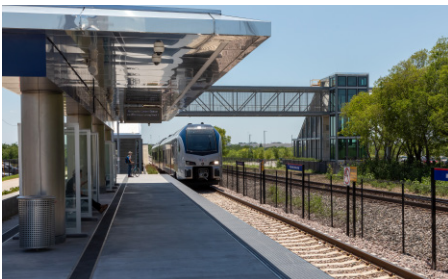
Mercantile Center Station 4233 N. Beach St., Fort Worth, TX 76137