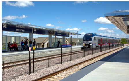
North Richland Hills/Iron Horse Station 6531 Iron Horse Blvd., N. Richland Hills, TX 76180