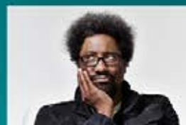
Kamau Bell United Shades of America