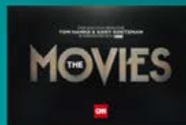
CNN The Movies