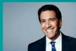
Sanjay Gupta Chasing Life