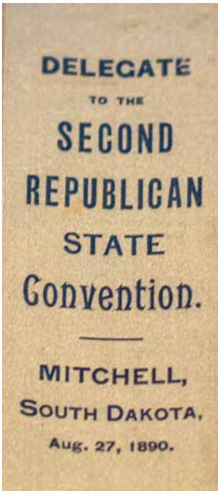
GOP Convention to be held virtually, continued from page 1

form for its virtual convention after clear demonstrations that Voatz could handle the dynamic nature of the convention and the potential for runoff rounds of voting. The platform will allow delegates to vote securely, privately, and electronically through their mobile phones. Voatz helps to make the voting process safe and verifiable for delegates and candidates.