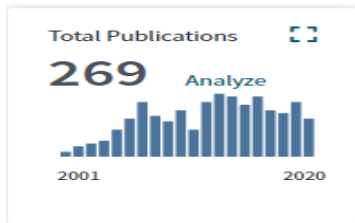
Published Items in Each Year