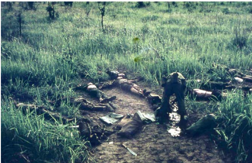
NVA dead in front of the 102 guns

As the Australians began to recover and count the cost it was revealed that nine Australians had been killed and twenty eight wounded. Jensen's Mortar Line bore the brunt of the casualties with five dead and eight wounded out of eighteen men. Two Gunners were dead and four wounded. Fifty two NVA dead lay strewn around the guns and mortars and one NVA soldier was taken prisoner. Two of Jensen's mortars were damaged and one 105 mm Howitzer was damaged beyond immediate repair and had to be flown out, another had both tyres blown out and a hole in its trail but the gun stayed in action. The 102 Battery O sized bulldozer was riddled with small arms fire and also had to be back loaded. Every piece of canvas (used for ammunition bays) was shredded and all personal sleeping tents ('Hoochies') riddled with bullet and shrapnel holes.