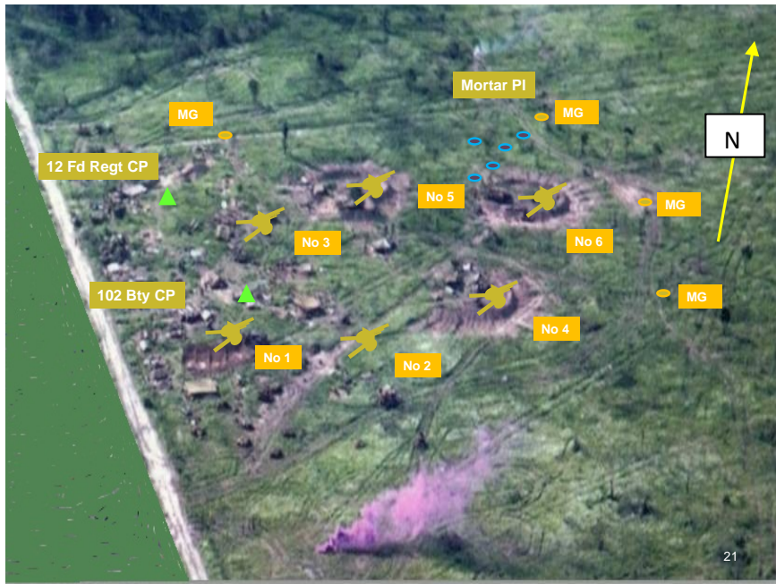
Aerial photograph showing state of 102 and Mortars at of last light 12 May

The photograph of the 102 Battery position below has been rendered from a photograph taken by then Gunner Ross Alexander on the 13 May 1968. It shows the gun and mortar position as it was at last light on 12 May 1968.