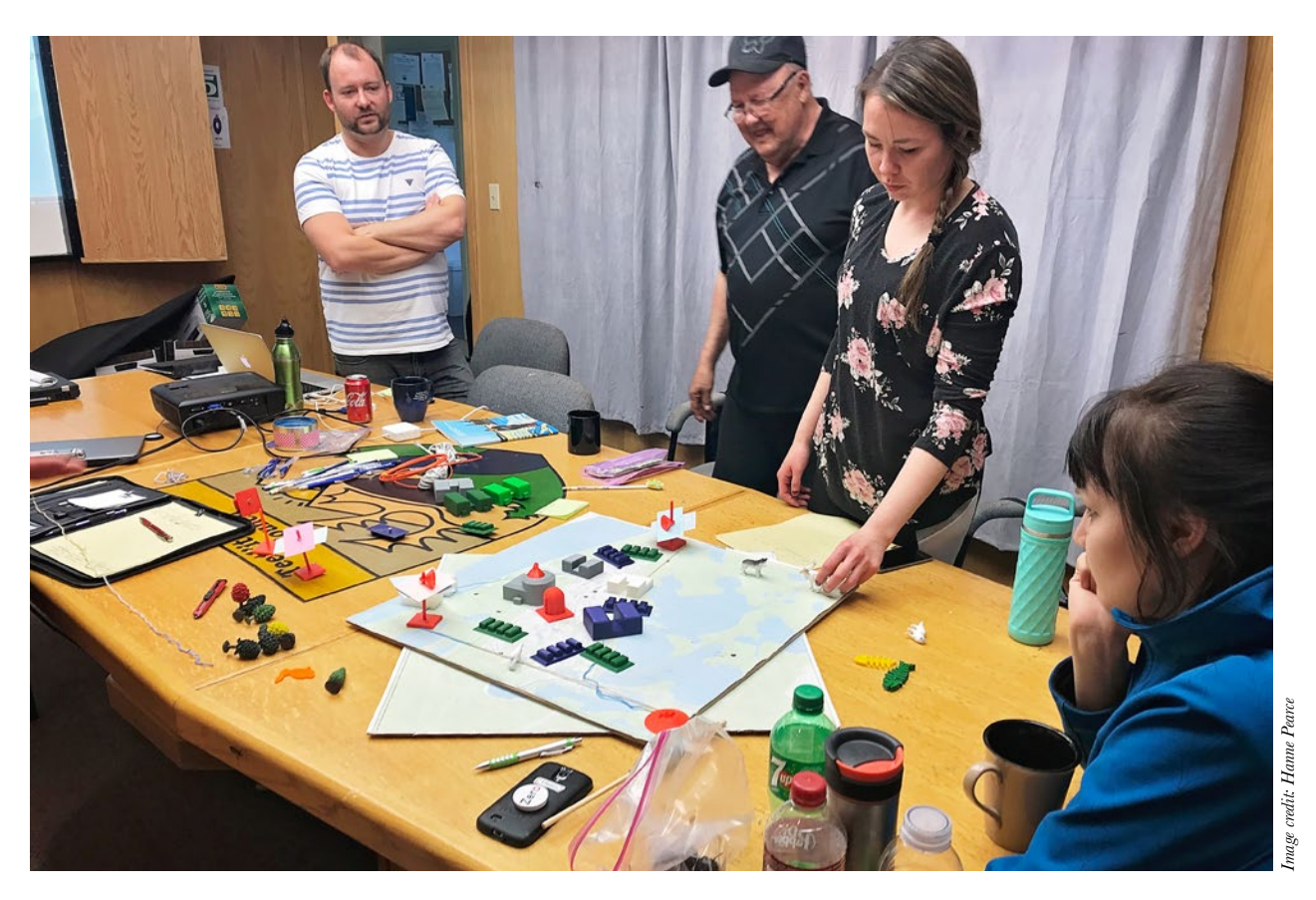
Participants explore digital content and connectivity in Gwich'in contexts at the June 2018 workshop in Teet it Zheh (Fort McPherson).

Dempster fibre project, and satellite infrastructure in Nunavut. But despite these gains, critics note these projects lack a clear definition of "open access" requirements.