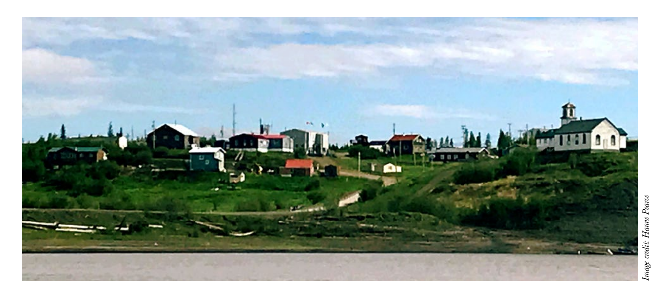
Tsiigehtchic from the ferry.

content; one day on connectivity), incorporate more hands-on activities, and host the free workshops in the NWT Gwich'in communities in summer 2018. We began refining our pilot resources to focus on different aspects of Indigenous digital literacy (connectivity and content) in the context of the Gwich'in people of the NWT.