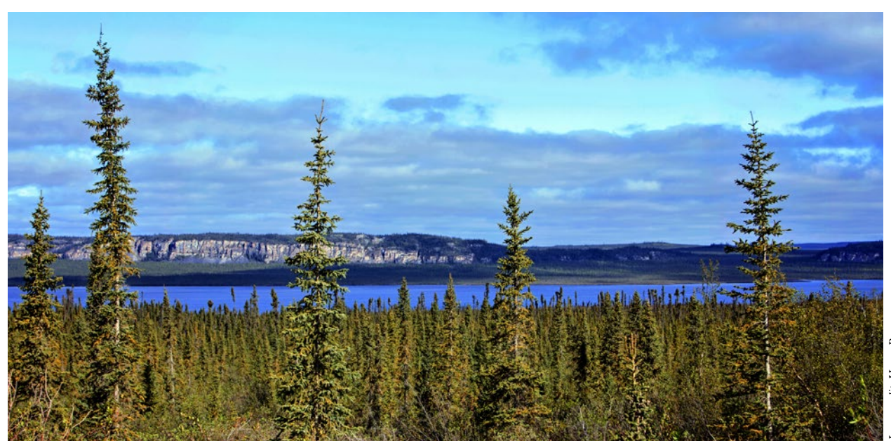
Scenery on the Dempster Highway between Tsiigehtchic and Teet Iit Zheh.

Building on issues discussed at Bridging the Gap, we collaborated with the GTC in planning a follow-up project. This took shape as we developed and hosted a day-long pilot workshop in Inuvik that involved Gwich'in community members in the co-development of appropriate digital literacy resources. A total of 19 people participated in the workshop, including youth who travelled by road and plane from four Gwich'in communities: Teet'fit Zheh (Fort McPherson), Tsiigehtchic, Aklavik and Inuvik. Participants from Inuvialuit and non-Indigenous communities also joined as delegates. The workshop blended presentations and discussion. Along with an introduction to key aspects of digital content and connectivity, it showcased Northern-based projects