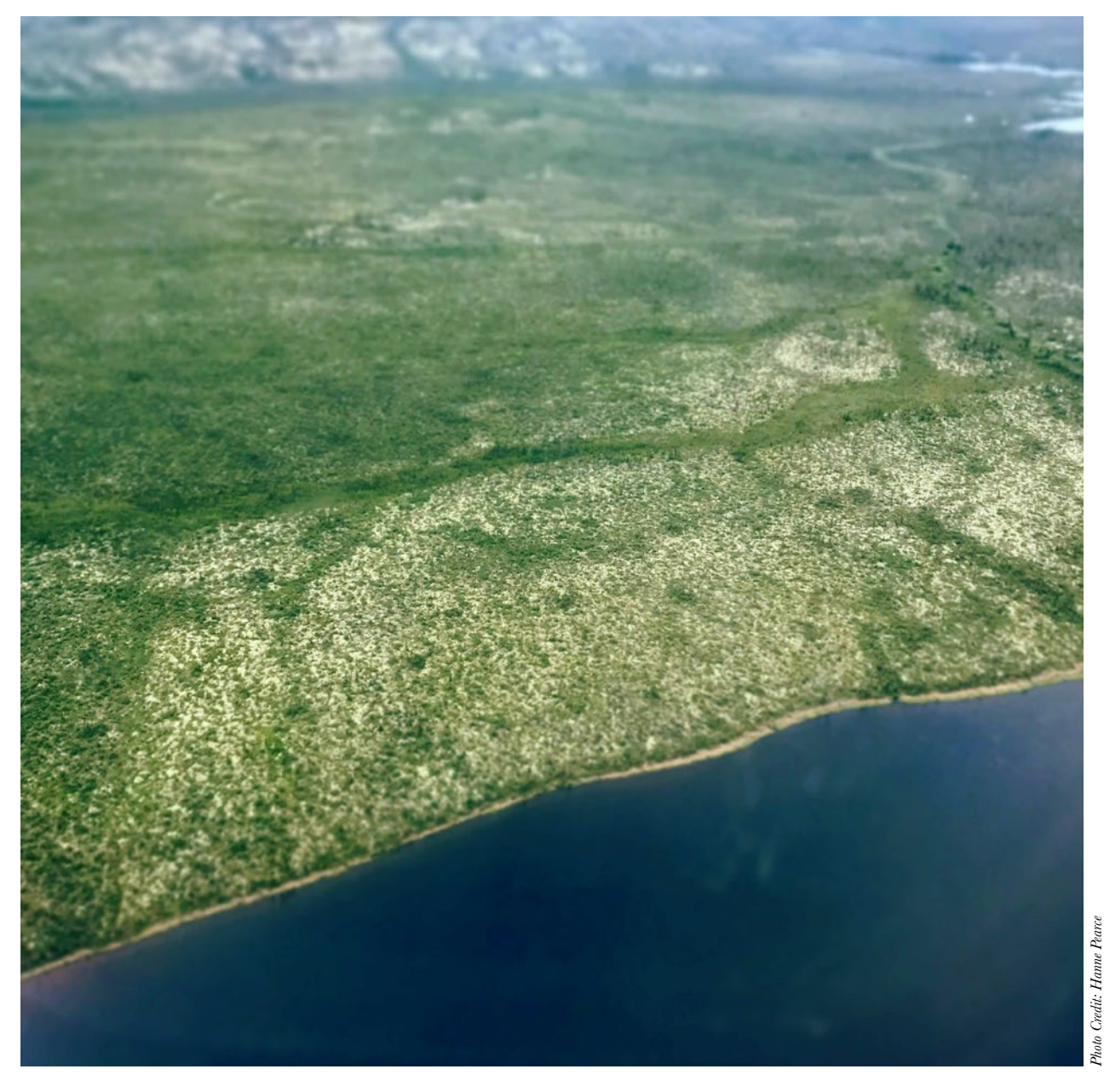
Aerial photo of Gwich'in lands, taken on departure from Inuvik, June 2018

This project was made possible through a grant from the Canadian Internet Registration Authority's .CA Community Investment Program. We also received funding support from the Government of the Northwest Territories' Department of Education, Culture & Employment and Department of Industry, Tourism and Investment. We acknowledge and thank our partners at Gwich'in Tribal Council, UAlberta North, the Faculty of Extension, the School of Library and Information Studies, and the libraries at the University of Alberta for their support for this project.