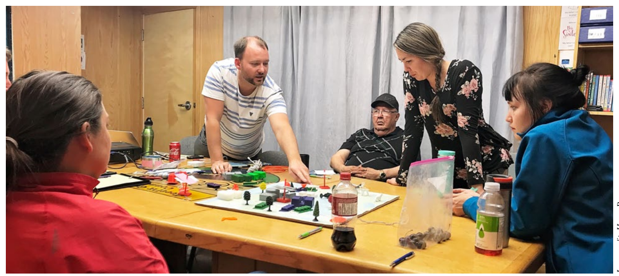
Participants explore digital content and connectivity in Gwich'in contexts at the June 2018 workshop in Teet lit Zheh (Fort McPherson).

With regards to affordability, the CRTC has generally encouraged competition, though it has stepped in to regulate retail rates in some Northern